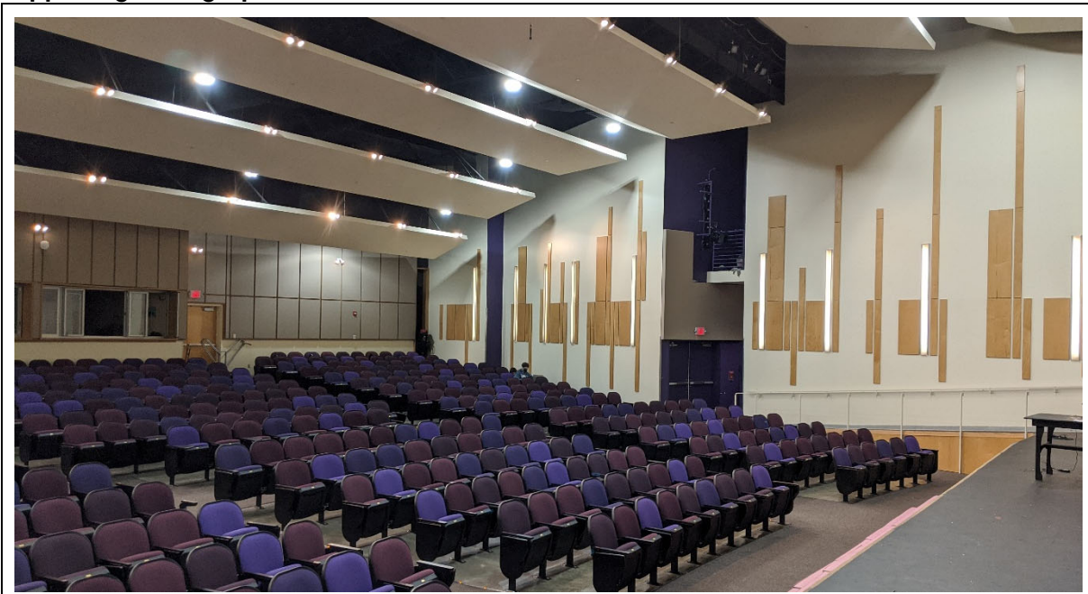
Visual and Performing Arts: Theater and drama expansion is the newest addition to the school