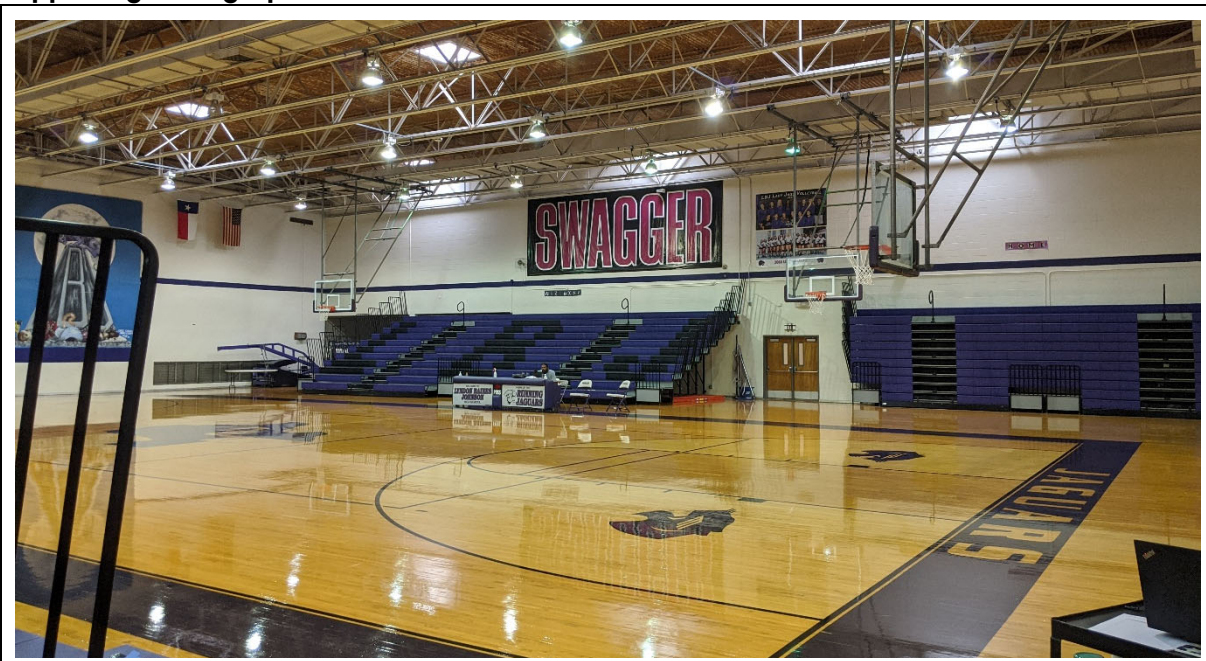
Gym is original to school. Insulation falls from exposed ceiling and paint is peeling from walls.