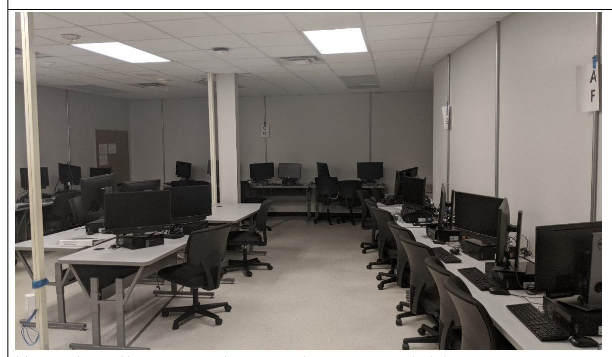
Many studios and learning spaces have no windows or access to daylight.