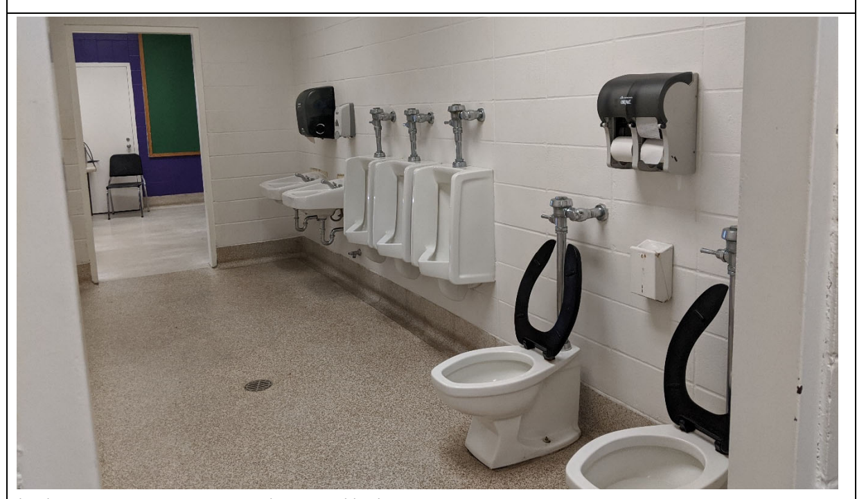
Locker rooms are in poor condition and lack privacy.