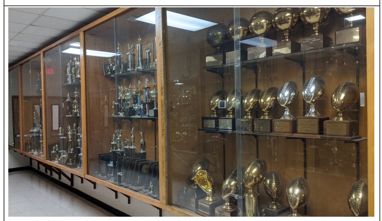
Large display cases show the success and pride the school takes in athletics.