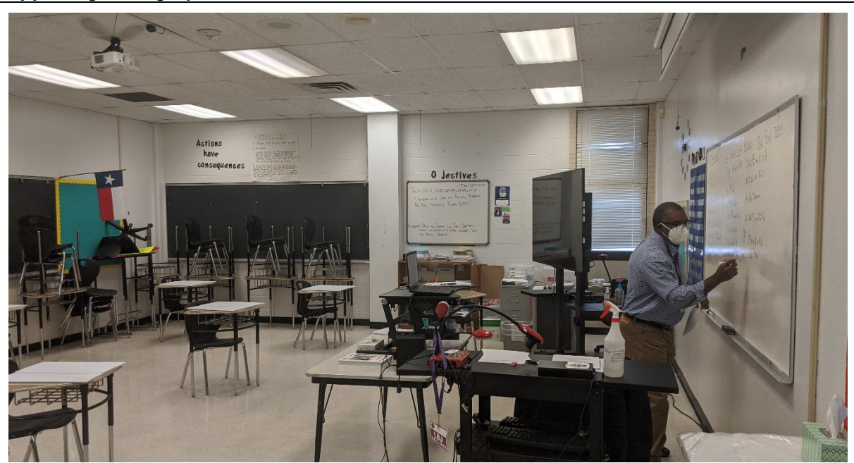
Windows in studios are too small and let in minimal daylight.