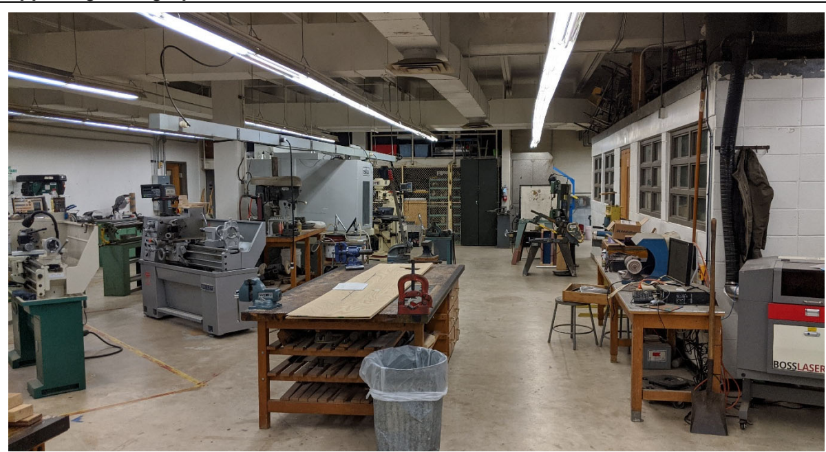
CTE: Well-equipped manufacturing shop with a wide variety of tools and equipment.