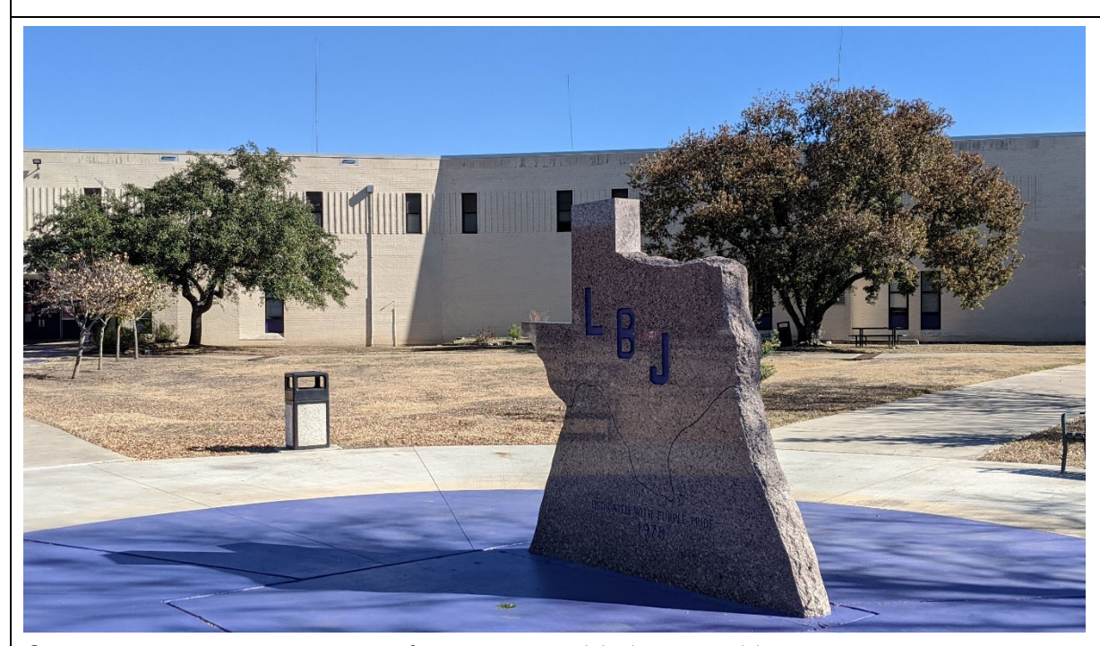
Granite monument sign at center of entry courtyard. Lighting would increase its impact