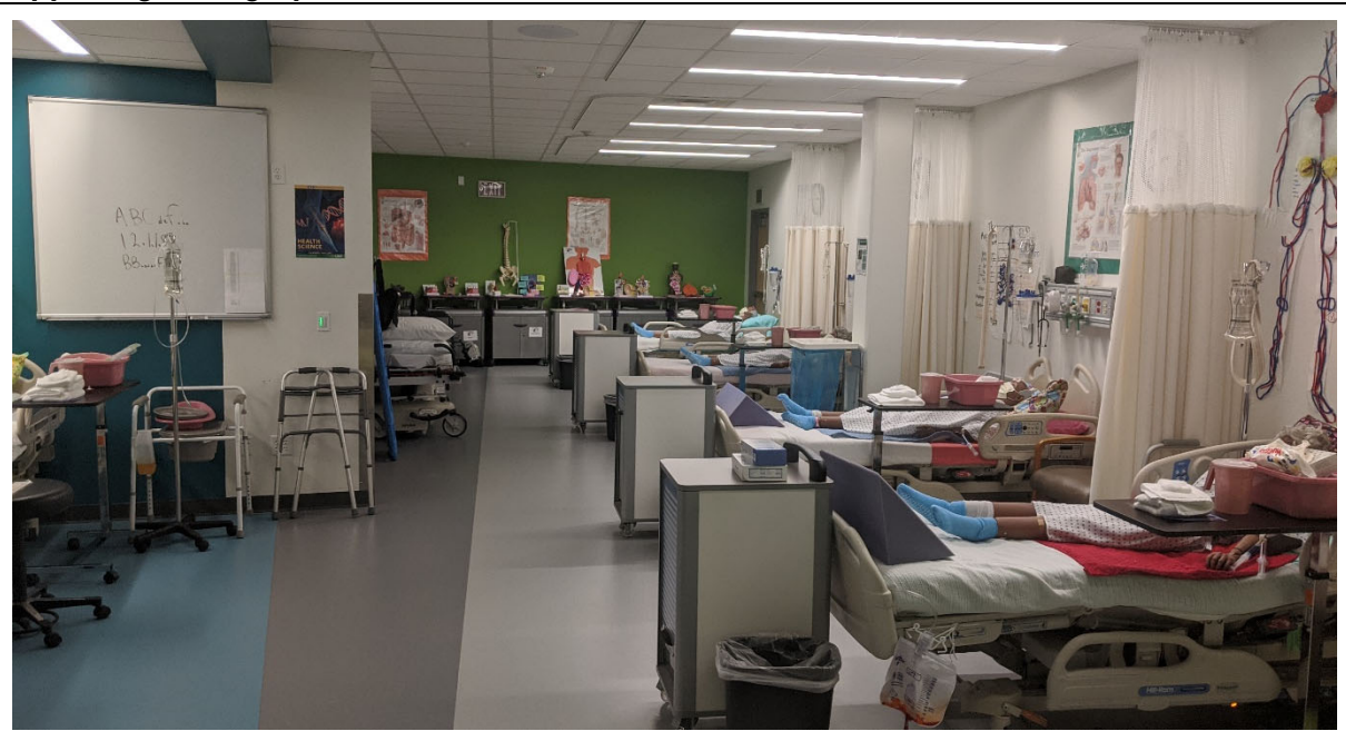
CTE: Health science lab is new and very well-equipped.