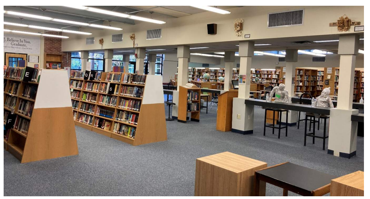
Media Center: The library is in good condition but needs mobile furniture and technology updates.