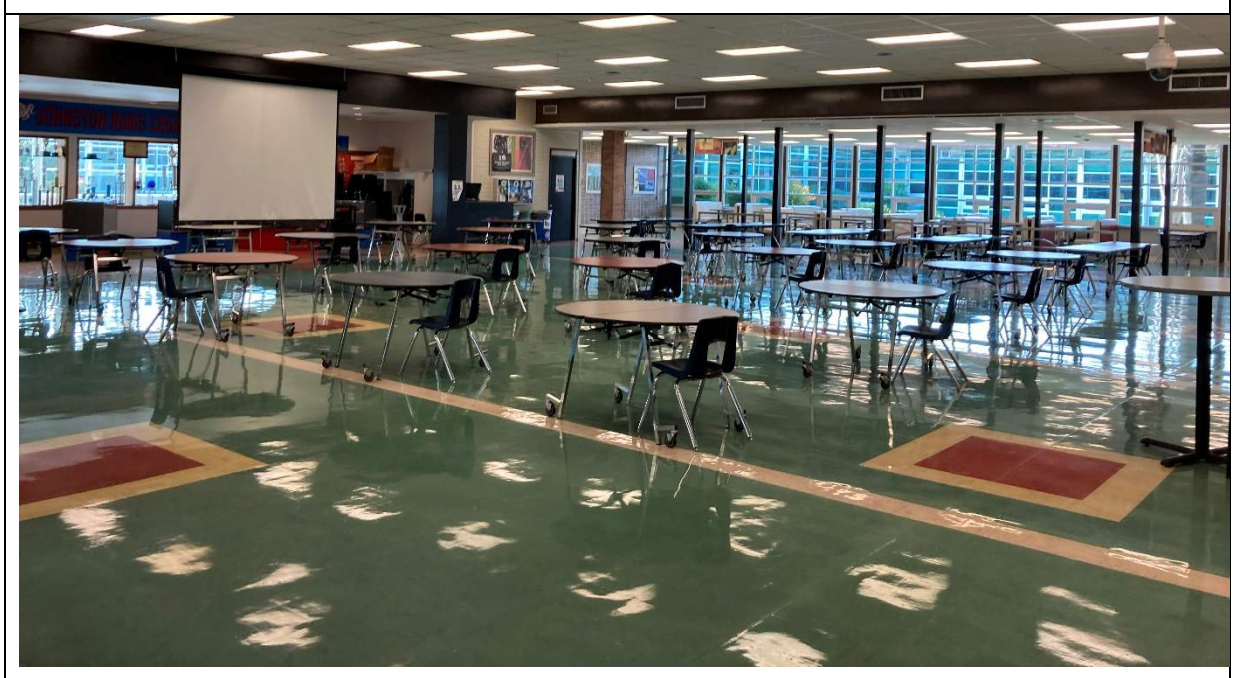
The furniture in the cafeteria is not mobile and there is no projector.