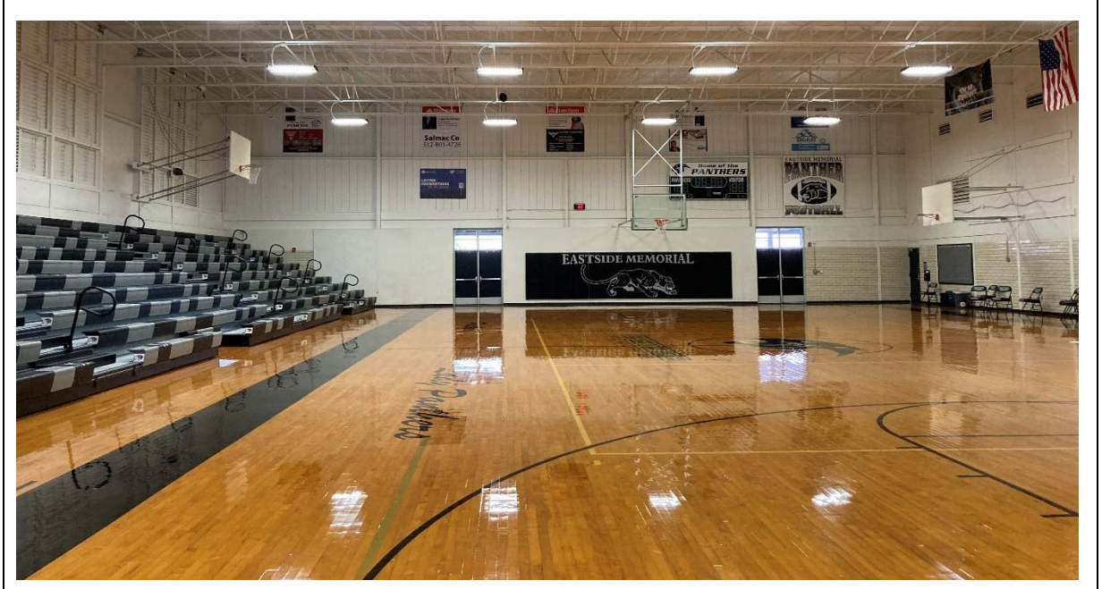
The main gym is too small to support bleachers on either side of the playing area and lacks dedicated restrooms.