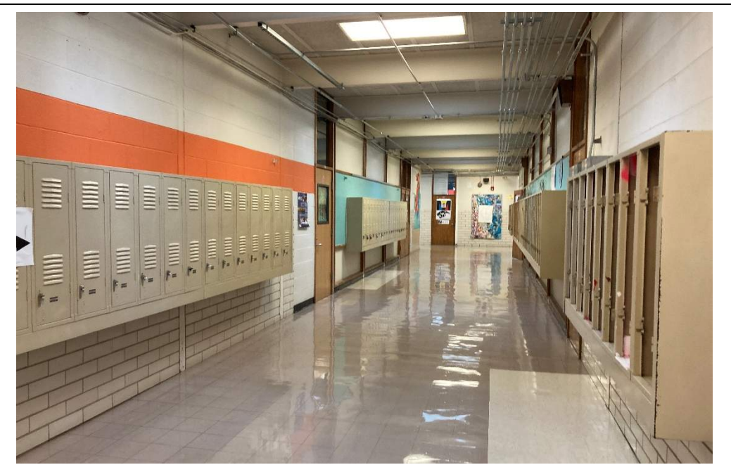
Typical corridors have no transparency into the studios and some lockers appear to be damaged/broken.