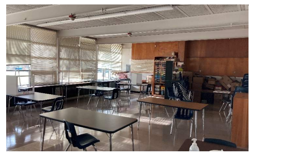
Typical studios have plenty of daylight but need mobile furniture and movable partitions to fully support project-based learning.