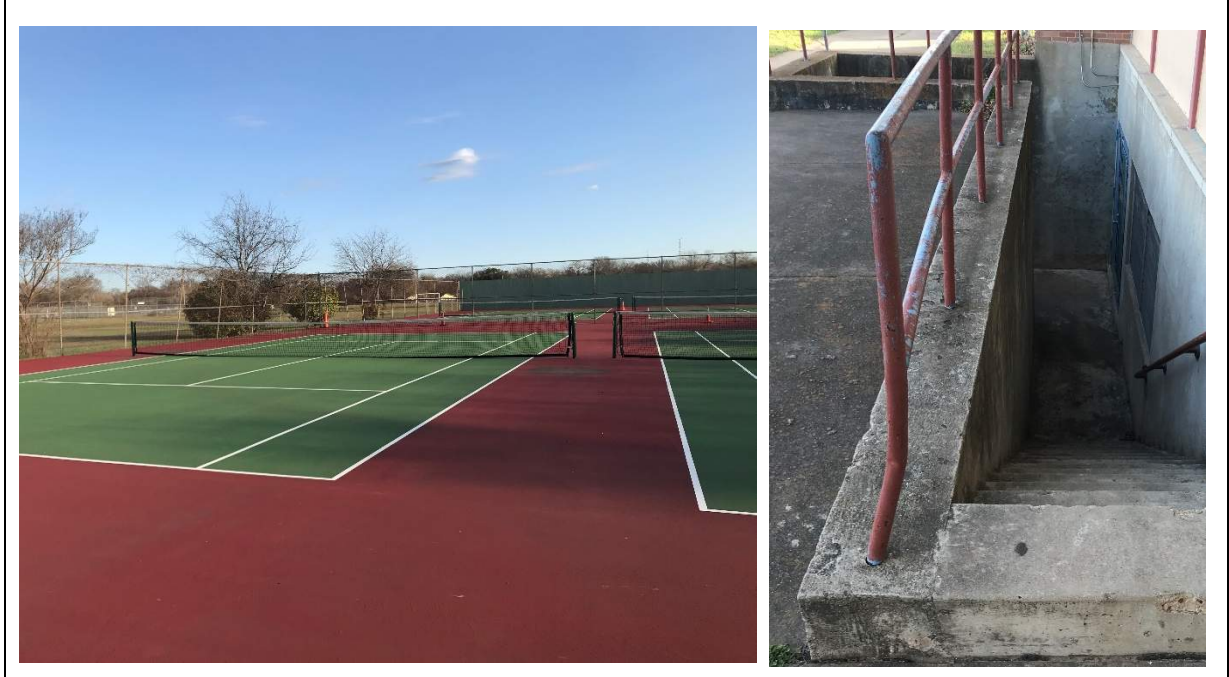
Tennis courts appear to be new and/or in good condition (left). Exterior handrailing is bent with peeling paint and stairs pose a trip hazard (right).

The campus has plenty of courtyards that bring in natural light and provide opportunities for outdoor learning and dining. Renovations are needed to bring some of the courtyards into ADA compliance.