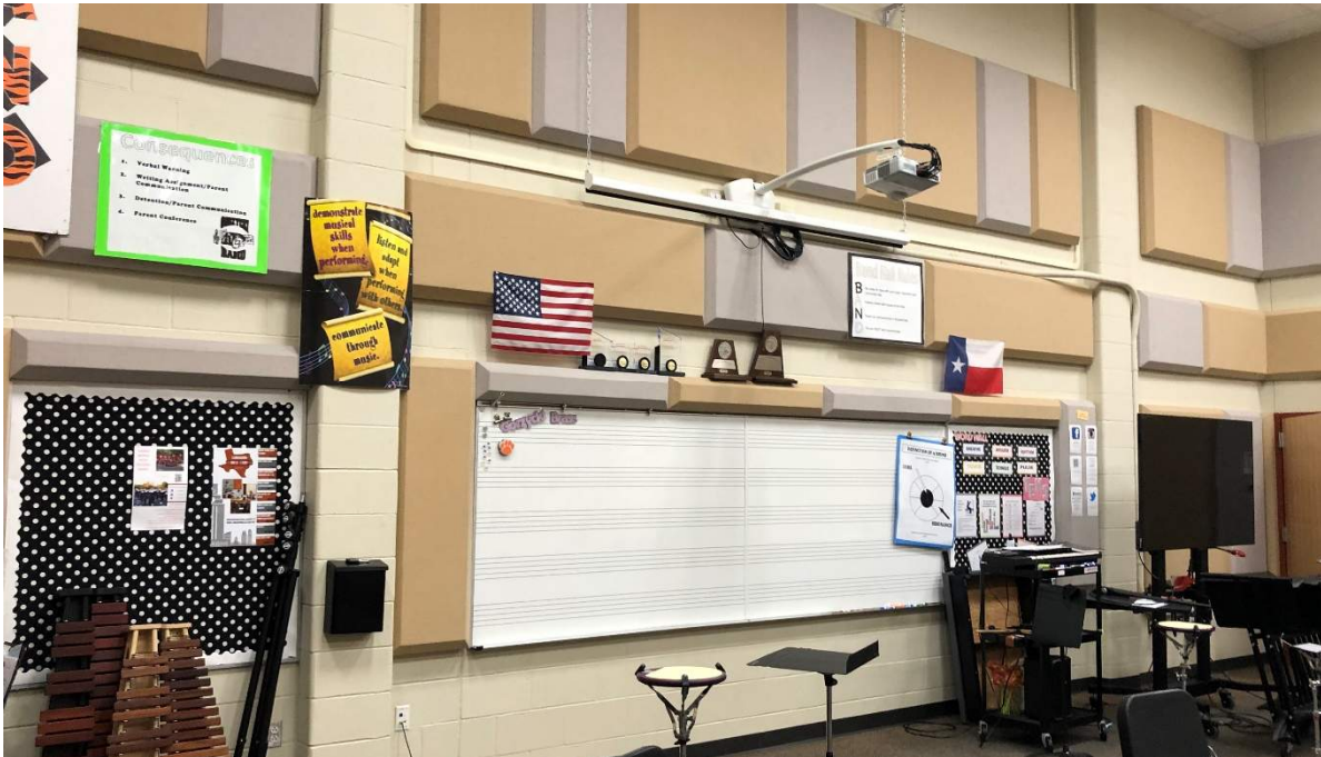
Band room is well-sized and in good condition with technology to function well.