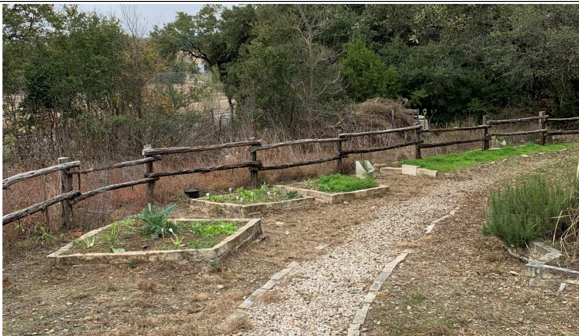
Campus gardens are well-located by outdoor learning area and water access.