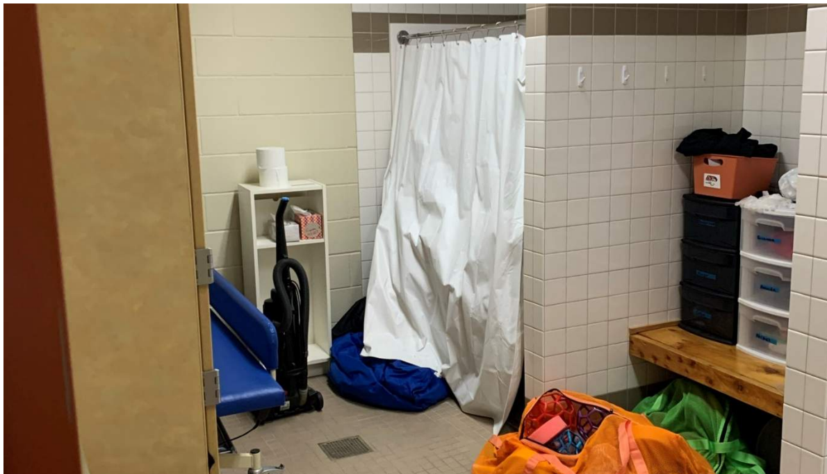
Special education restroom is well-connected to special education studio with ample space but partly used as storage.