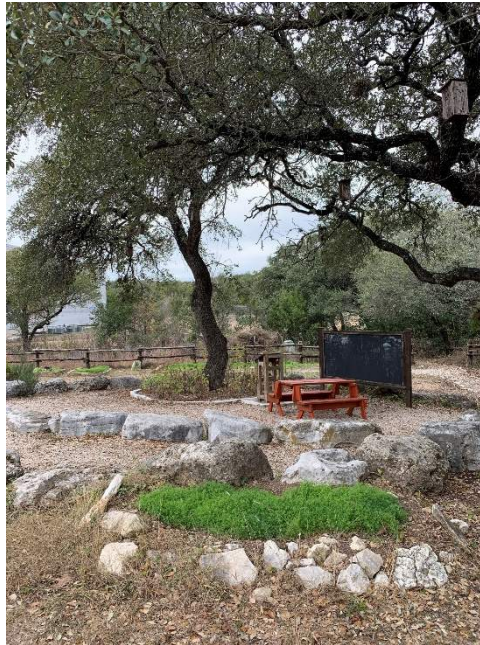
Exterior learning garden with furniture, storage shed and chicken coop.