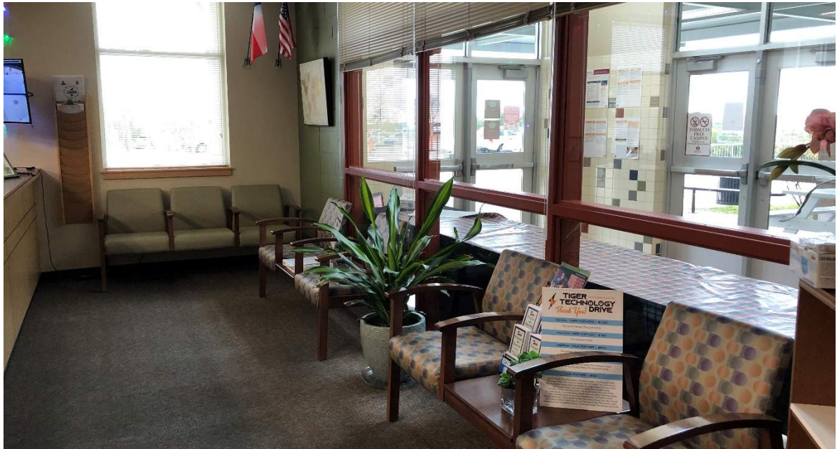
Administration Spaces: Front office seating area with sufficient transparency to front door and secure vestibule.