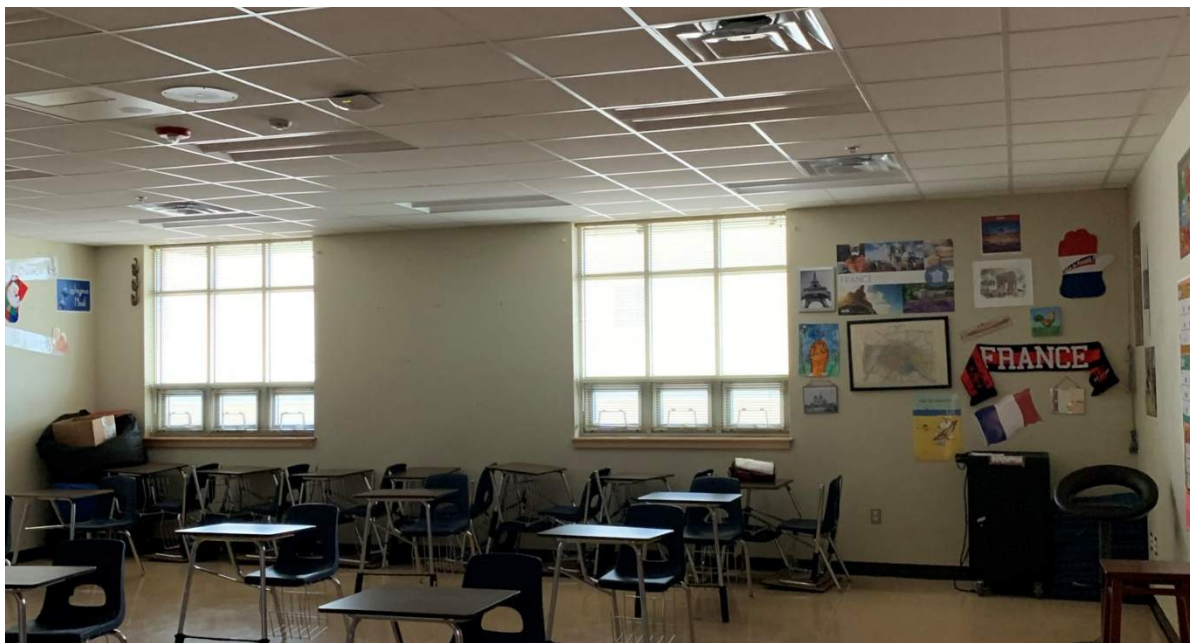
Typical studio furniture with connected chairs and desks is not flexible and easily reconfigured. Studios have good access to natural light and views to exterior.