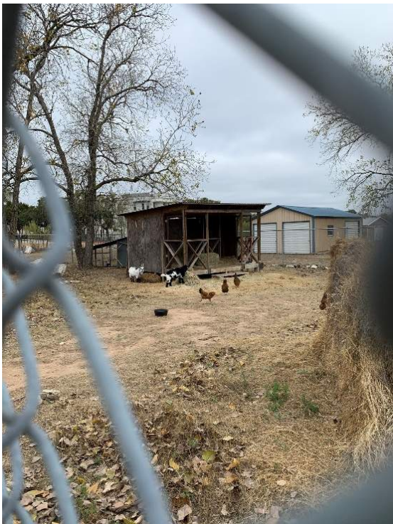
Outdoor learning space with goat raising and more chickens.