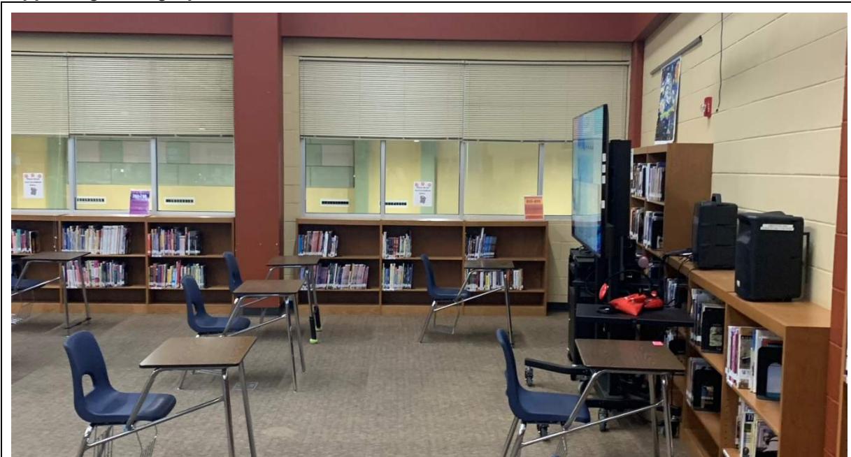
Media Center: Library is in good condition, but most furniture is not reconfigurable or easily movable.