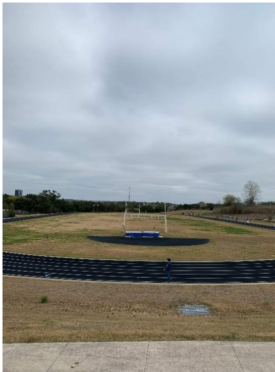
Play field and track are in good condition.