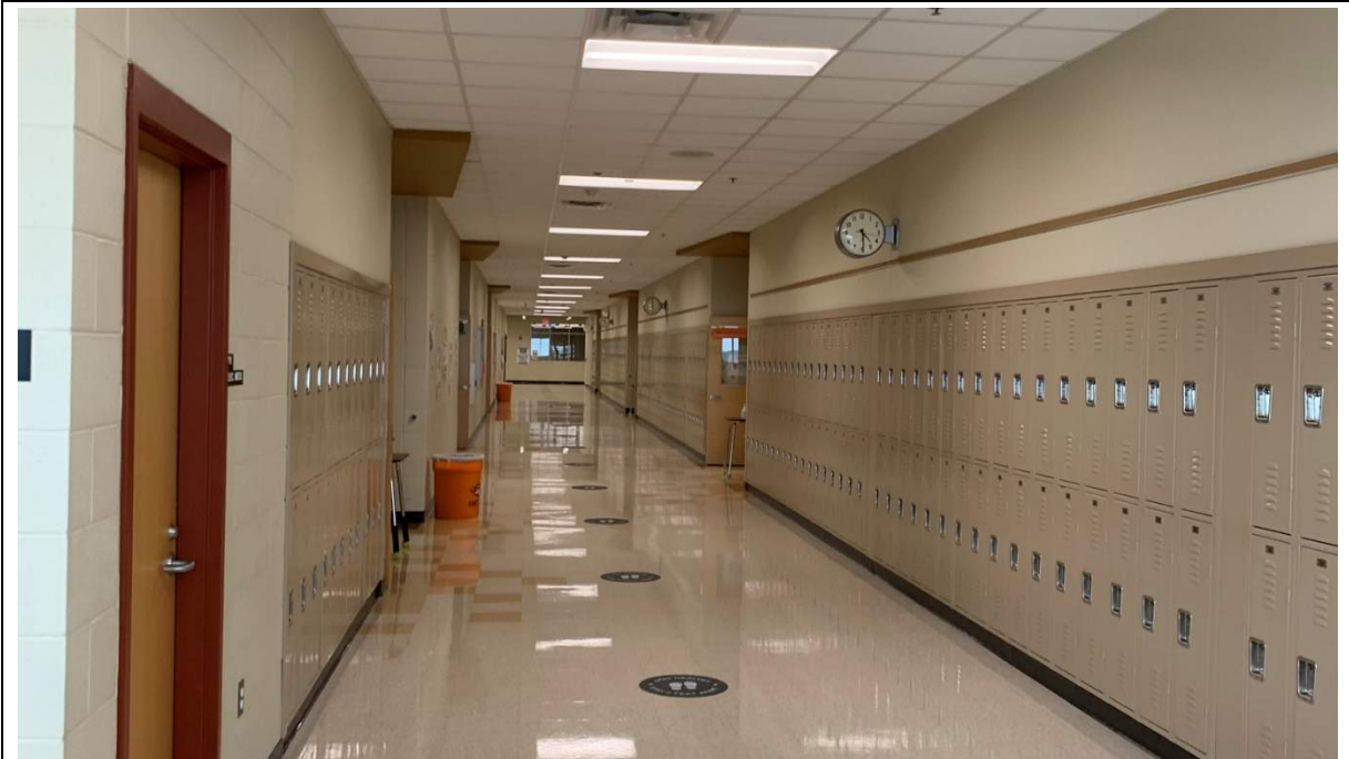
Typical corridor at learning neighborhoods is sufficiently wide enough for safe and effective circulation, but there is a lack of dedicated collaboration spaces.