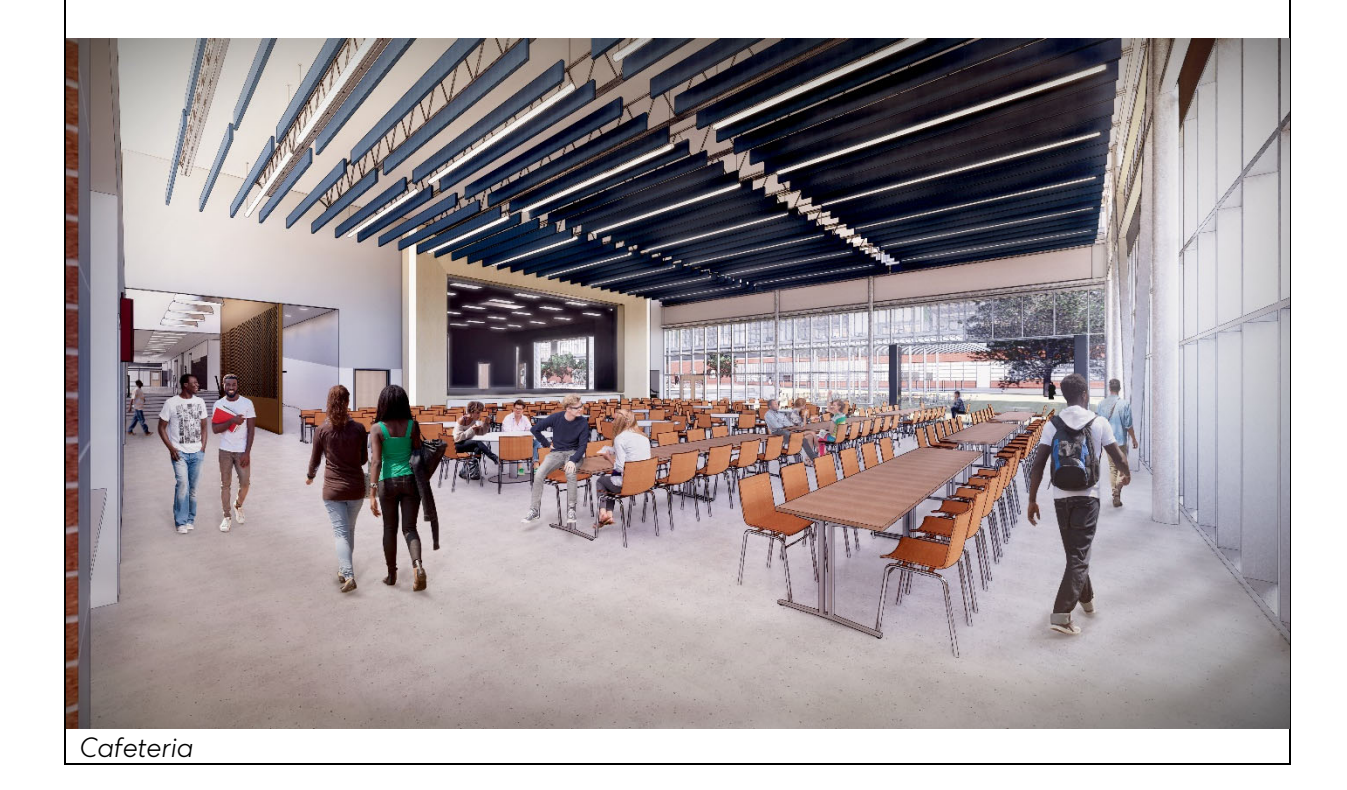
Page 6 of 7