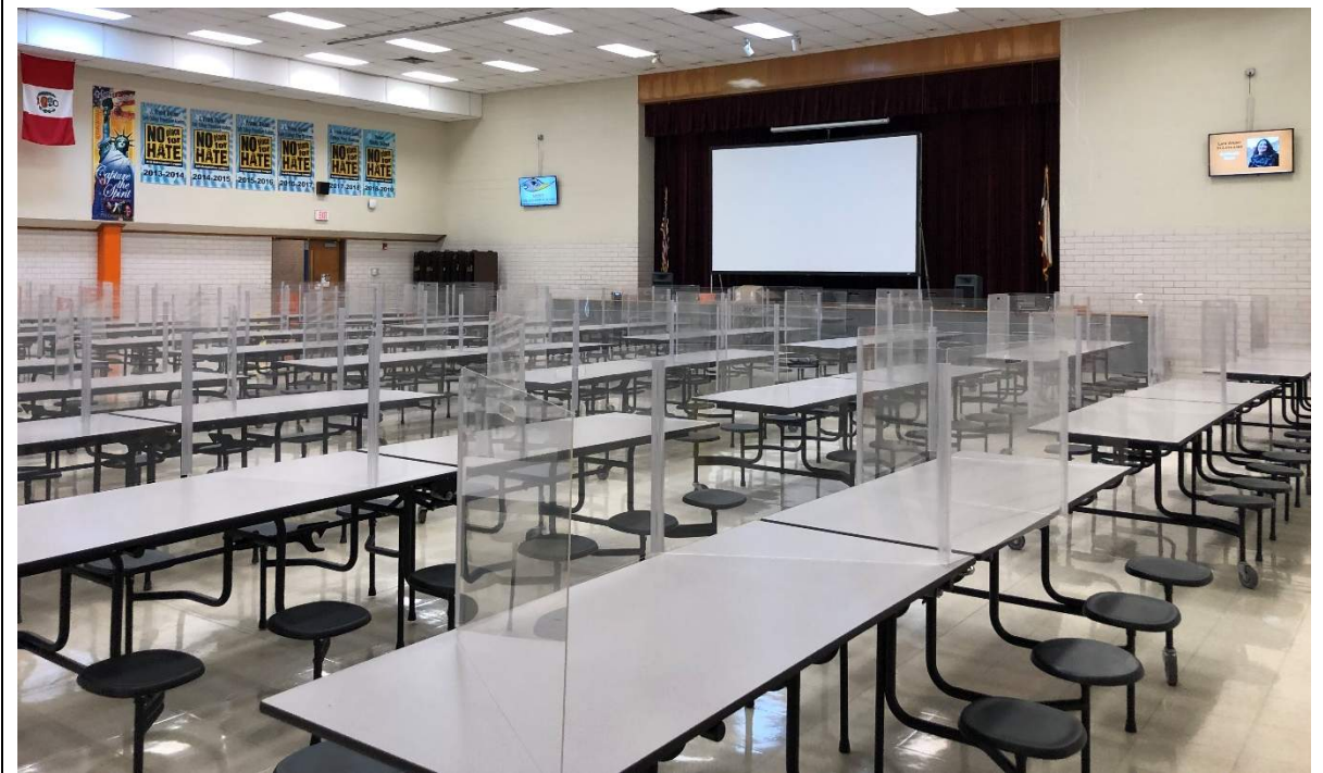
Only one type of furniture is available in the cafeteria, which is bulky and hard to reconfigure. Stage storage is inadequate, and stage is only accessible by stairs.