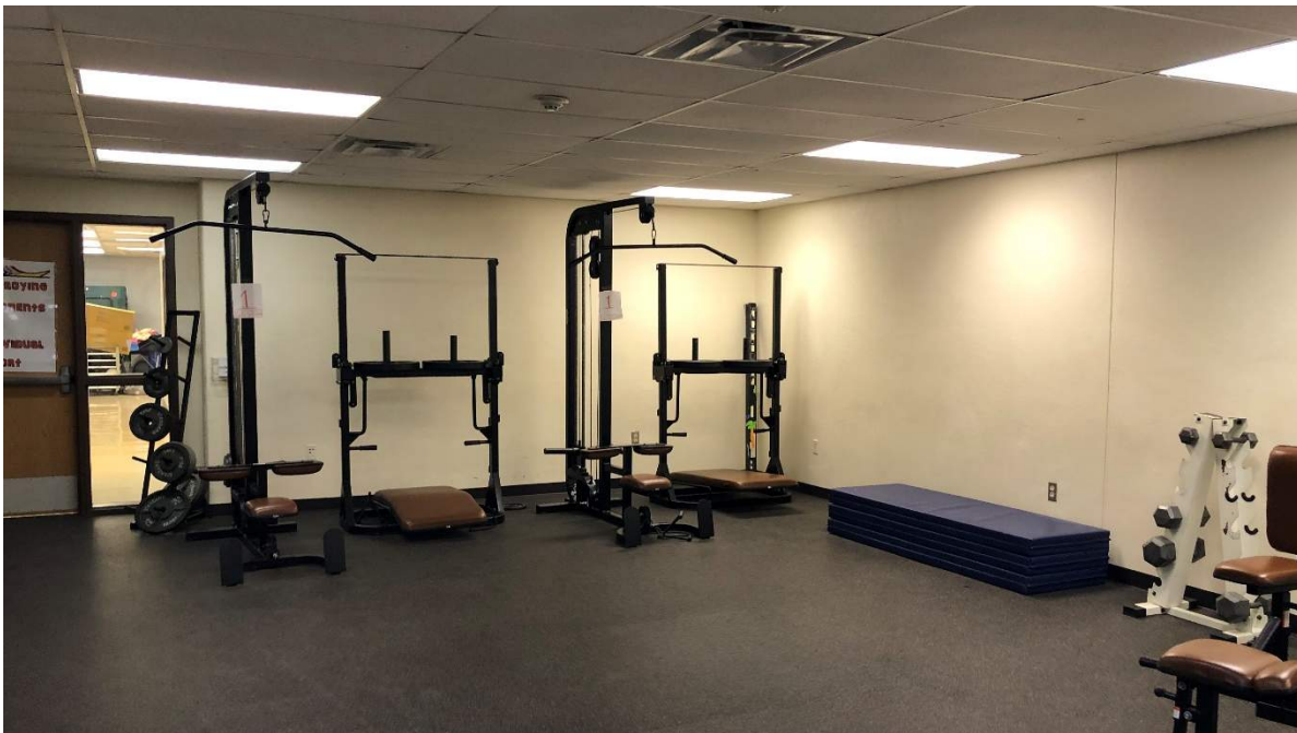
Weight room is adequate size and in good condition.