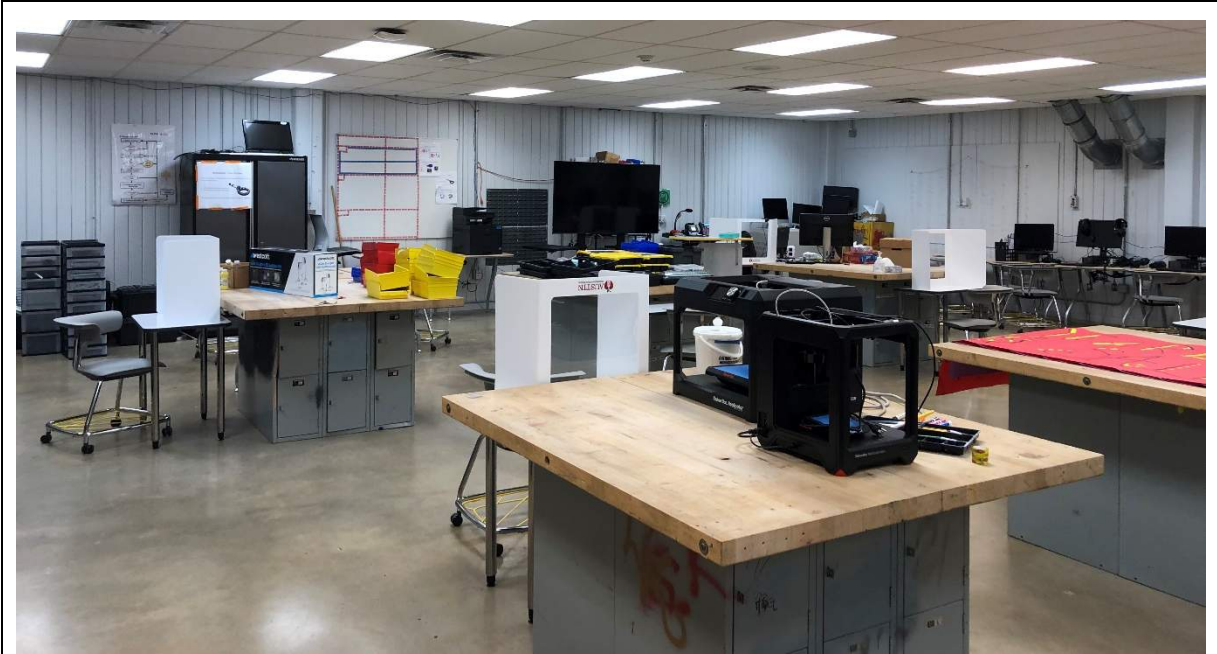
No designated maker space, but the provided space is used for various purposes and programs and doubles as a maker space.