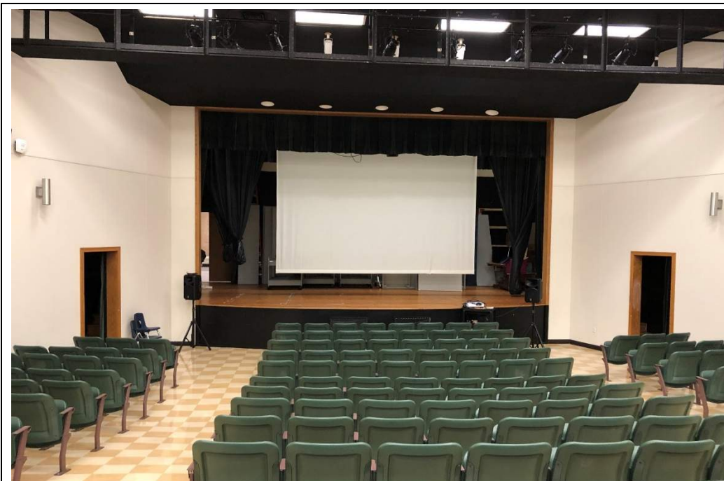
Performance Stage: Overall in good condition but lacks adequate storage in the back of the stage.