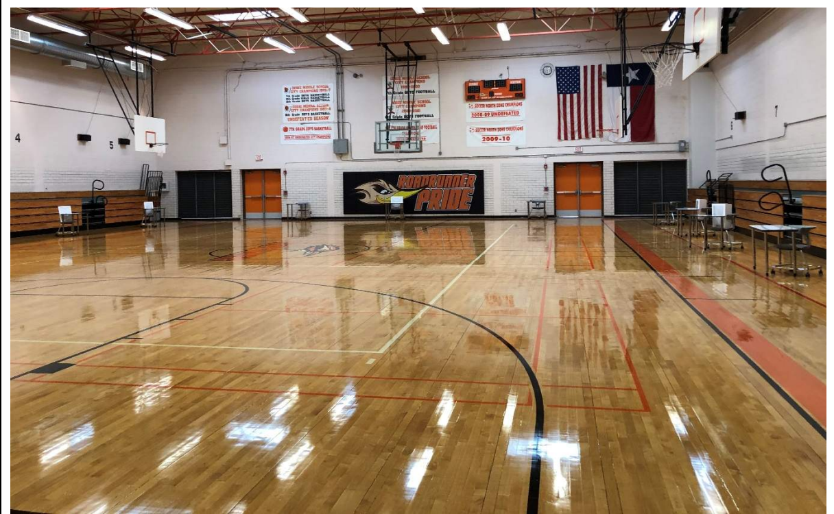
Gym is adequately sized and in good condition; it has good storage and updated flooring.