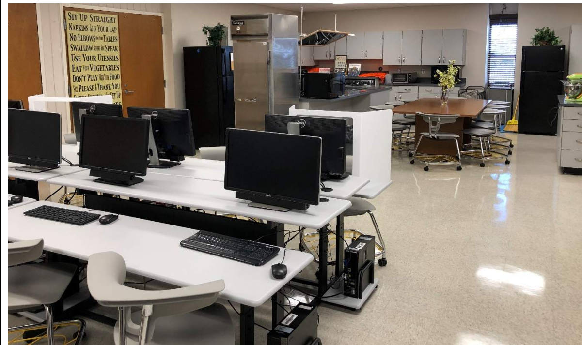
Culinary Arts Room: Space needs a larger room for kitchen equipment and resources.