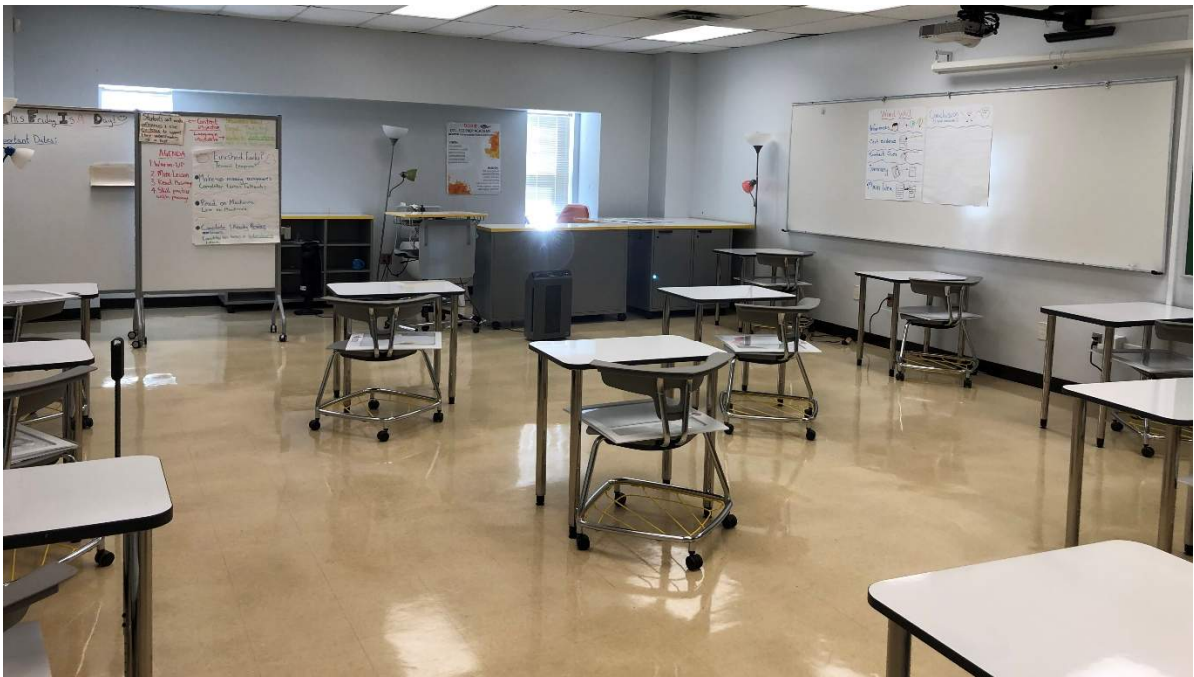
Inadequate natural light and light control system in typical studio. There is a mix of new and old technology, and projector needs updates. Flexible furniture is provided.