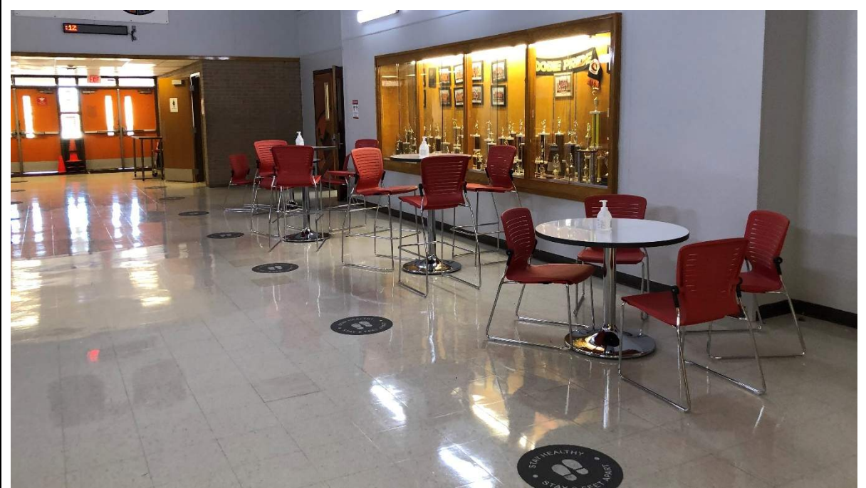
Furniture in the hallways provides a few breakout spaces. Display cases are adequate.