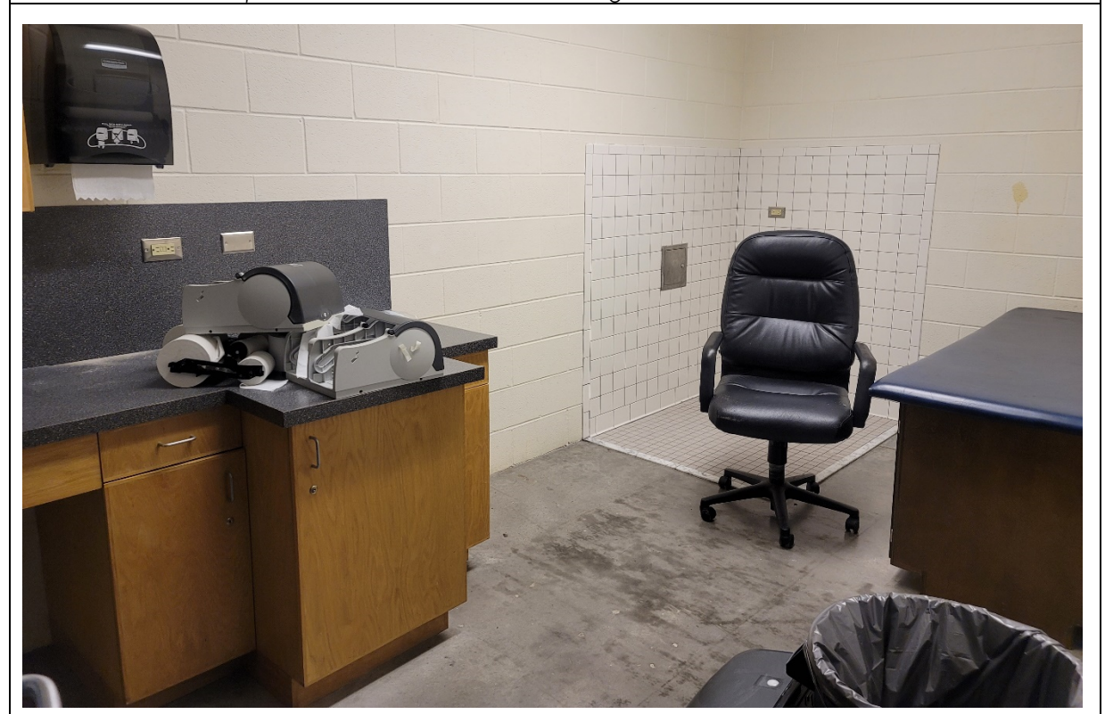
Training room needs updates and resources to function properly.