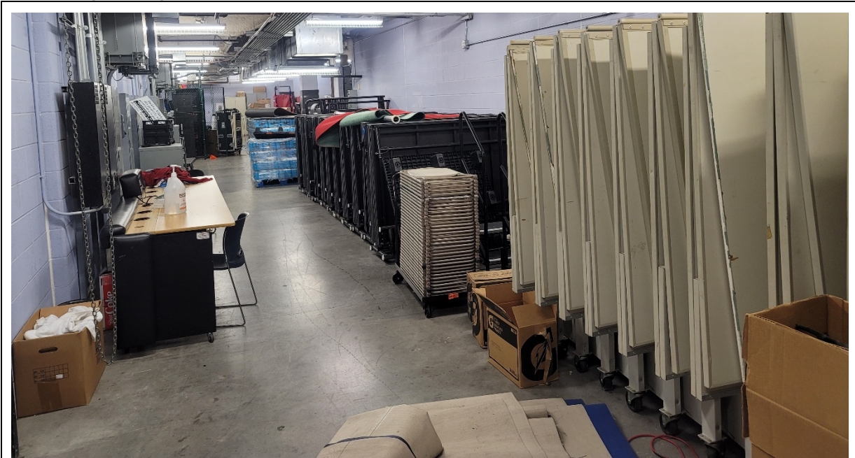
Main storage area also serves as a storage space for some high school gym equipment.