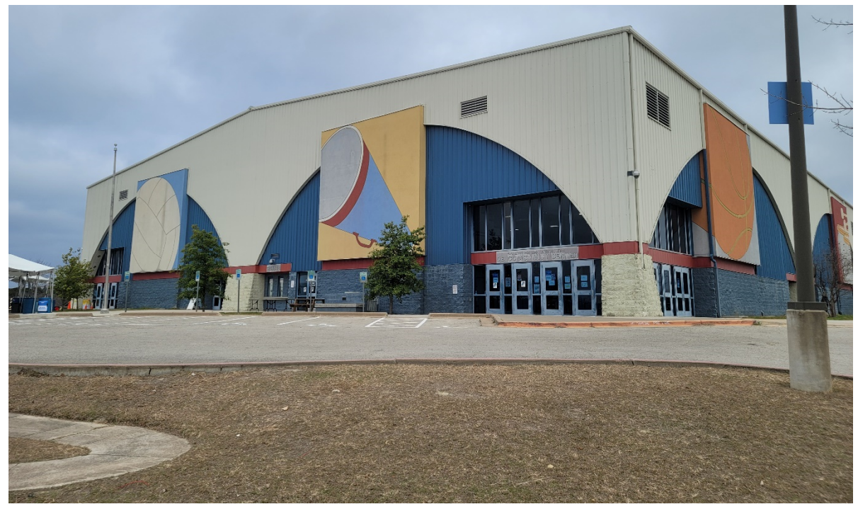
Overall exterior of the building is in good shape. Facility takes pride in the exterior graphics and the staff says they should be preserved.