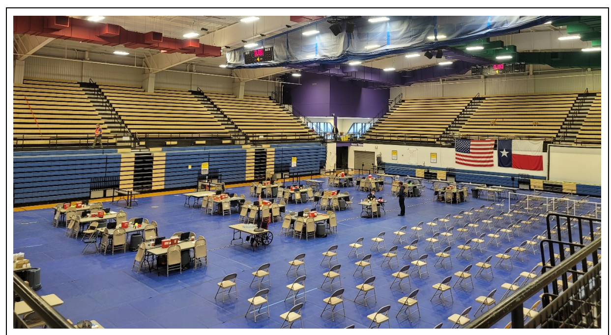
Main arena has manual bleachers in the lower section, which are hard to operate. Picture shows arena functioning as a site for COVID-19 vaccinations.