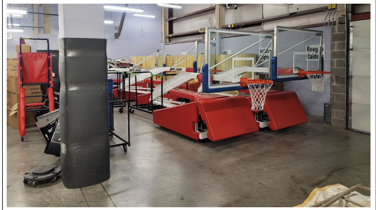
Main Storage Area: Finding free floor space is difficult at times, due to district deliveries.