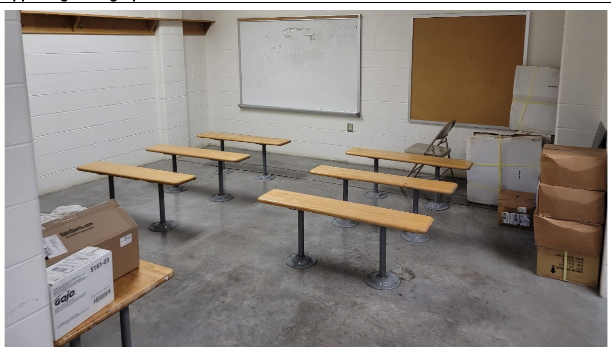
Locker room needs updates as well as additional storage.