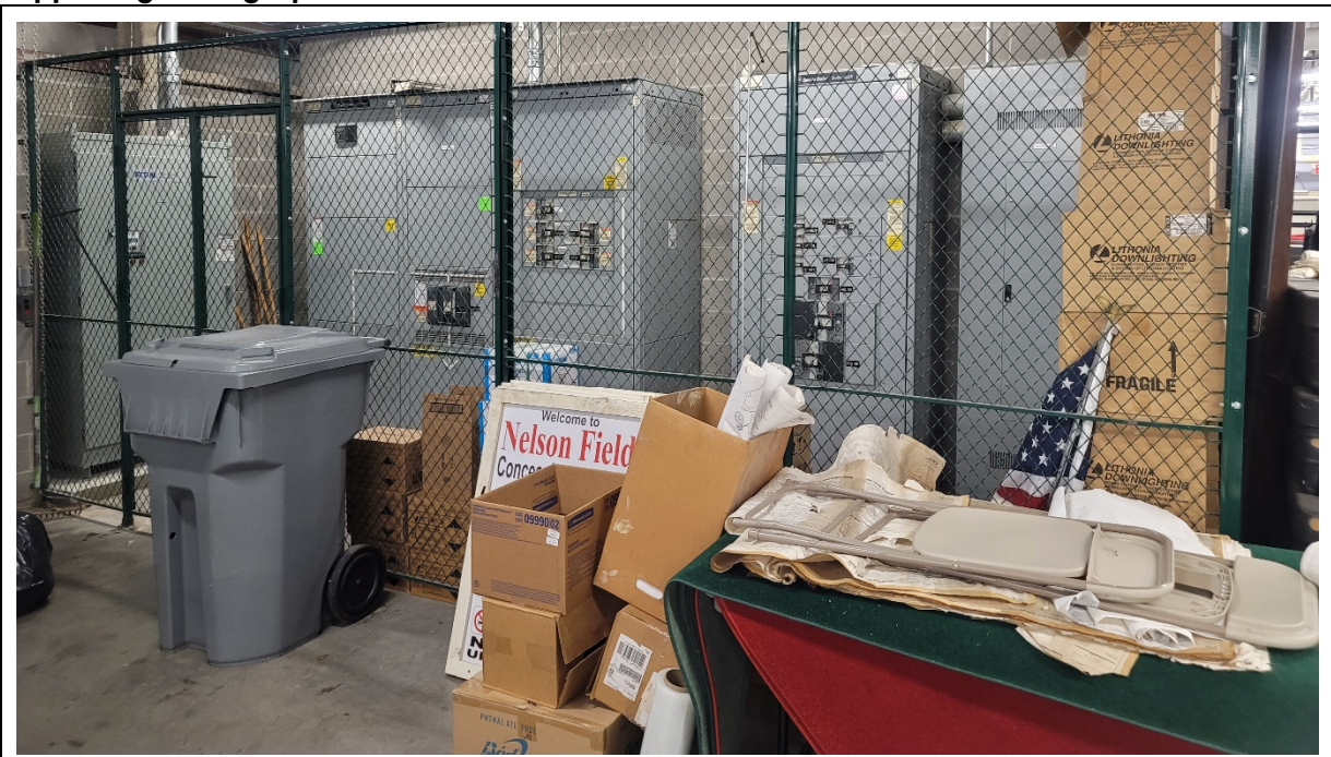
Storage area shares space with electrical panels and mechanical equipment. This makes it hard to do maintenance and stored items need to be moved.