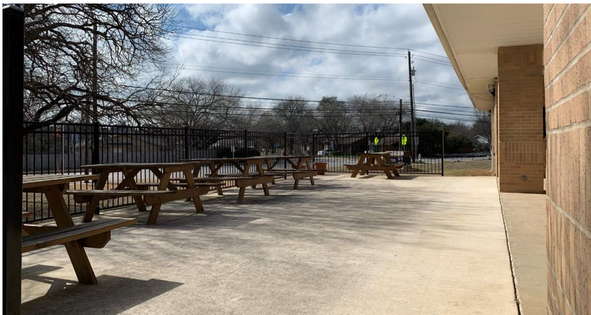
The visual arts studio has an outdoor learning space. It appears to be the only dedicated outdoor studio on campus that is easily accessible.