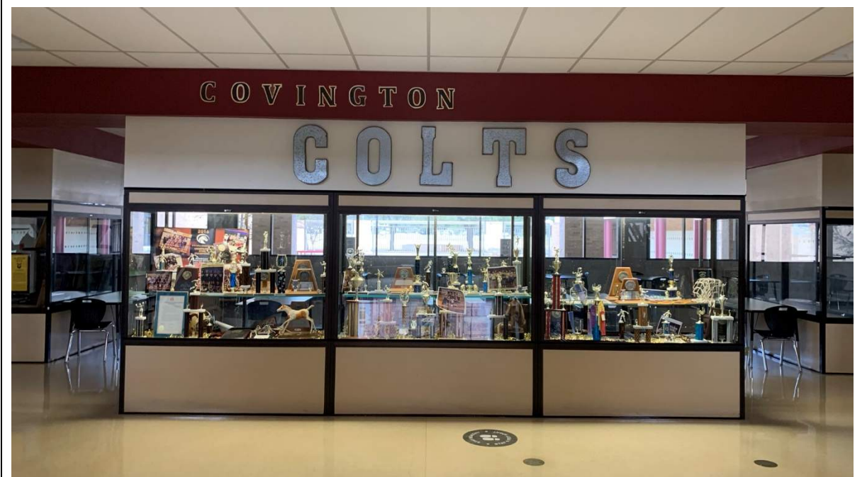
There are many areas for 3D display throughout the campus. There are fewer opportunities for 2D display, as most corridors are lined with lockers and only a tackstrip is provided above.