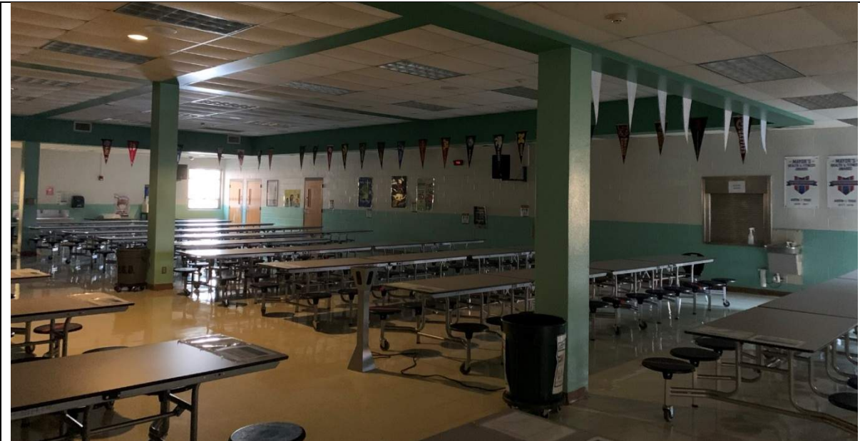
The cafeteria is very undersized per the Education Specifications and does not have adequate technology, nor can it be access securely for after-hours use.