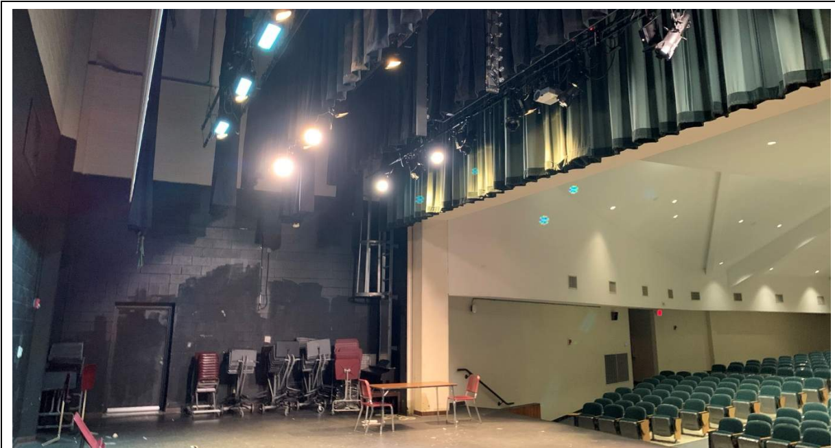
Auditorium and stage are in good condition and an adequate size. Stage wings are small and the only entry to the stage is through a band studio.