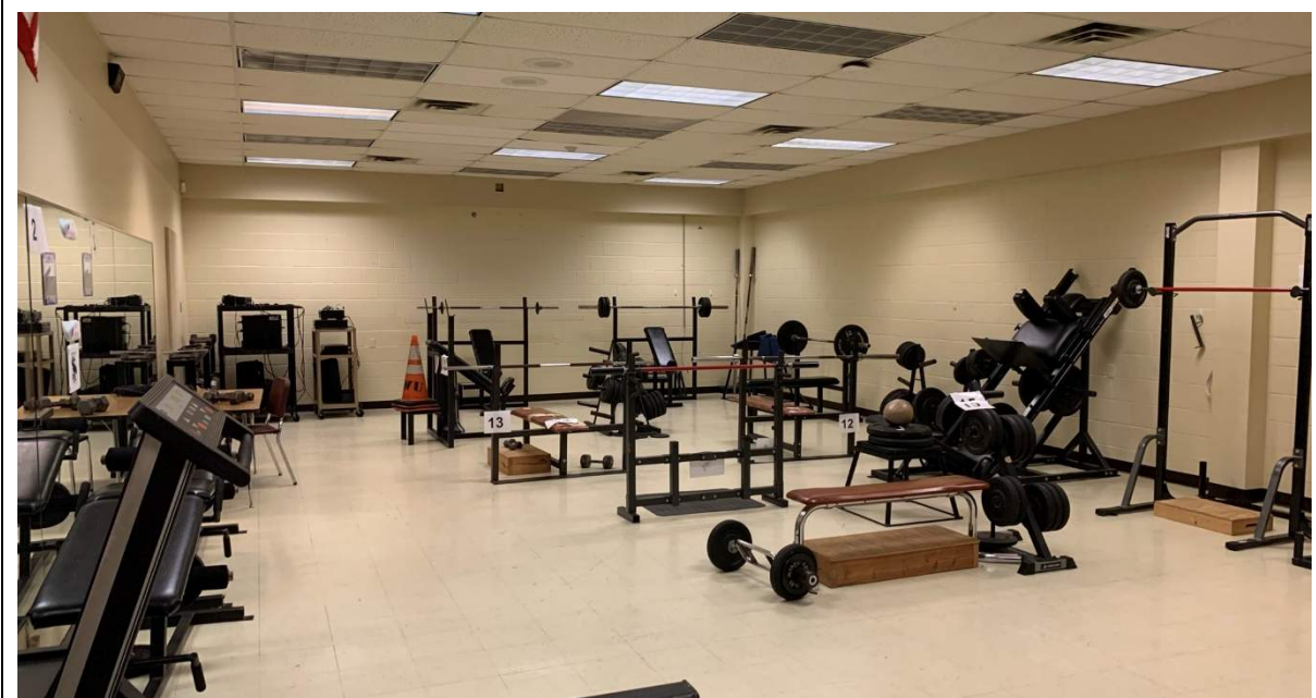
The weight room equipment is dated and damaged. The room is disconnected from the gym in, what appears to be, a former studio space. Per the school, this issue will be resolved once the scheduled Fine Arts renovations are completed.