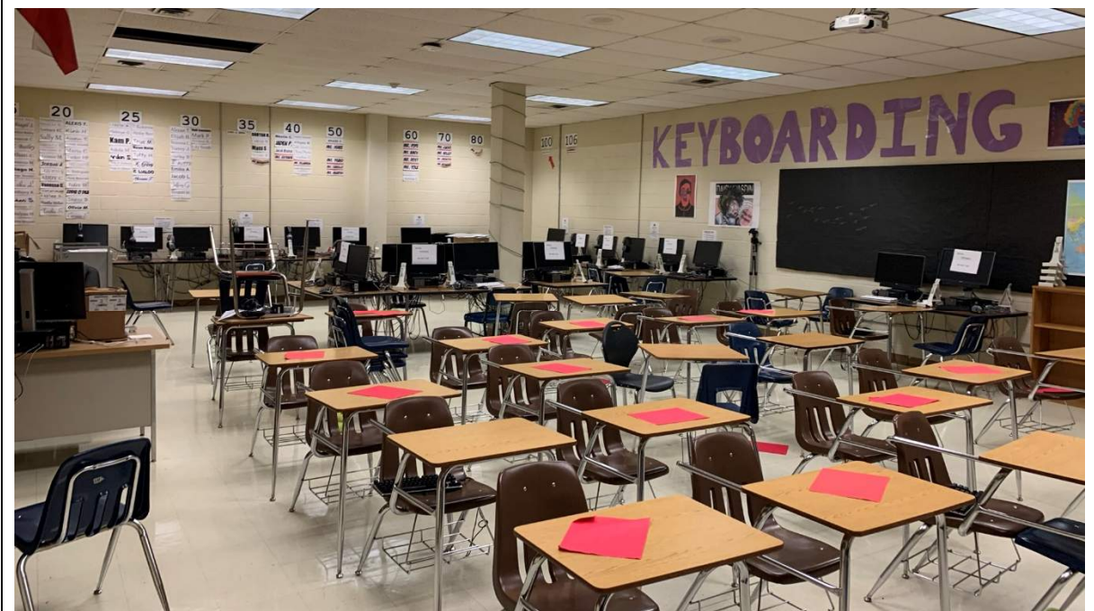
There are multiple computer lab studios throughout campus that support the CTE pathways offered at the school. The furniture is not adequate to support the functional needs of this space.