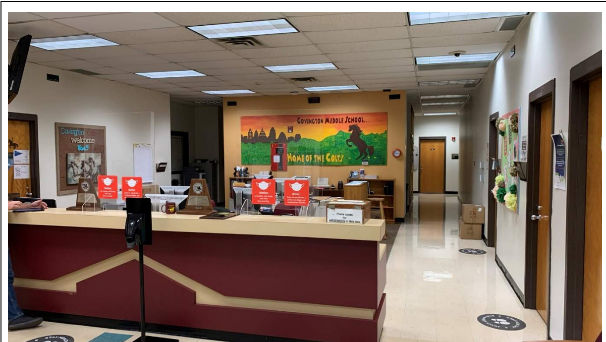
Reception is large, open, and welcoming. It is located near the main entrance but lacks good transparency into the entry lobby.