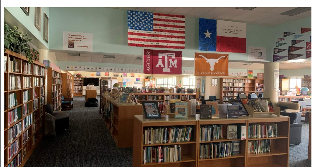
The library is undersized per the Education Specifications but has designated zones for different group sizes or teaching needs. Most of the furniture is dated and cumbersome to move.