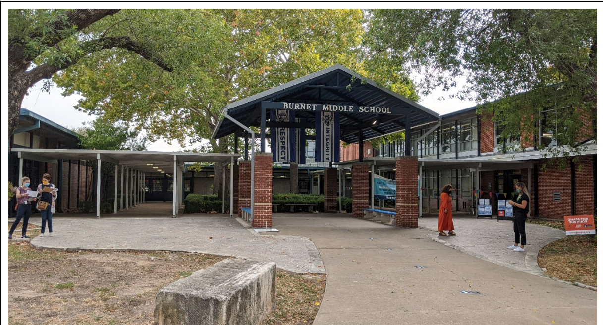
Covered Building Entry: Large mature trees around campus and general exterior entrance is in good condition.