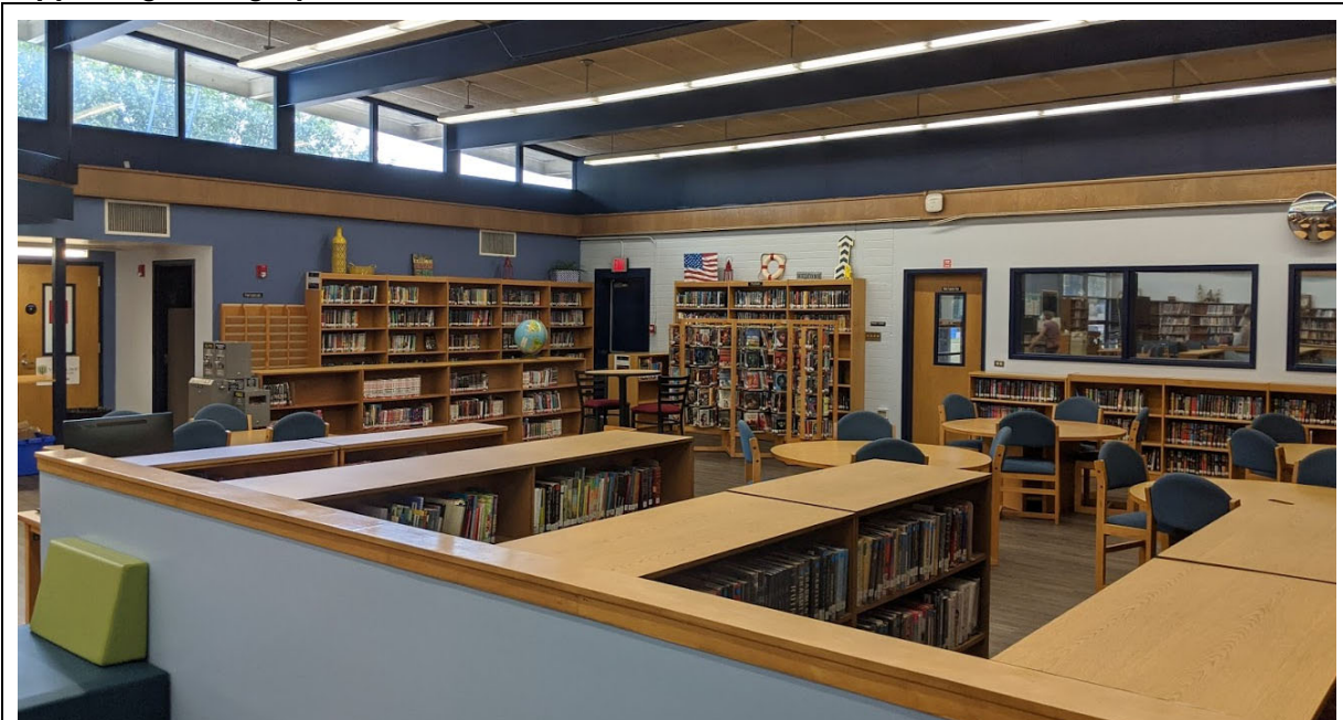
Media Center: Library in good condition, but most furniture is not reconfigurable or easily movable.