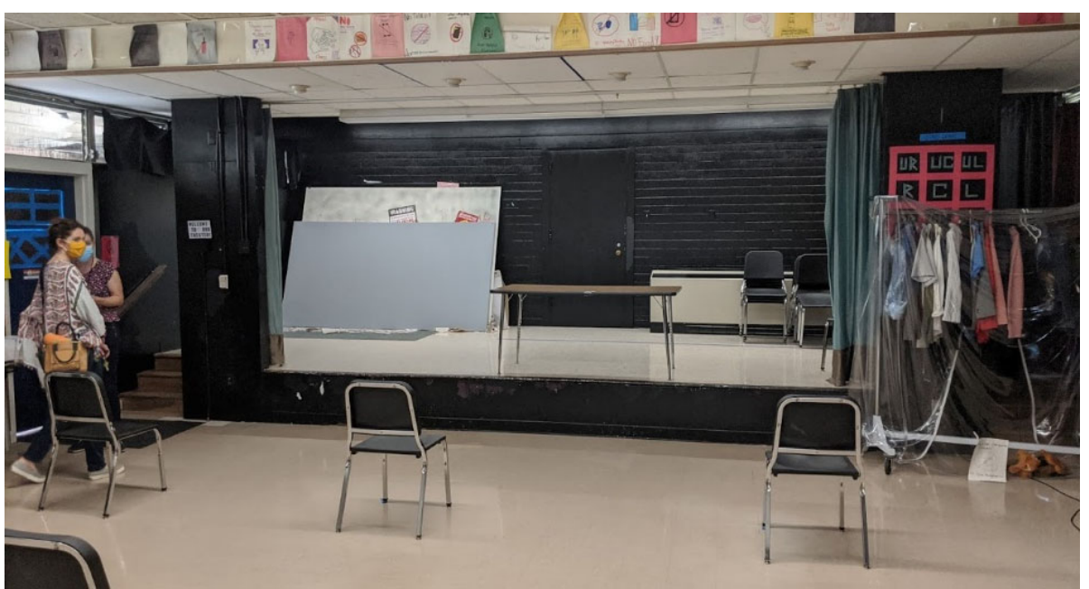
Fine arts: Theater studio is small with insufficient storage