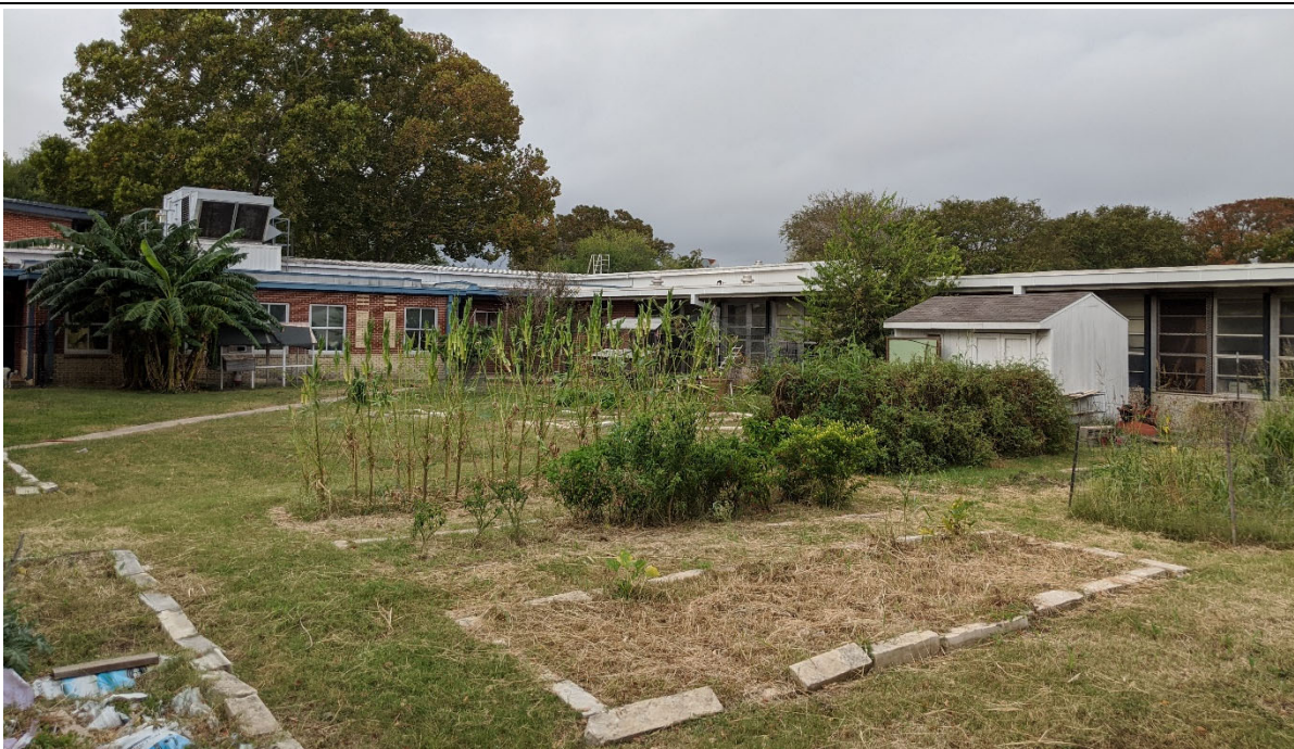
Outdoor garden: Spacious outdoor learning garden in good condition. Watering through hose, not irrigation.