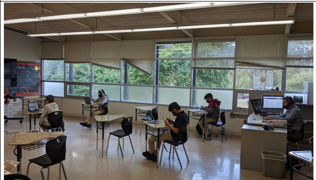
Studio Environment: Ample natural light in studios, but blinds are not in good condition and all studios are undersized.