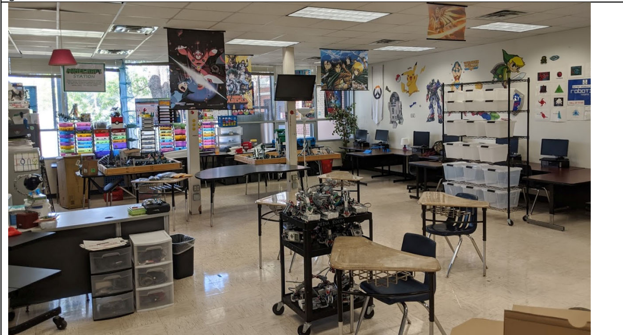
STEAM Center: Robotics lab in excellent condition