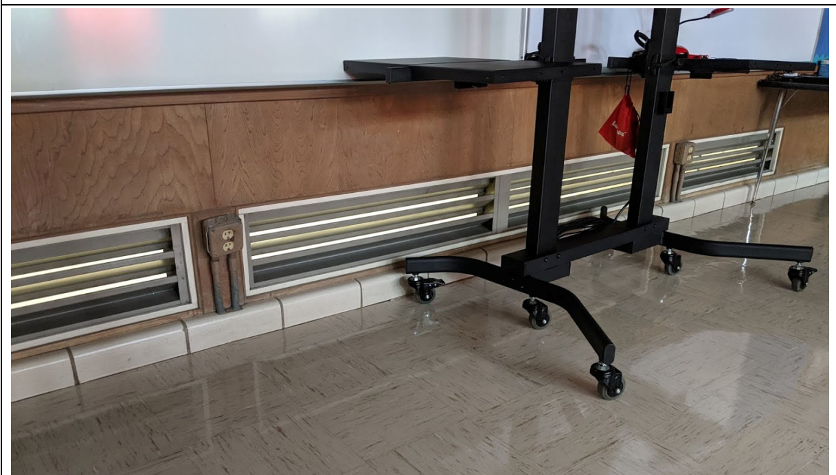
Studio Acoustics: Open return air grilles in all studios have negative impact on acoustics