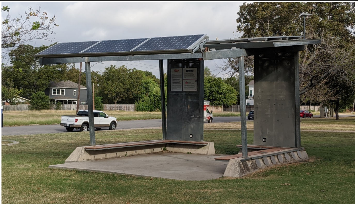
Outdoor Studio: partially covered but unsecured. School reported that this is used as an outdoor studio but is far from the school and needs updates to function well.