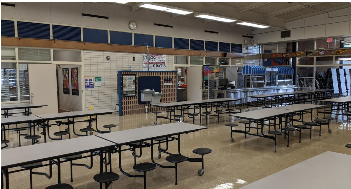
Cafetorium is undersized and lacks compost and recycling instructions