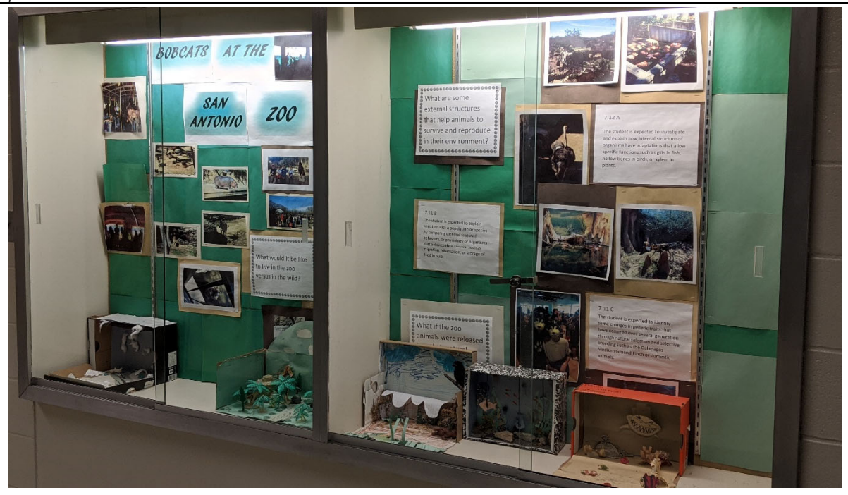
Evidence of Learning – Display artifacts of learning at each studio cluster