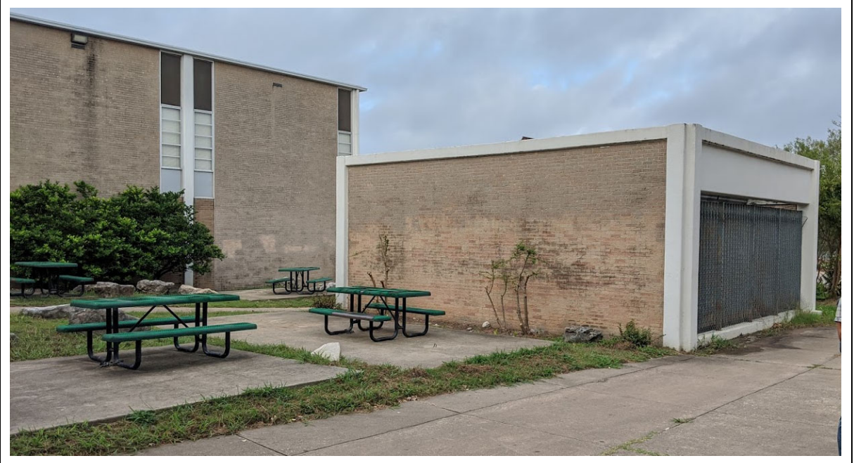
Outdoor Learning – Existing space disrupted by noisy mechanical equipment and no shade is provided.