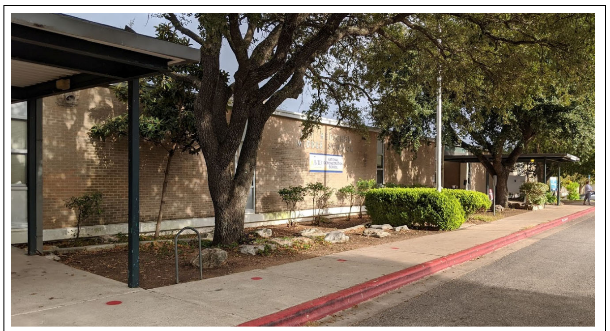
Building Entry – Main Building Signage