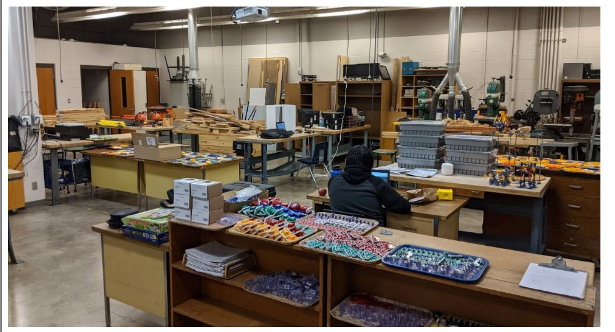
STEAM-learning space for woodshop and robotics