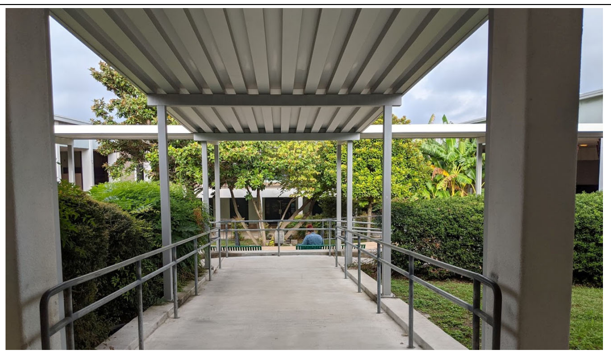
Interior Circulation - Accessible Ramps in Central Courtyard Space