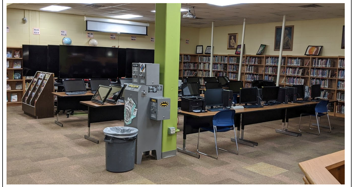
Technology - Library Media Center is well equipped.