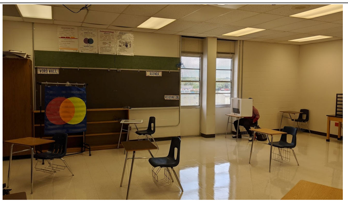
Environmental Quality – Small windows do not provide adequate natural light in studios and furniture is not flexible.