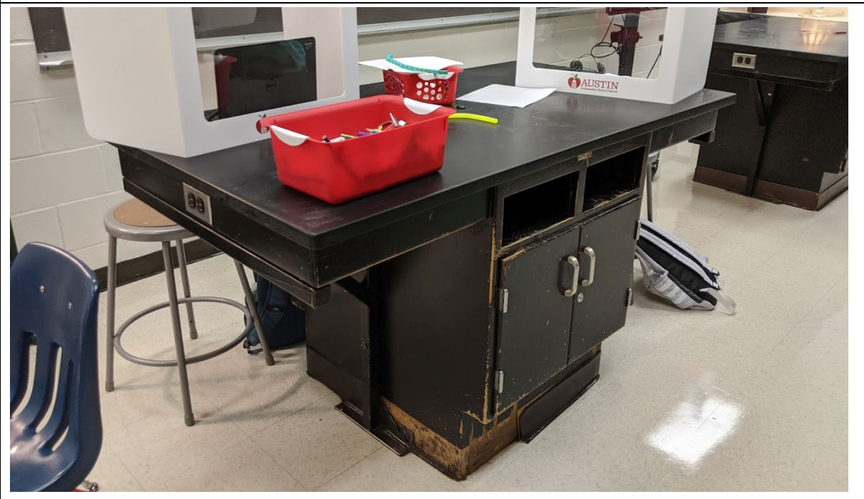
Furniture - Original Lab Tables in disrepair, these are heavy and immobile