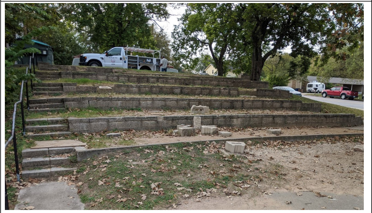
Outdoor Learning - Existing outdoor theater needs maintenance and is close to the street