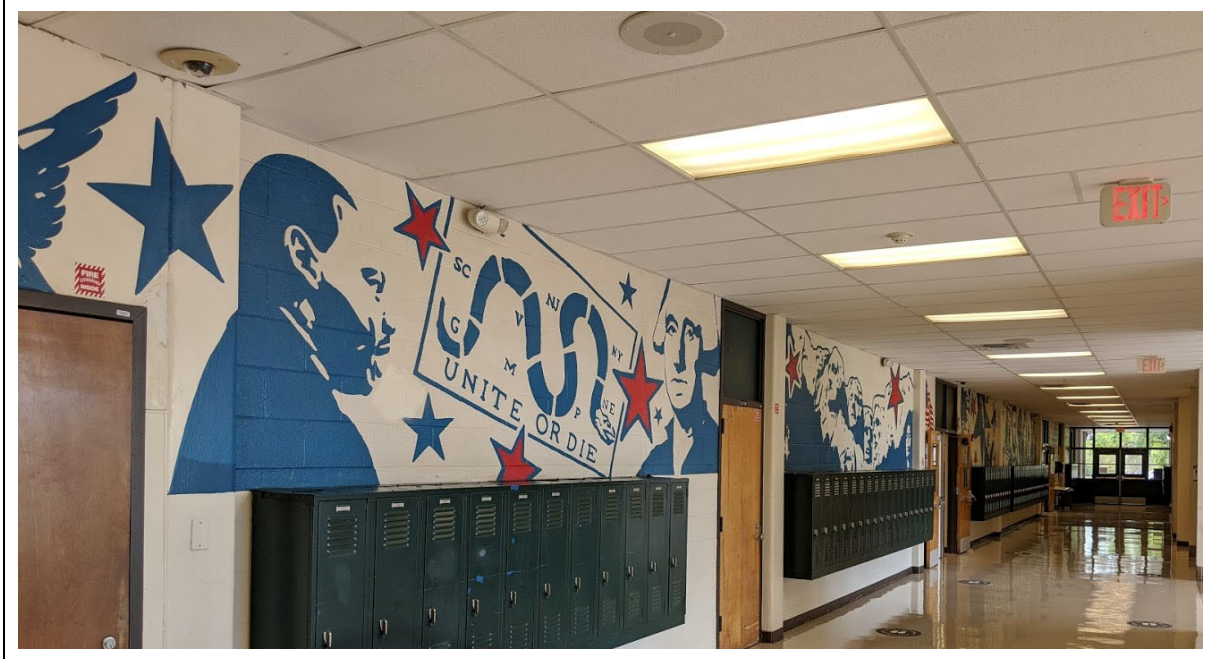
School Pride - Murals throughout the campus show pride in student community