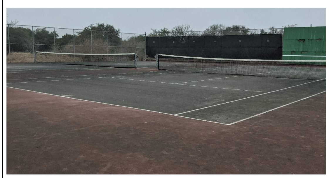
Tennis courts are in disrepair.