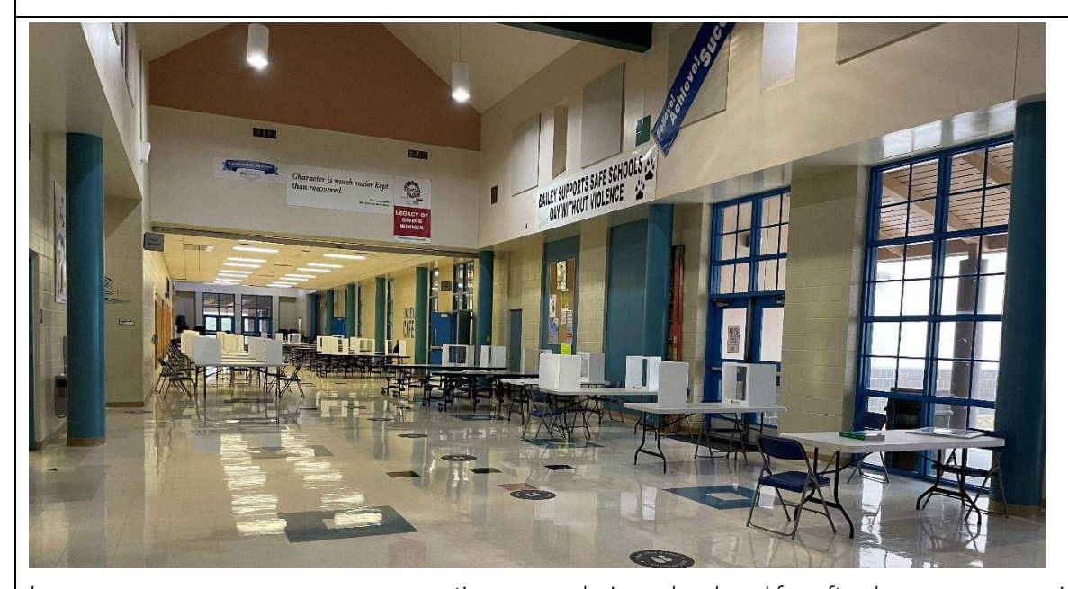
Large commons area serves as a reception space during school and for after-hours programming.