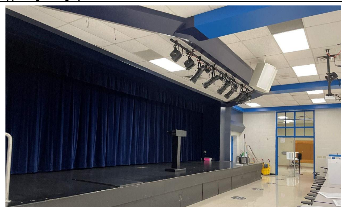
There is a large stage and generous cafeteria seating.