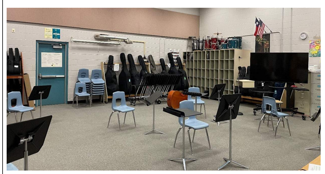
Orchestra and band spaces are undersized.