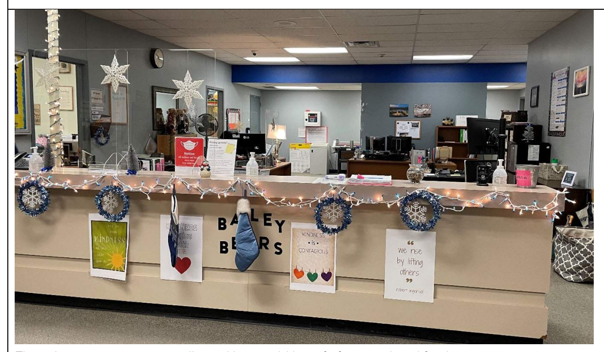
The administrative suite is well-sized but could benefit from updated finishes.