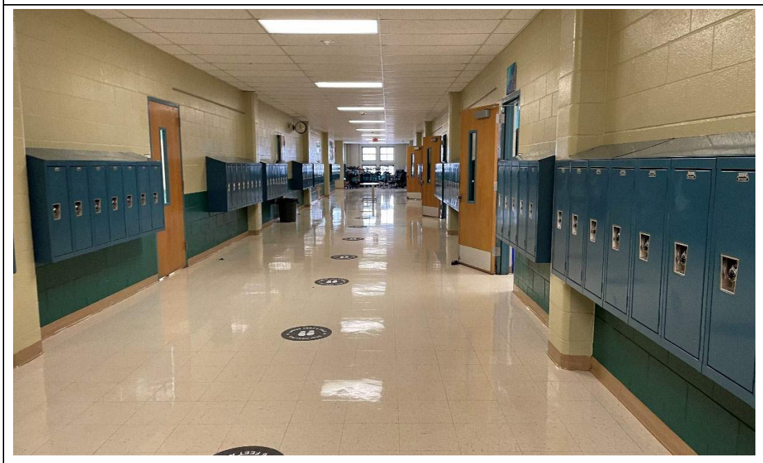
Generous corridors could be reconfigured for flexible, independent learning.