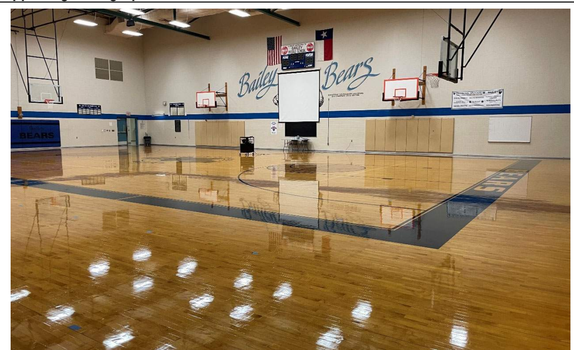
The gym is large and functions well but needs updates to finishes.