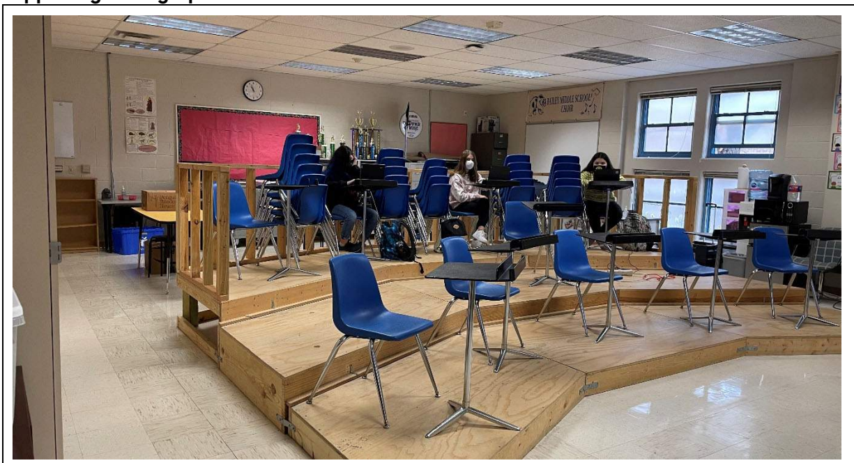
Choir facilities are makeshift and not suitable for the program.