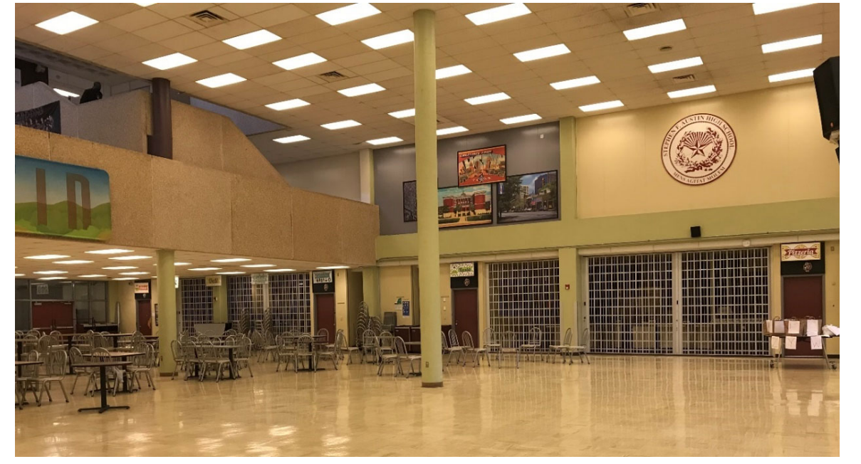
Cafeteria is undersized for campus capacity and cannot hold events such as banquets for student groups. Fluorescent lighting throughout the school is dated and not controllable.