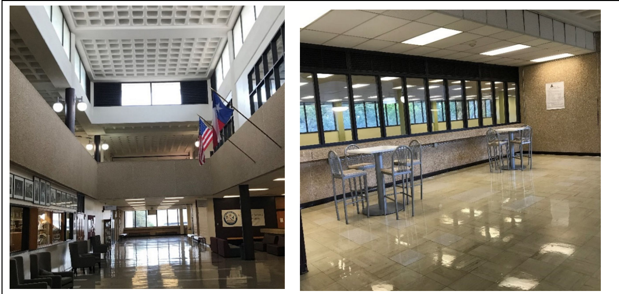
Open, daylit central circulation with ample breakout spaces suitable for student learning. Furniture placement is sparse and there are not enough charging locations.