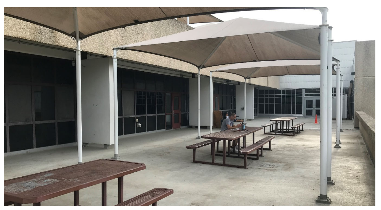
Two tiers of rooftop patios provide shaded outdoor learning opportunities. Additional infrastructure, such as charging stations, is needed. These patios function as outdoor maker spaces and storage container is seen in the background for supplies.