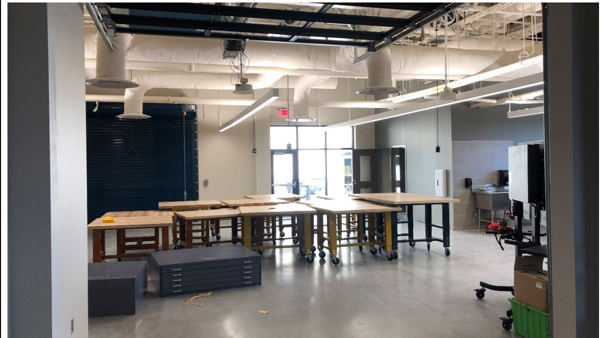
Art studios are flexible spaces with movable worktables and overhead doors between the two art rooms as well as one to the outdoors. They are next to engineering studios and a maker space.