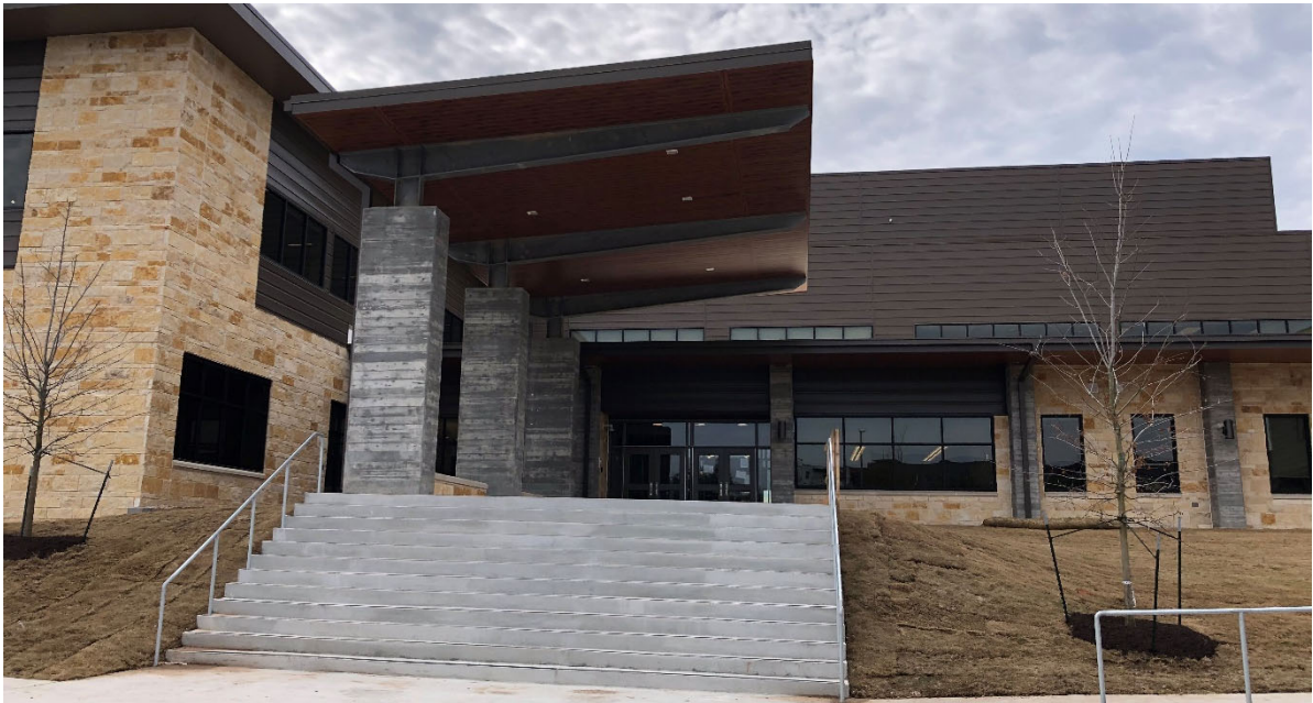
Main school entry off Panther Trail has a large canopy to provide protection from weather .