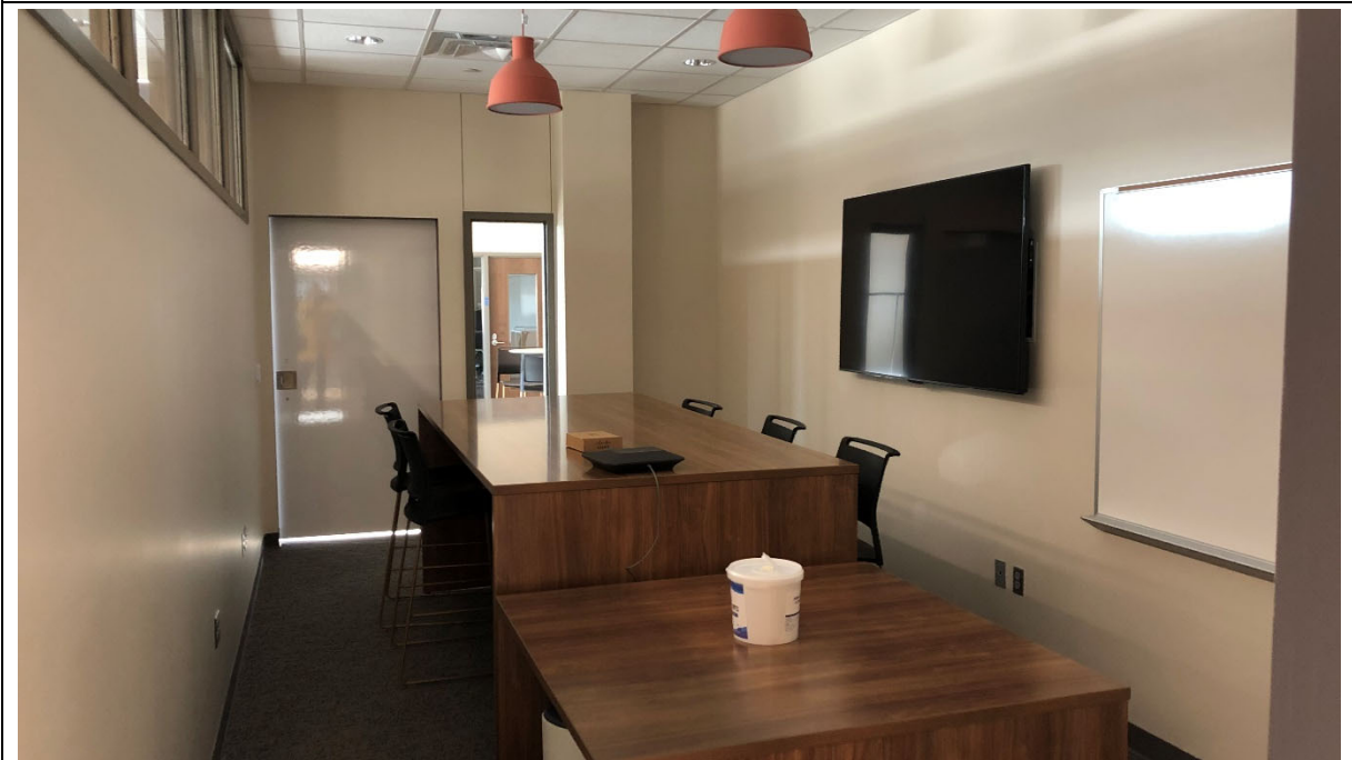
Small group rooms with technology and whiteboards are in each of the learning neighborhoods.