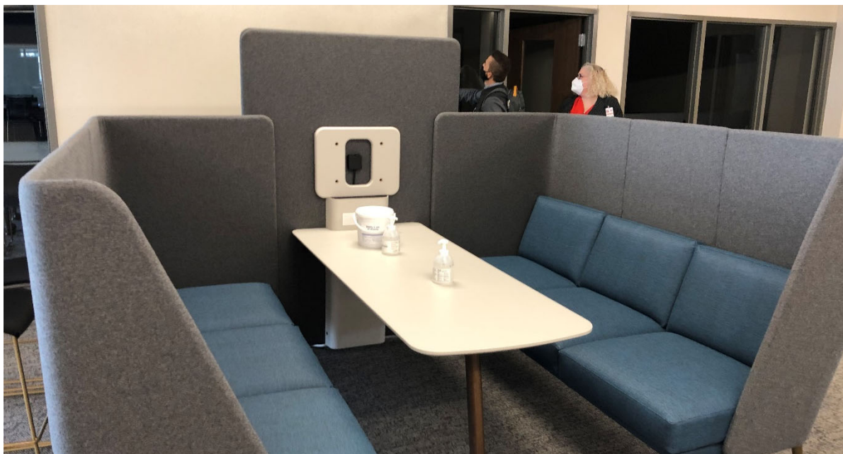
Furniture provides variety for individualized study and group work and supports charging/technology needs.