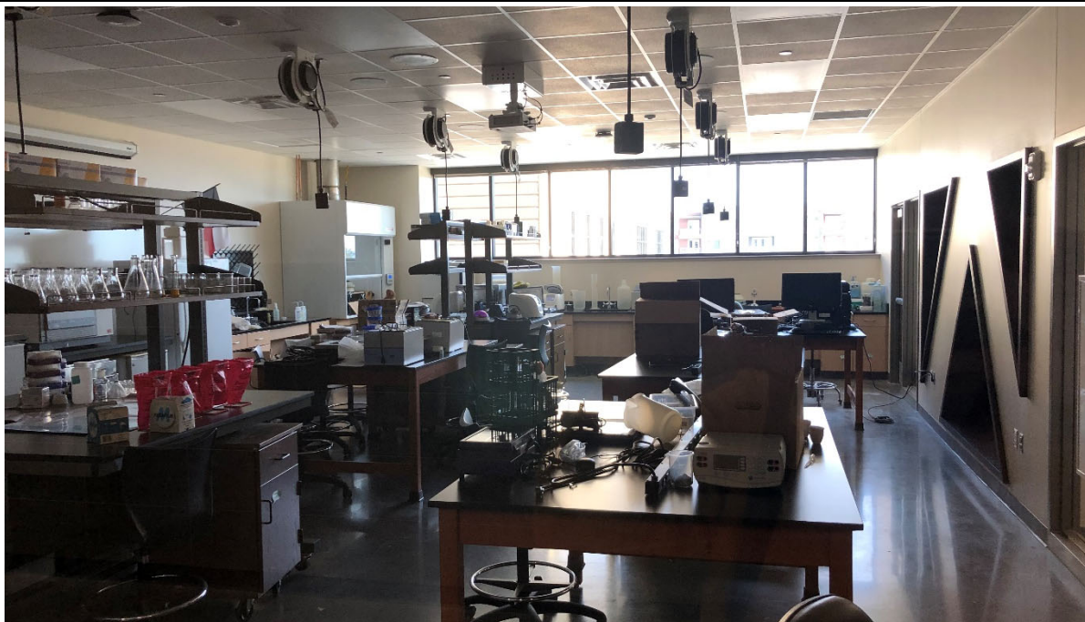
Science lab with overhead power and prep room between two lab spaces.