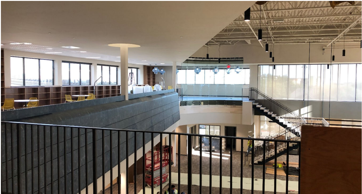
Media Center: Two-story space with a variety of seating types, a collaboration stair, and a second-floor porch for additional outdoor space.