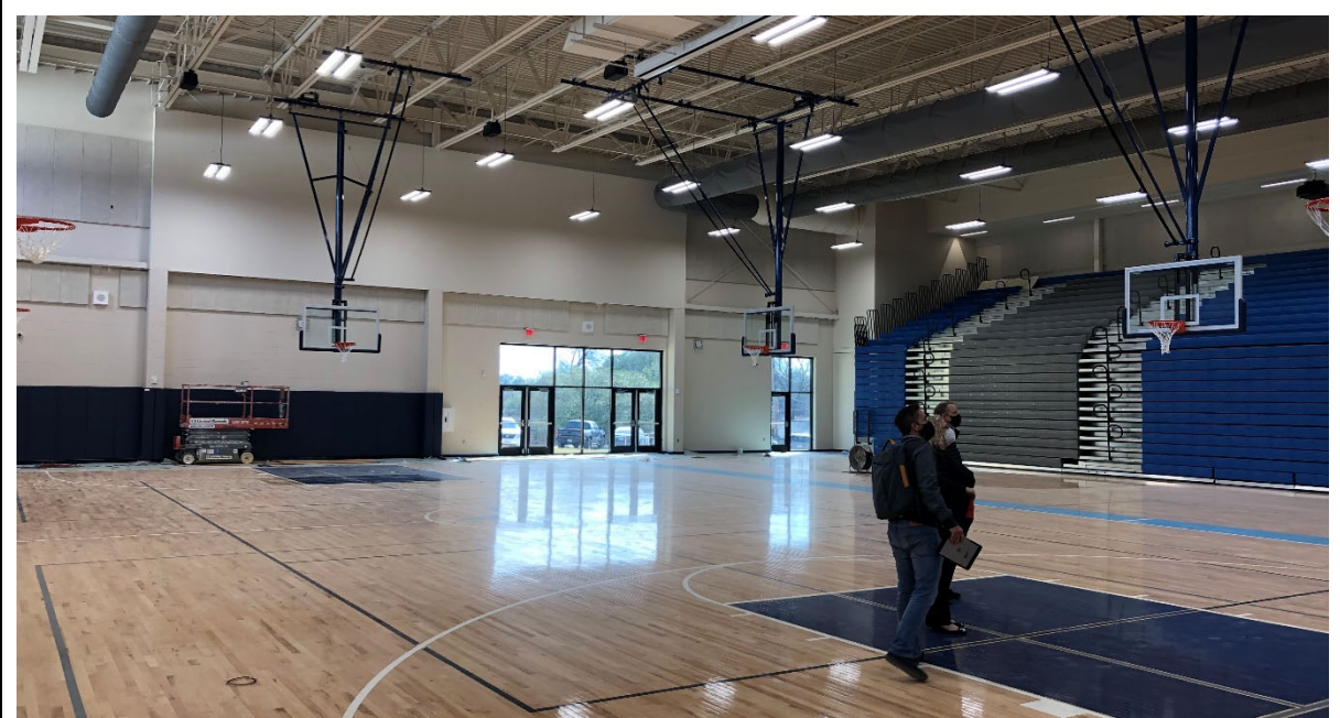
Main gym is adequately sized with bleachers along one side of the gym. The projection screen and projector are sized adequately for the large space.