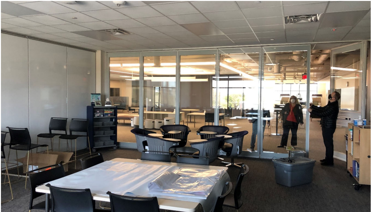
Typical studio has a variety of furniture. Some studios have movable partitions to open to collaboration space and adjacent studio.