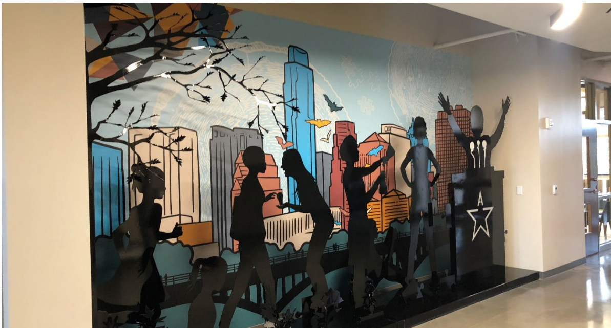
The building has unique murals/graphics. This one is at the entry of the school. In general, there are limited places for 2D and 3D display throughout the school.