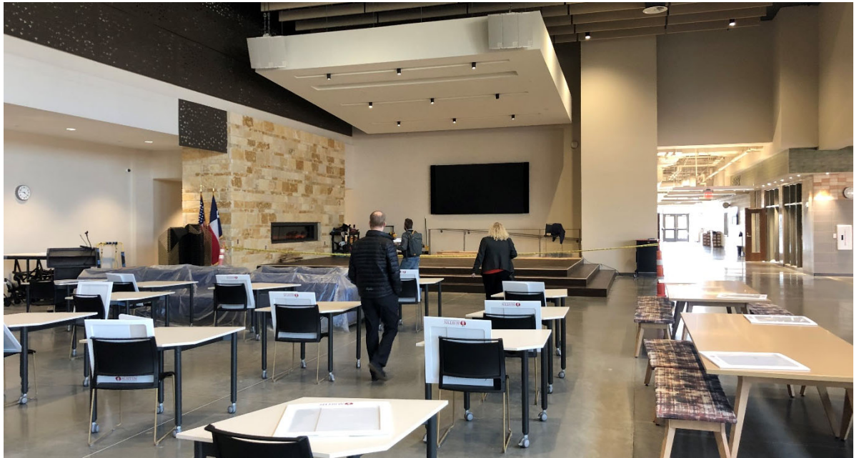
Cafeteria has a stage but is not set-up for formal productions. There is a variety of seating within the space.