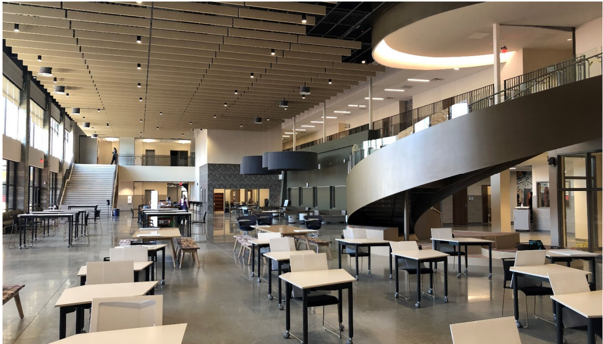
Two-story multipurpose space serves as a cafeteria and a large meeting space that opens to outdoor courtyard/seating.