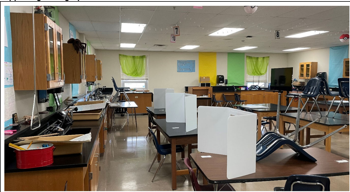
Academics and Learning: Science room are in adequate shape with flexible seating arrangements and sink areas along the edge.