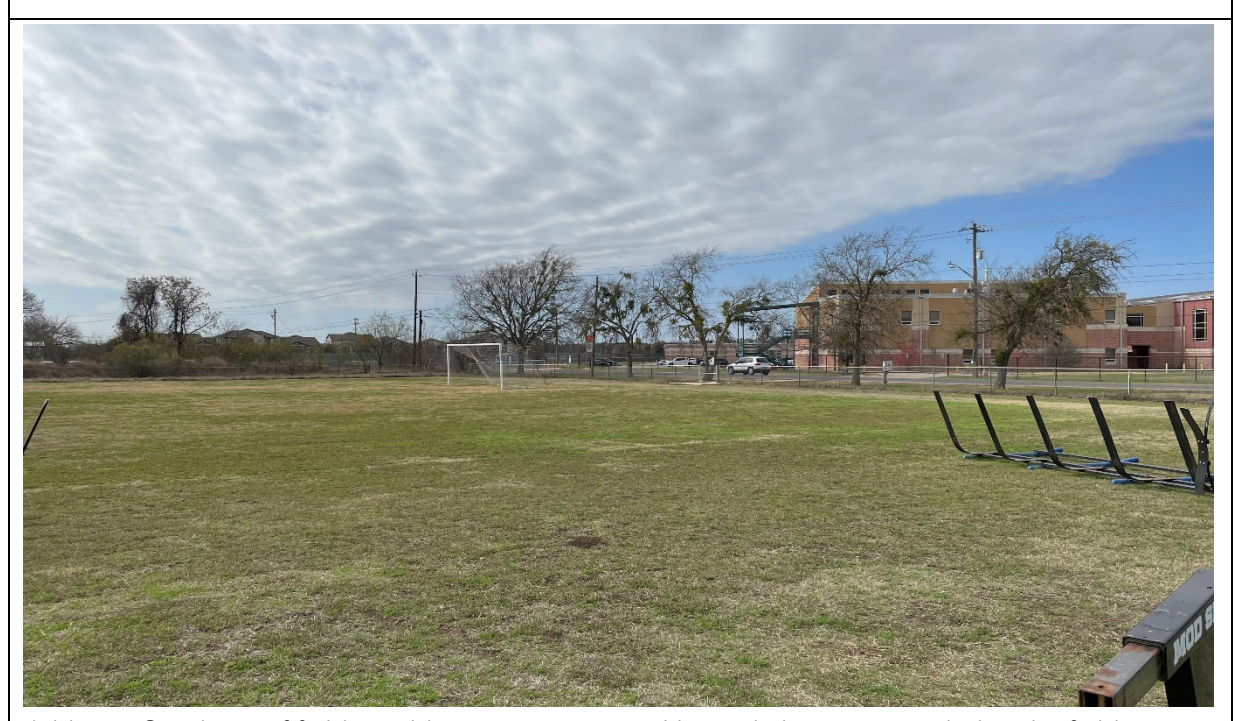
Athletics: Condition of fields could use improvement. No site lighting is provided at the fields.