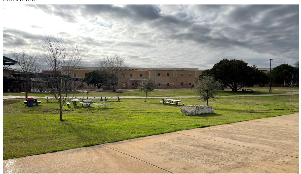
Outdoor Learning and Activity: Center courtyard space needs upgrades to landscaping and furniture to function as outdoor studios or collaboration space.