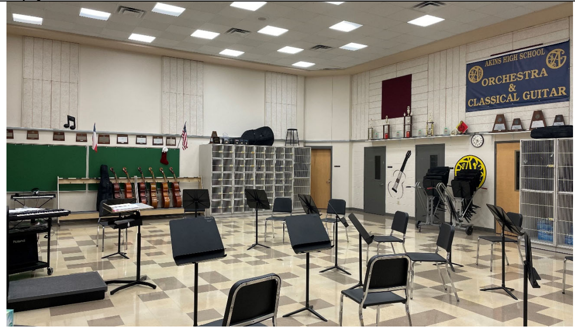
Fine Arts: Orchestra room is under-sized. Band, orchestra, choir all have limited practice rooms and current practice rooms are being used as storage.

Main corridors and circulations in main studio building. Corridors are wide and have natural daylight.