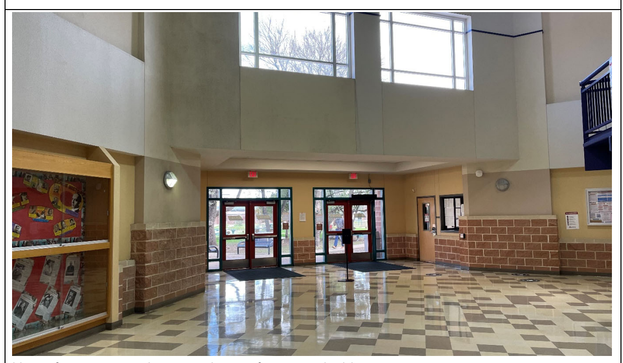
View of exits to central courtyard space from main building.