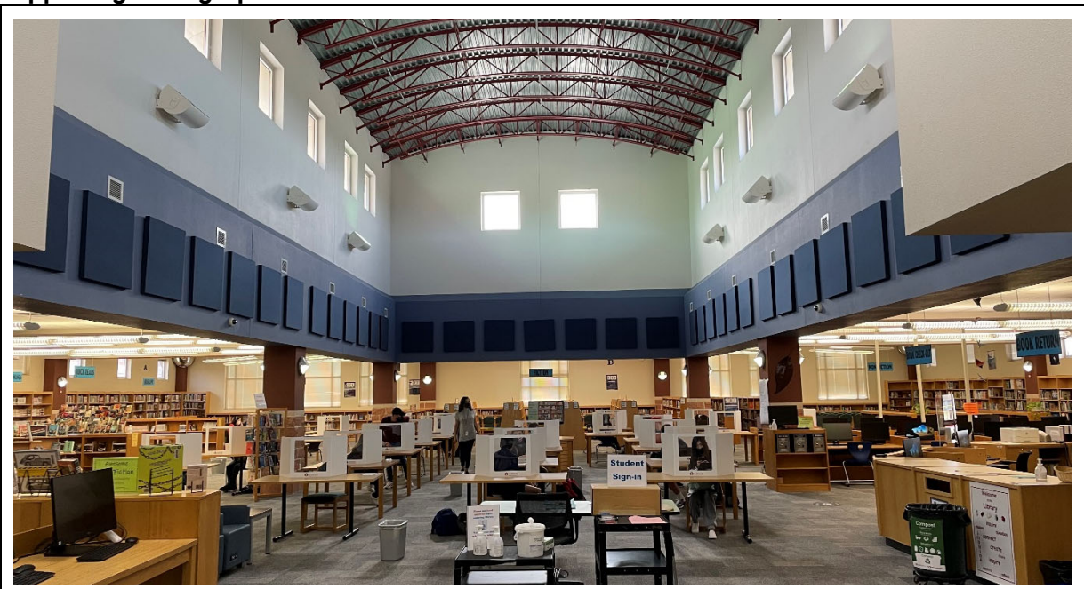
Media Resources: Open-concept library with computer stations.