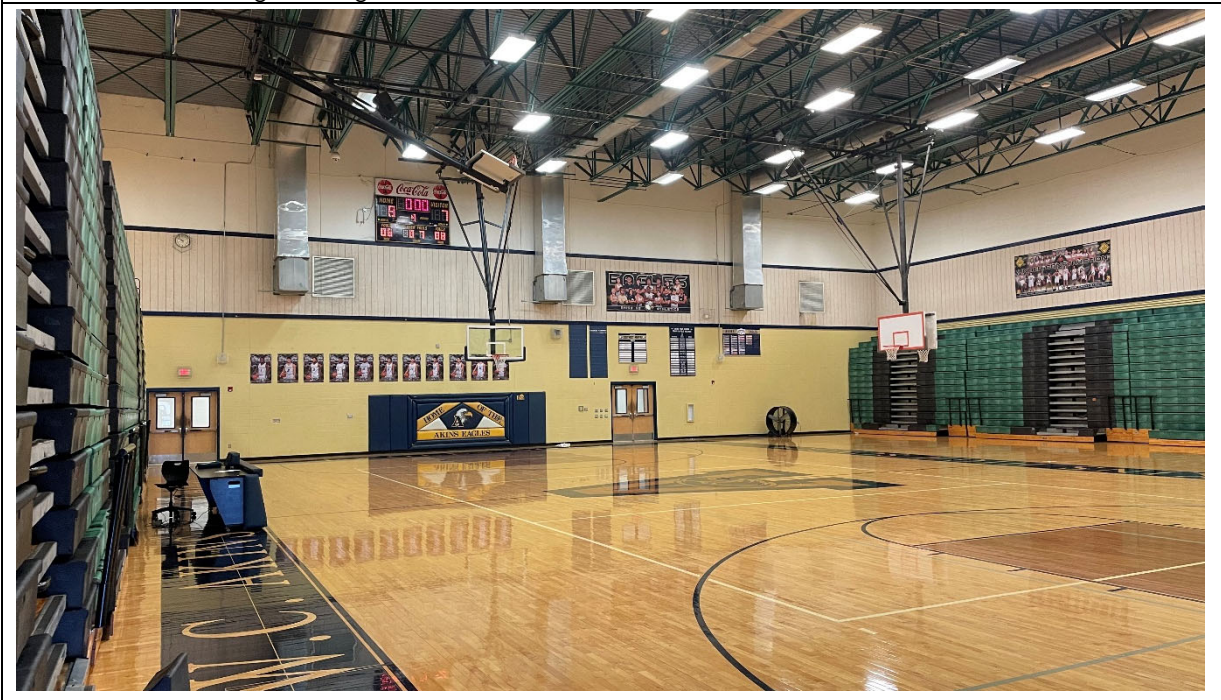
Athletics and Wellness: Large gymnasium space for basketball and volleyball is adequately sized.