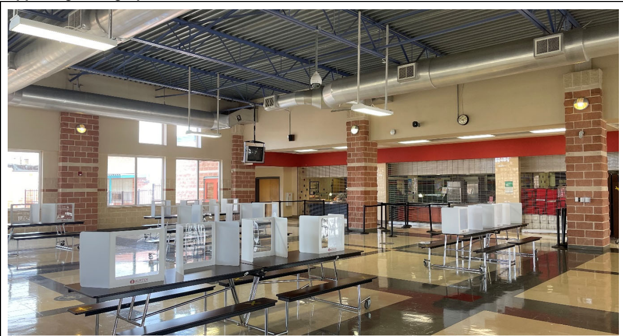
Food Service: Cafeteria located in a separate building. It is undersized for the current student enrollment.