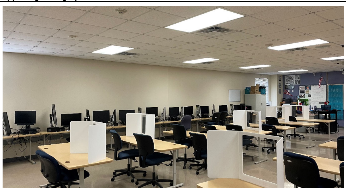
Computer lab studio in tech building is adequately sized, but there is no power for center tables.