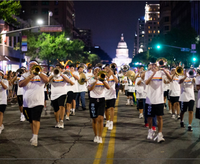
AISD Pride Parade Band Performance