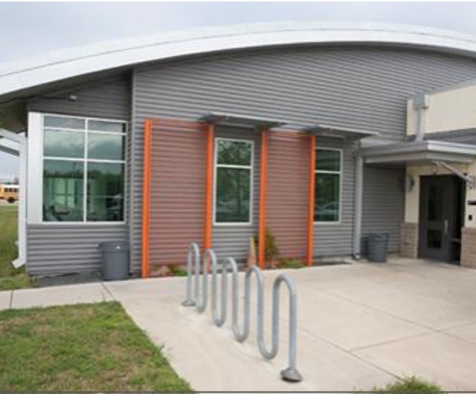
Austin ISD Facility Maintenance