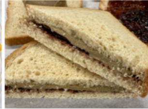
Sunbutter & jelly sandwiches offered daily (vegan option)