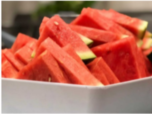
A variety of fresh fruit, often Texas-grown