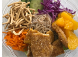
Salads offered daily, themes rotate weekly