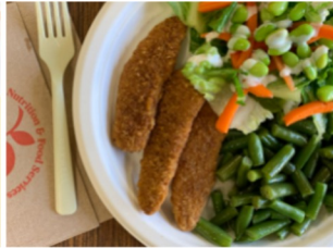
Healthy version of student favorites like chicken tenders & pizza