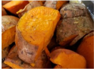
Tasty vegetables, example sweet potatoes from Fredericksburg Peach Co.