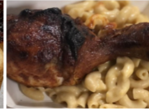
Scratch prepared favorites, example NAE chicken drumsticks