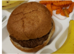
Hamburgers, veggie burgers, hot dogs served on New World Bakery Buns