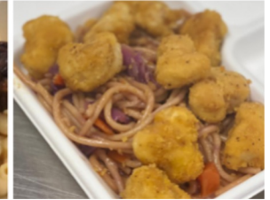
Global dishes, example Chicken Lo Mein