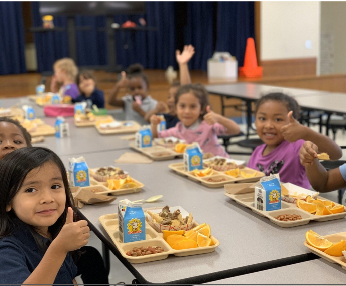
Austin ISD Food Service