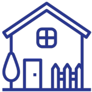
Understanding Concept of Choice

Enroll Austin will simplify researching and evaluating school options through a school finder. Families can view and learn about all school options as a whole, based on address or other eligibility factors