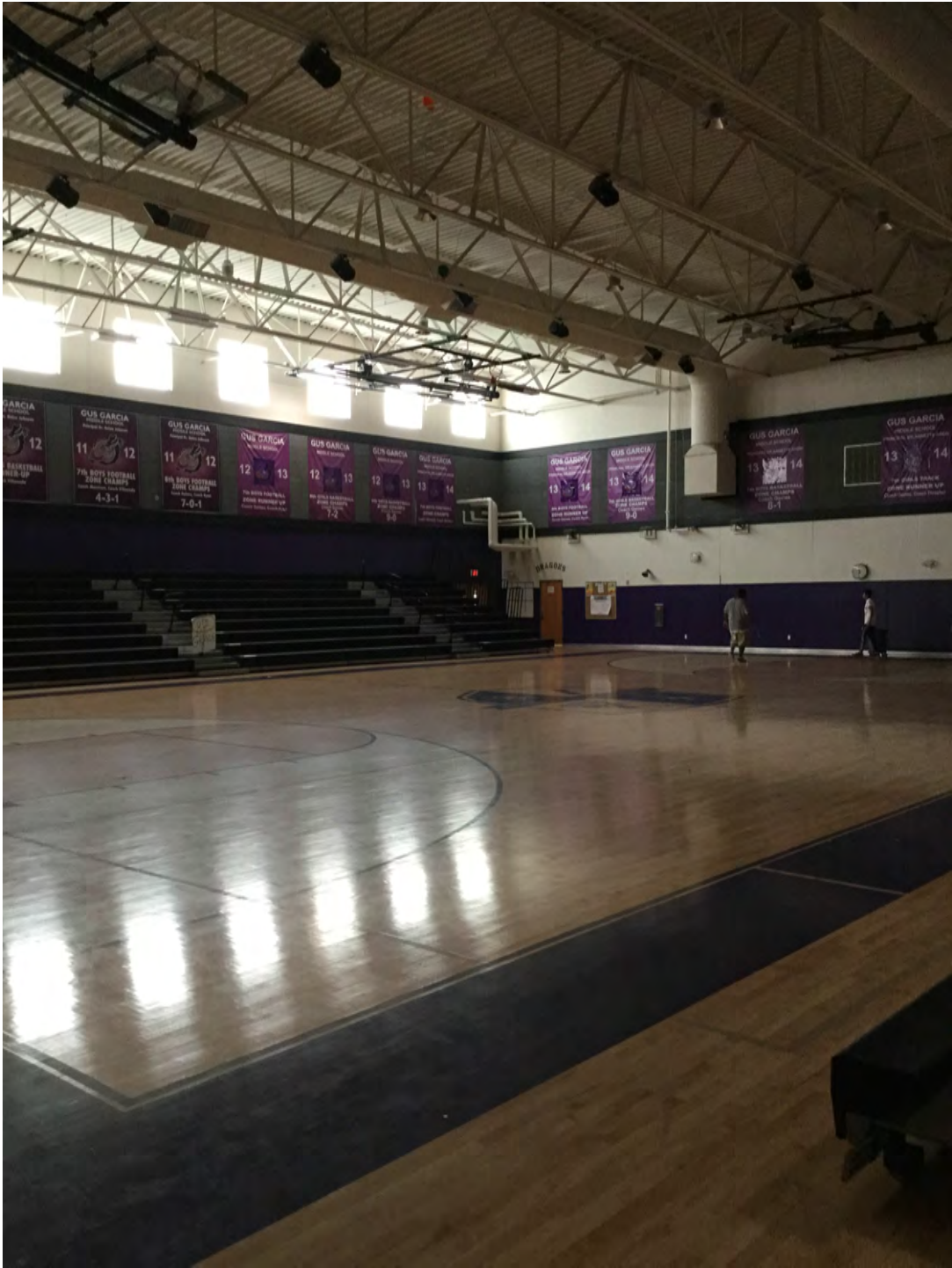
Photo 3. Gym Facility