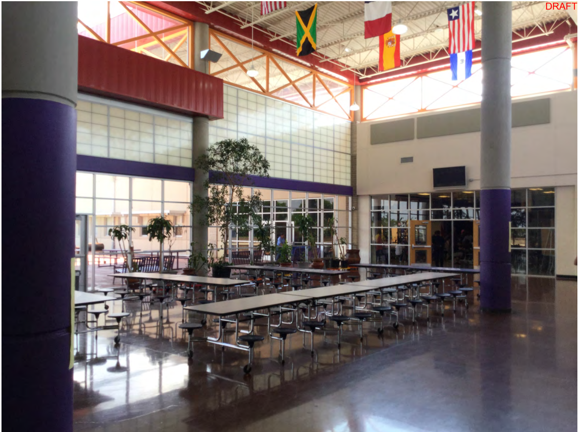
Photo 6. Informal Interactive Space