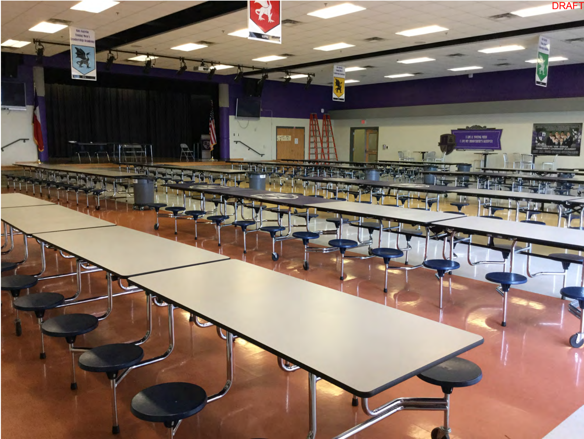
Photo 4. Dining Facility