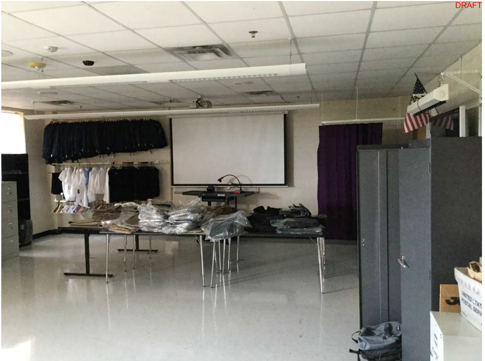
Photo 9. Storage