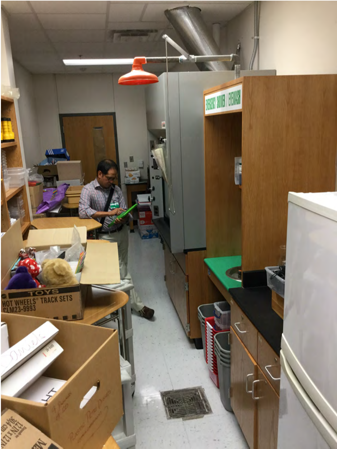
Photo 2. Science Support