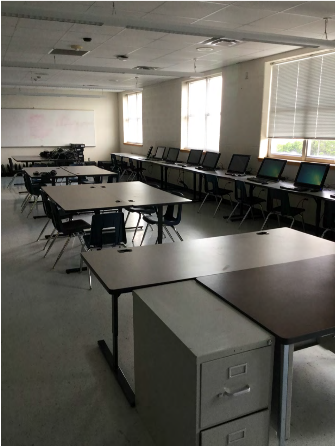
Photo 8. Technology