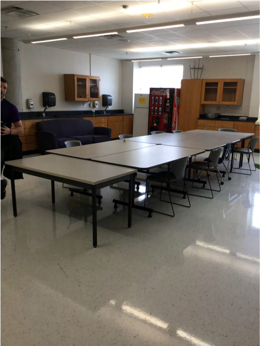
Photo 5. Collaborative Spaces