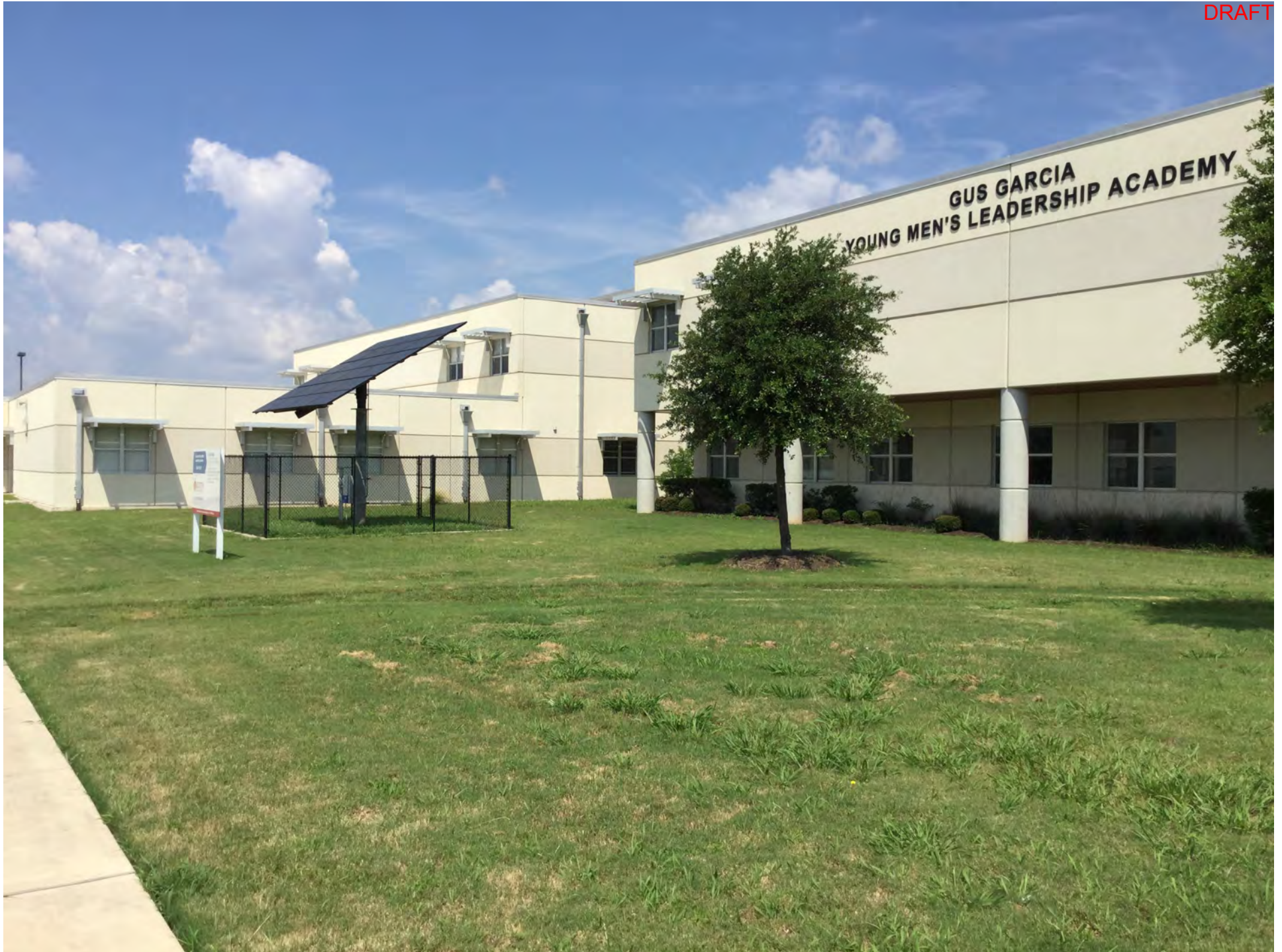
Photo 1. Appearance