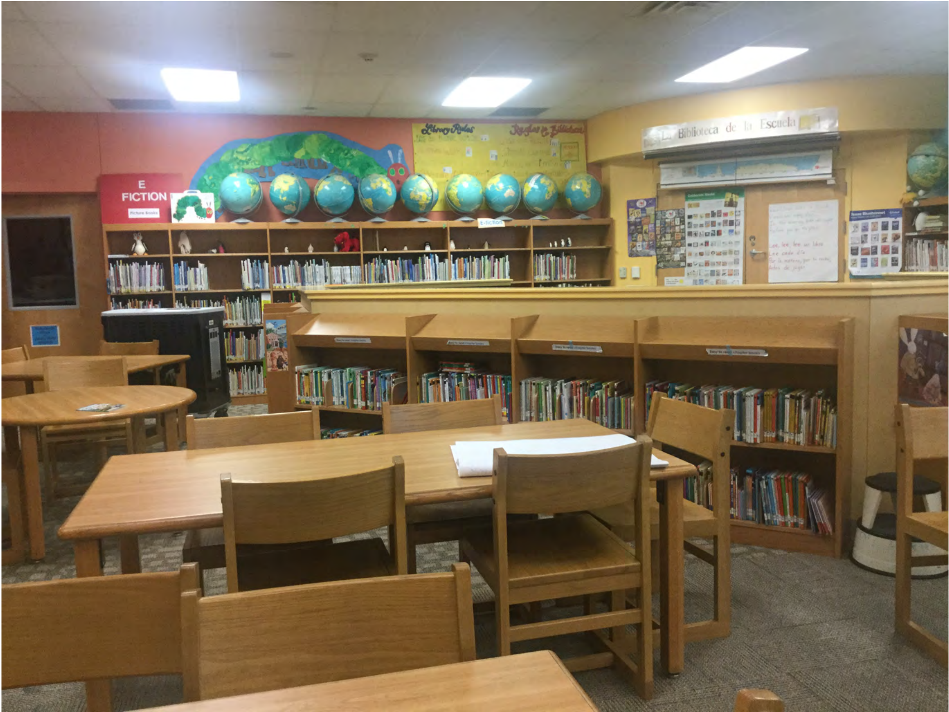
Photo 9. Library