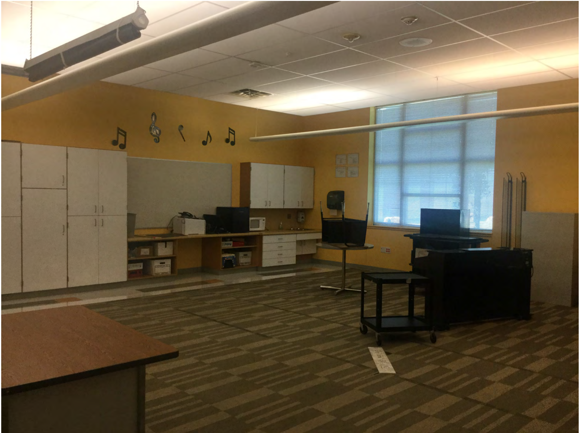
Photo 5. Music