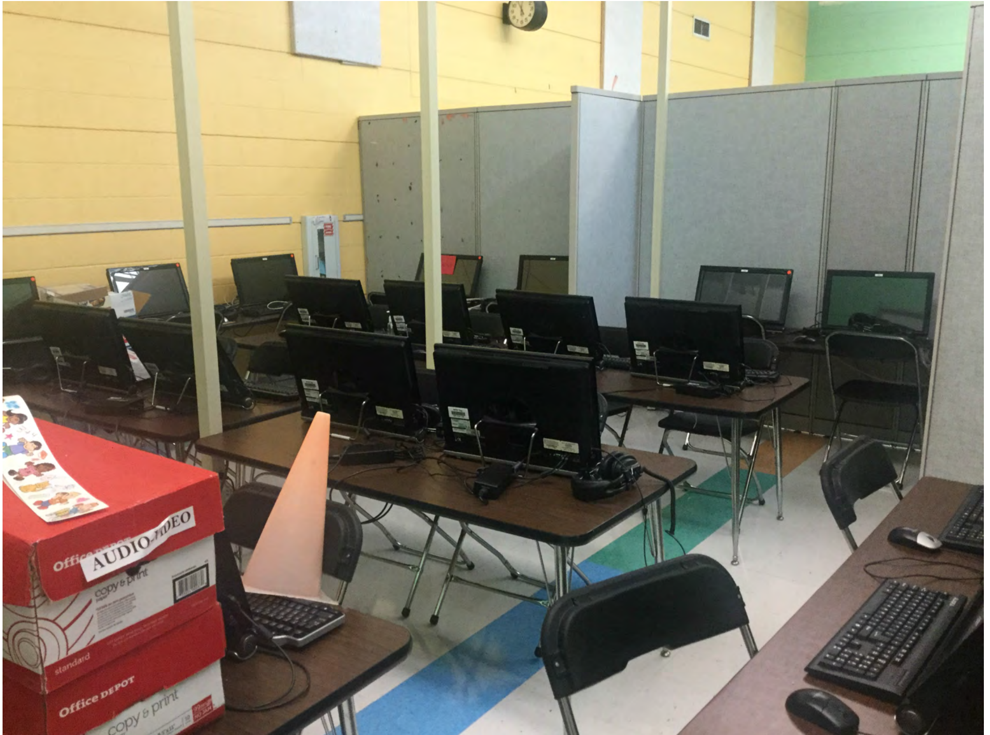
Photo 6. Computer Lab