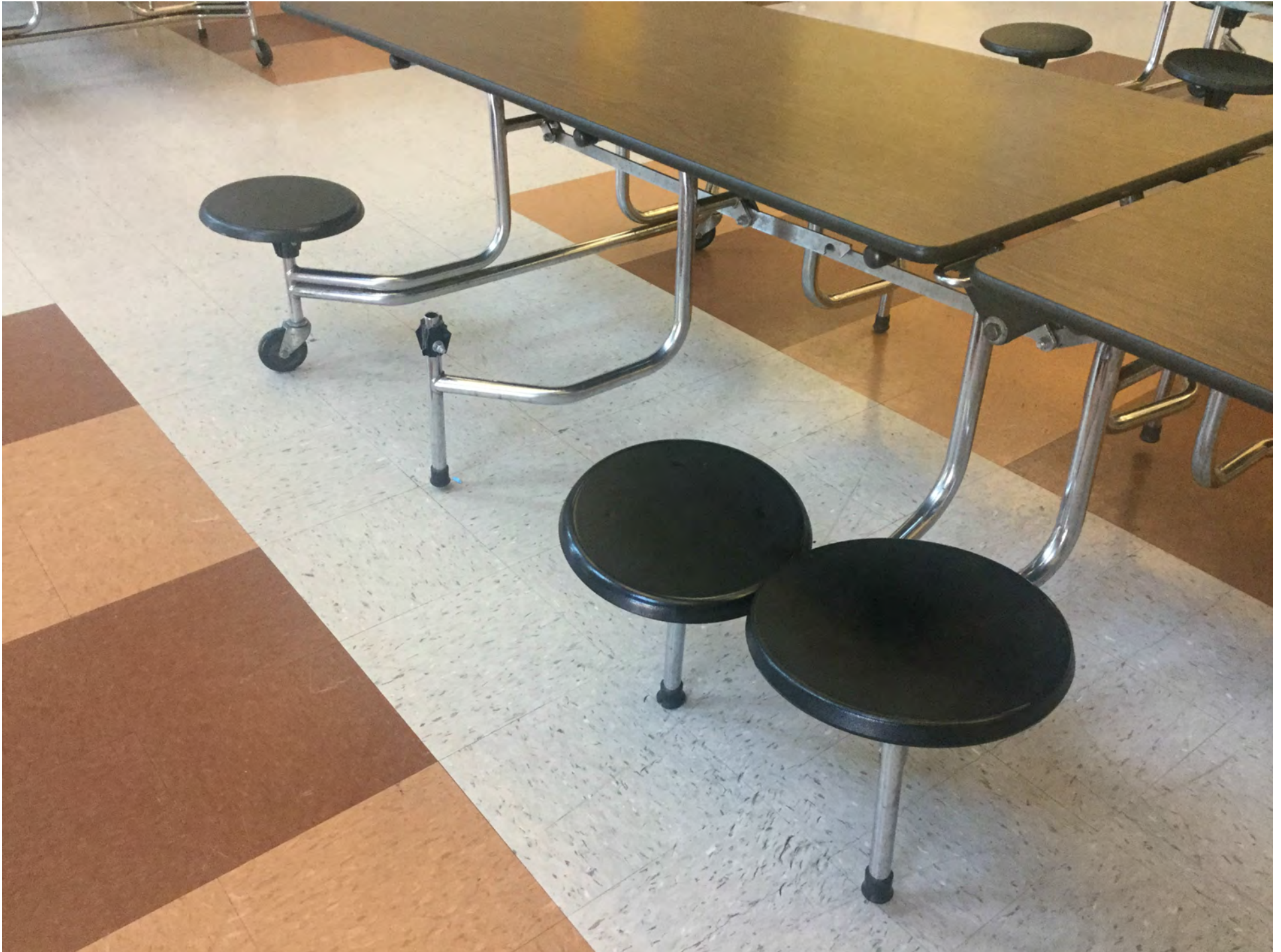
Photo 10. Furniture