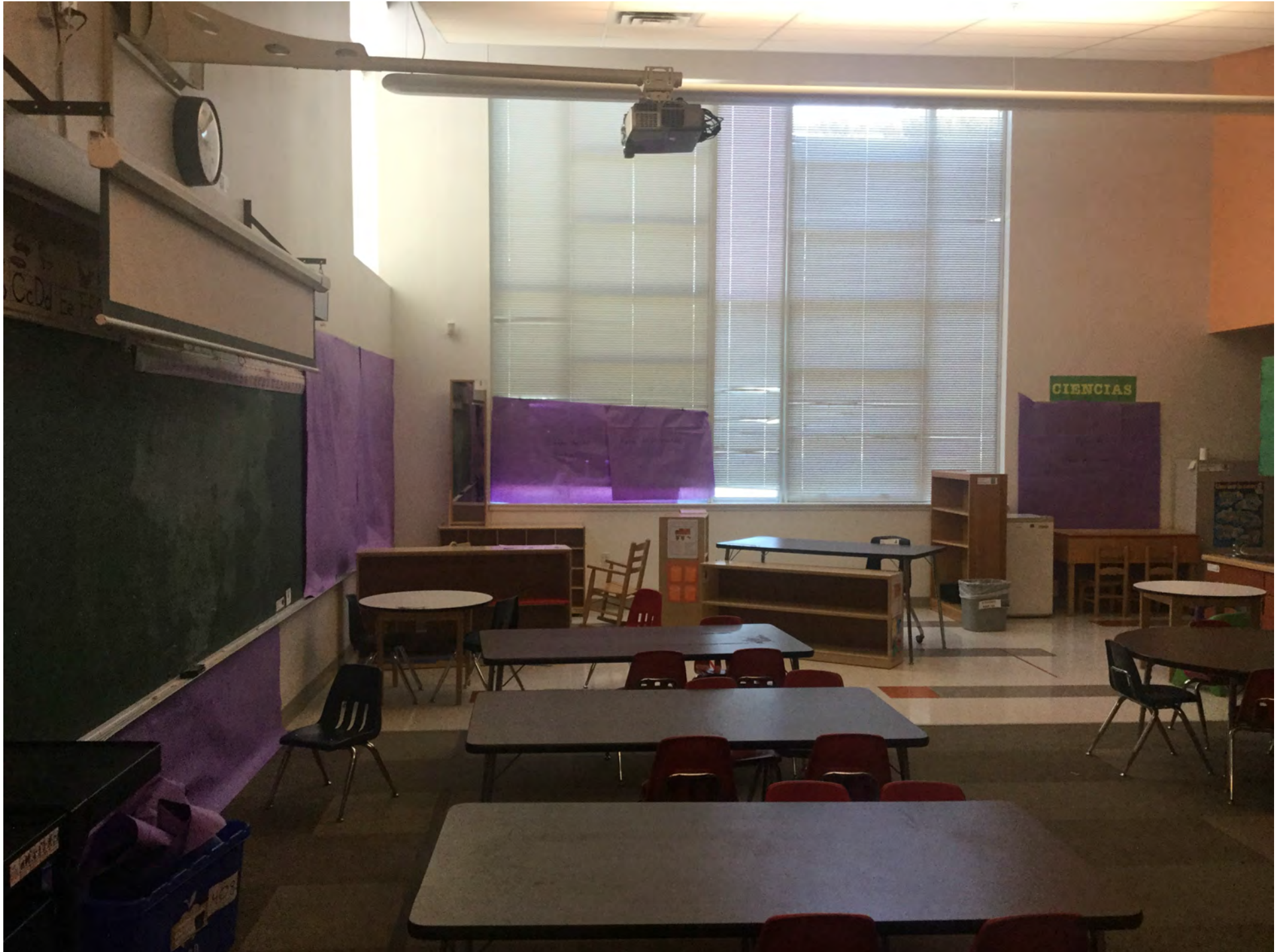
Photo 3. Classroom