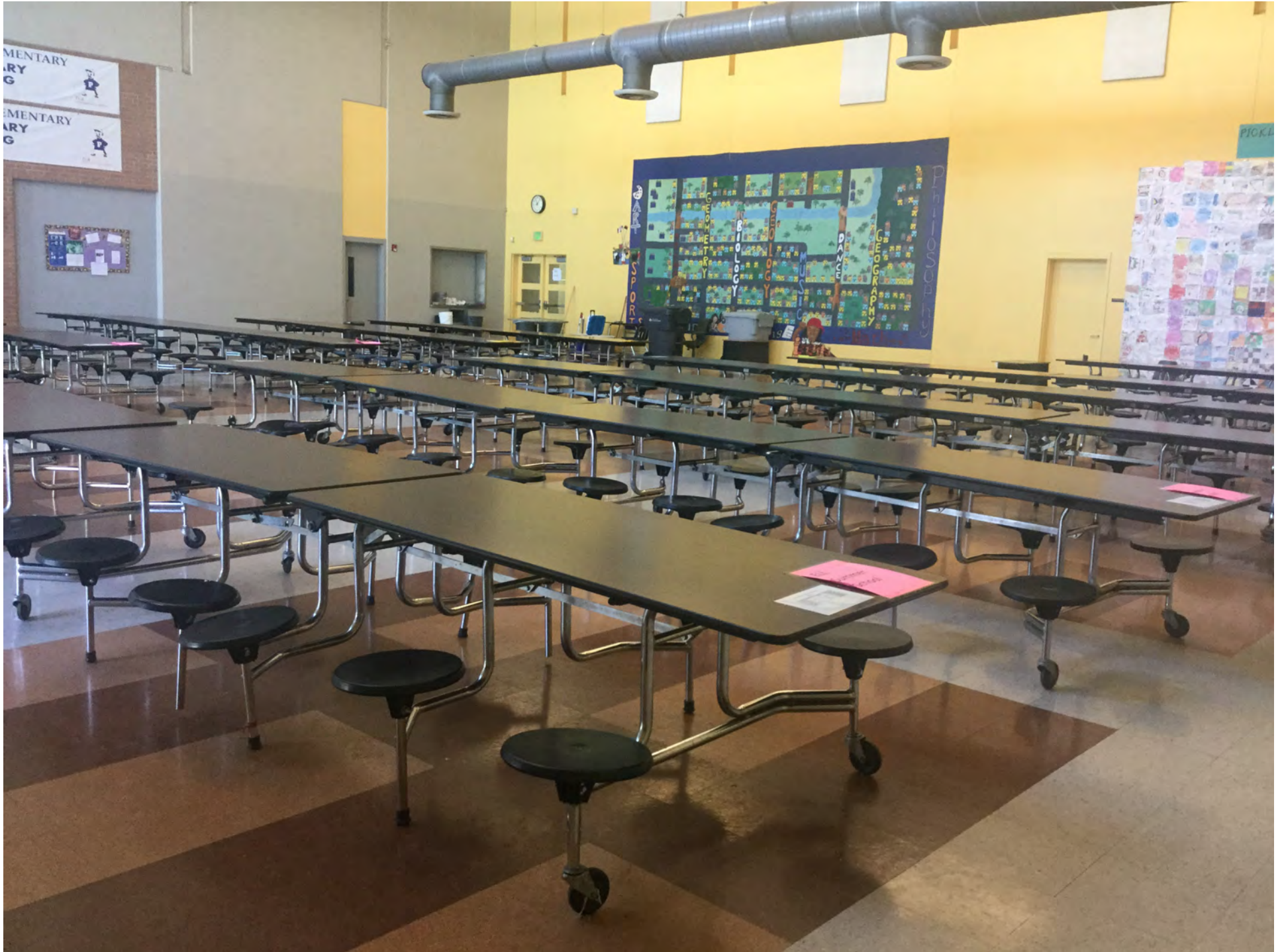
Photo 7. Cafeteria