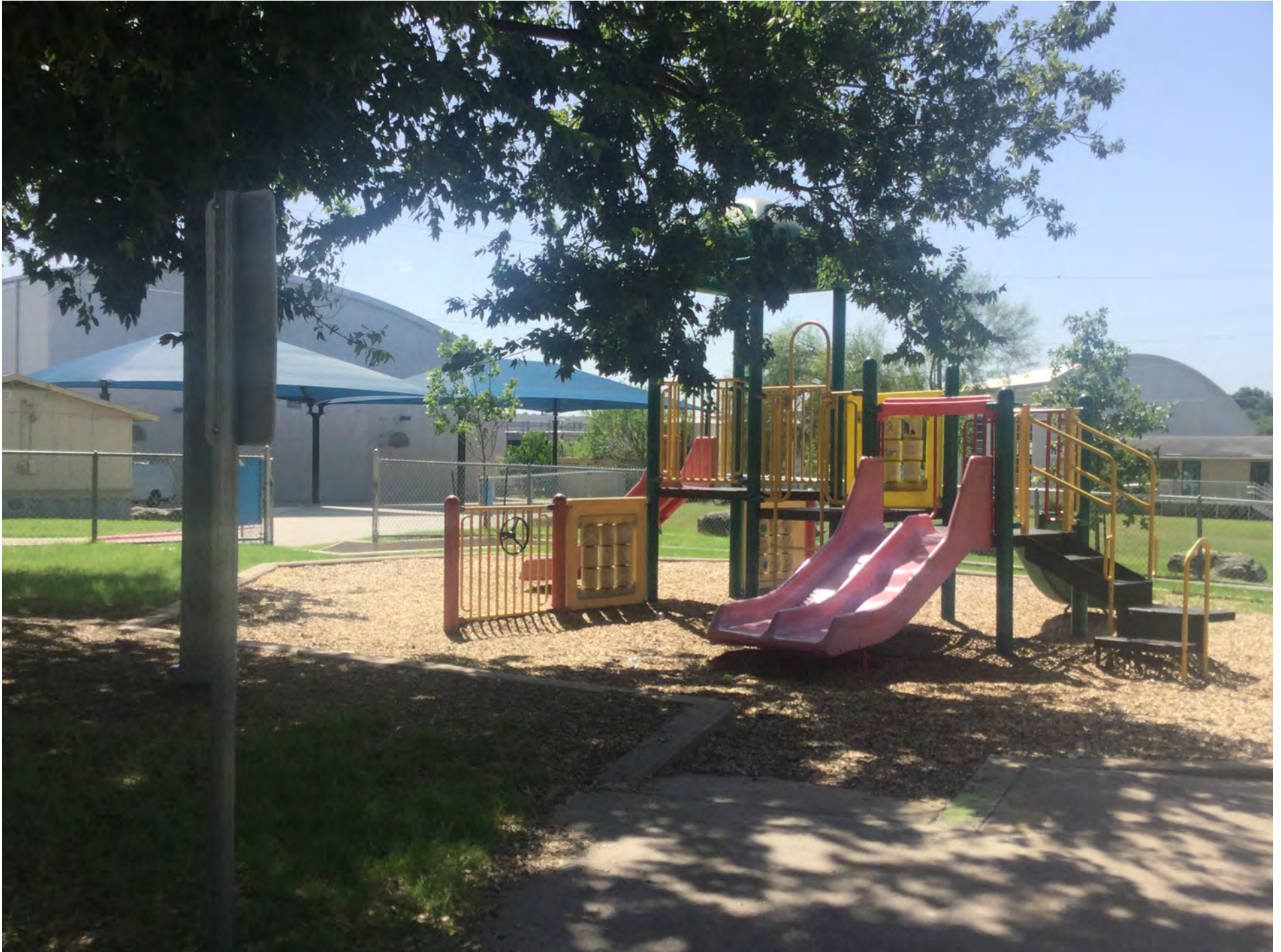
Photo 1. Outdoor Area