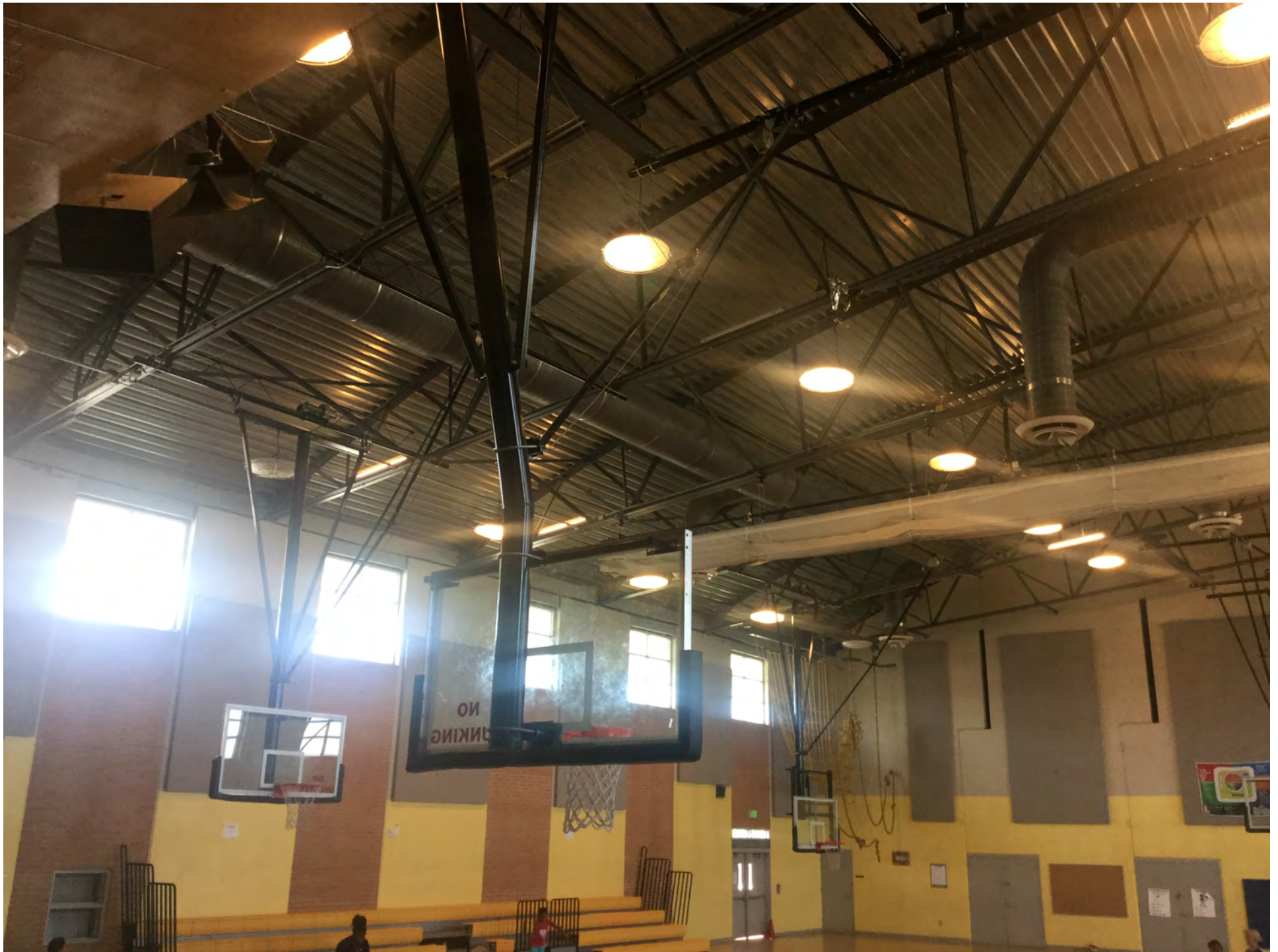
Photo 4. Gymnasium