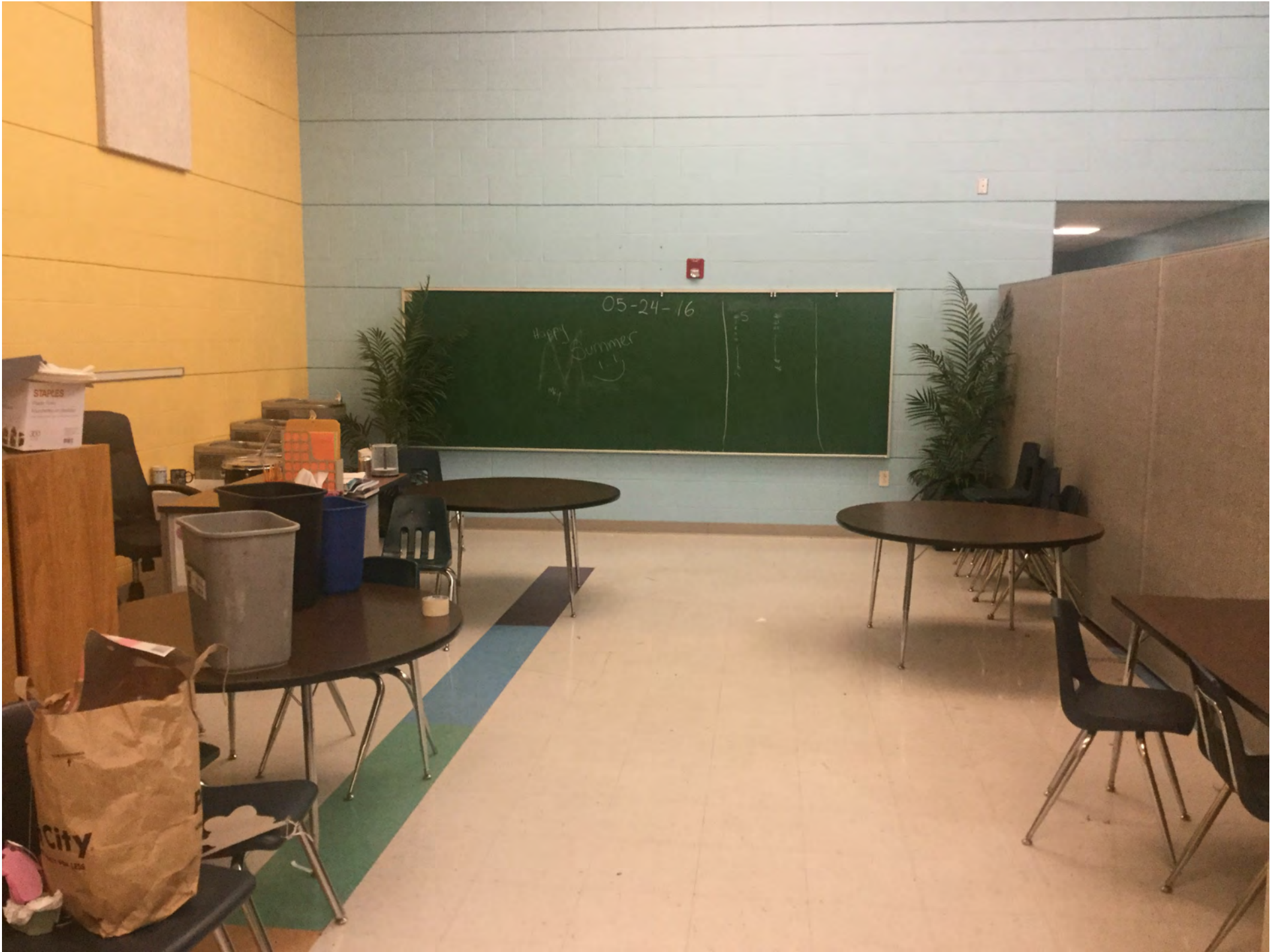
Photo 8. Flex Space