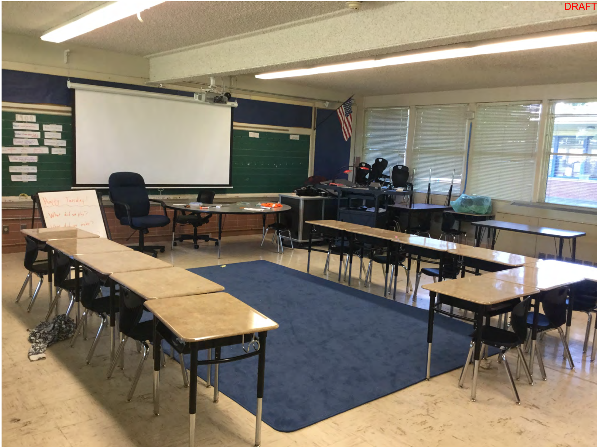
Photo 10. 9.1 Furniture