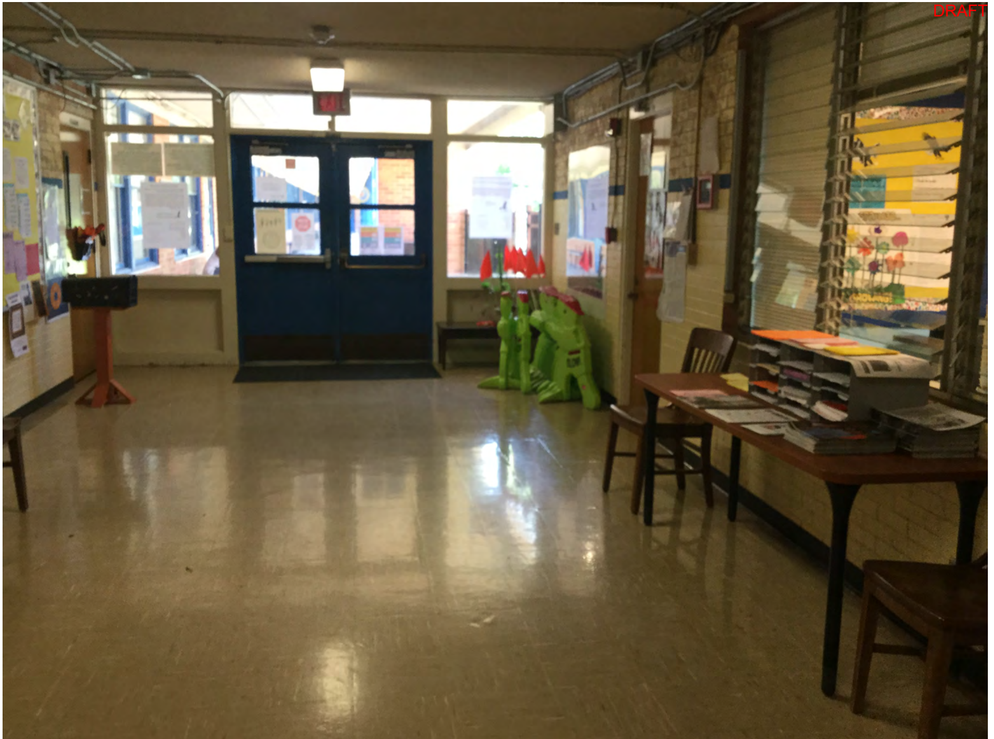
Photo 8. 6.3 Main Entrance