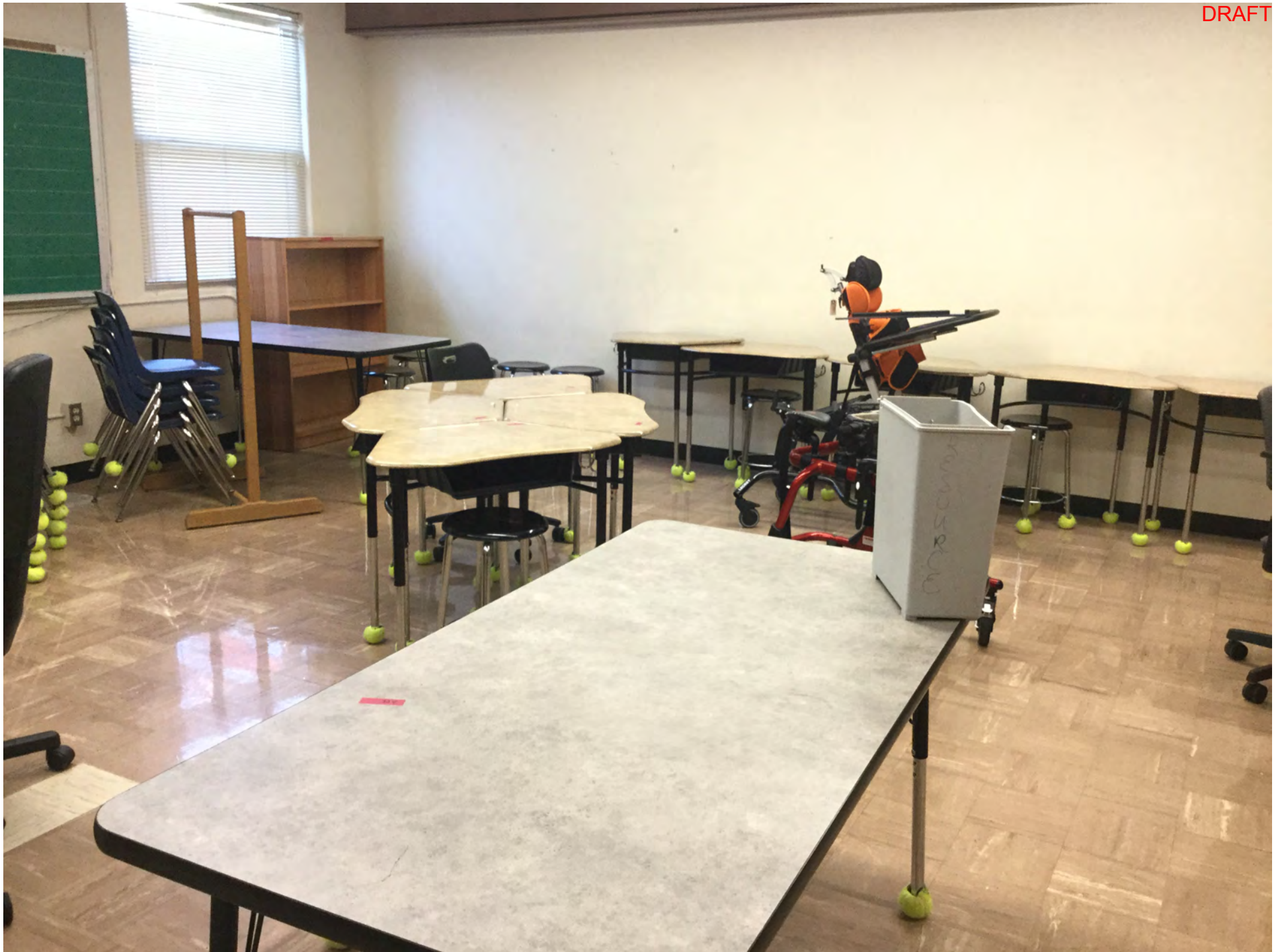
Photo 4. 3.14 Special Education Space