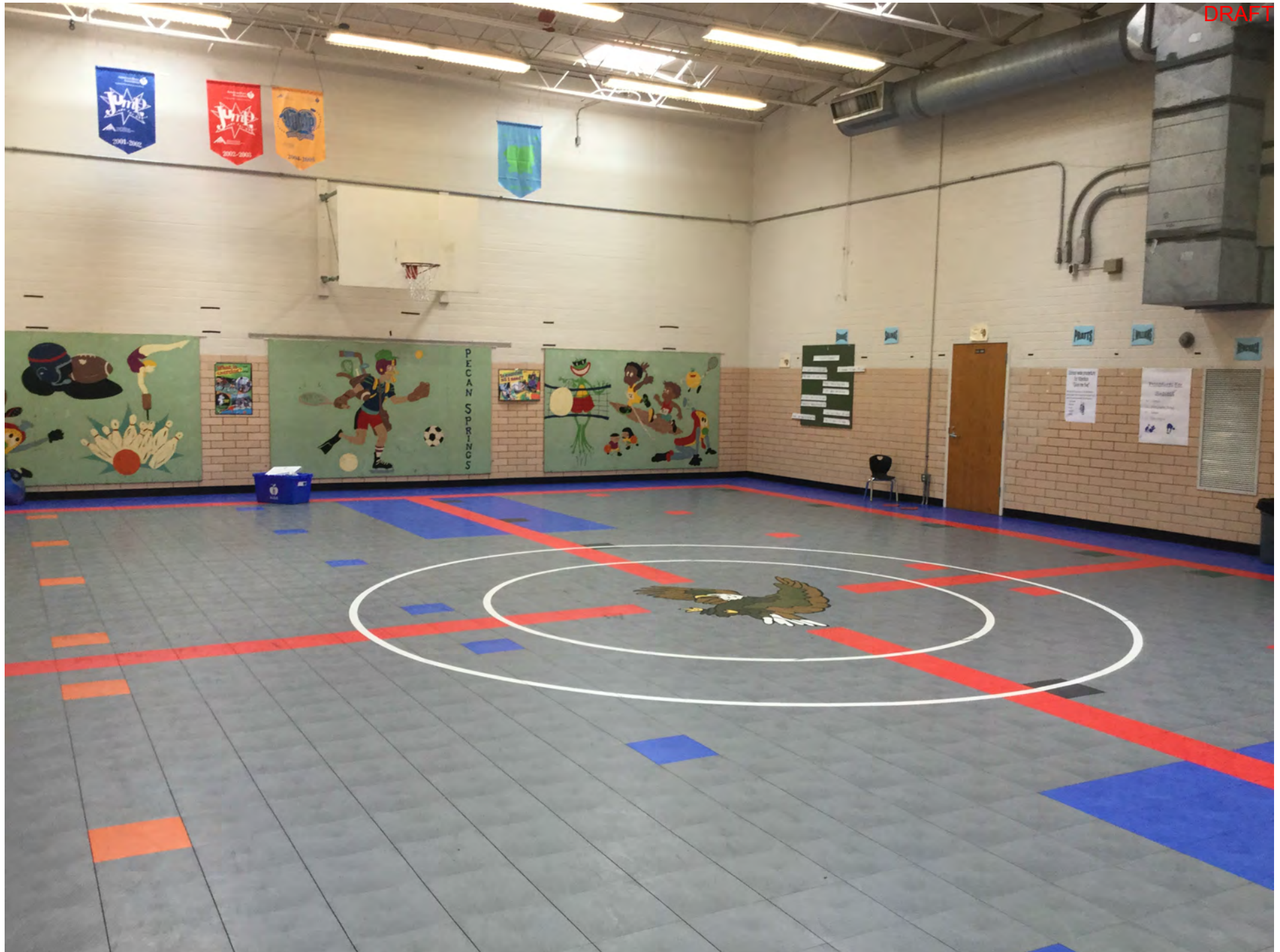
Photo 2. 3.6 Gym