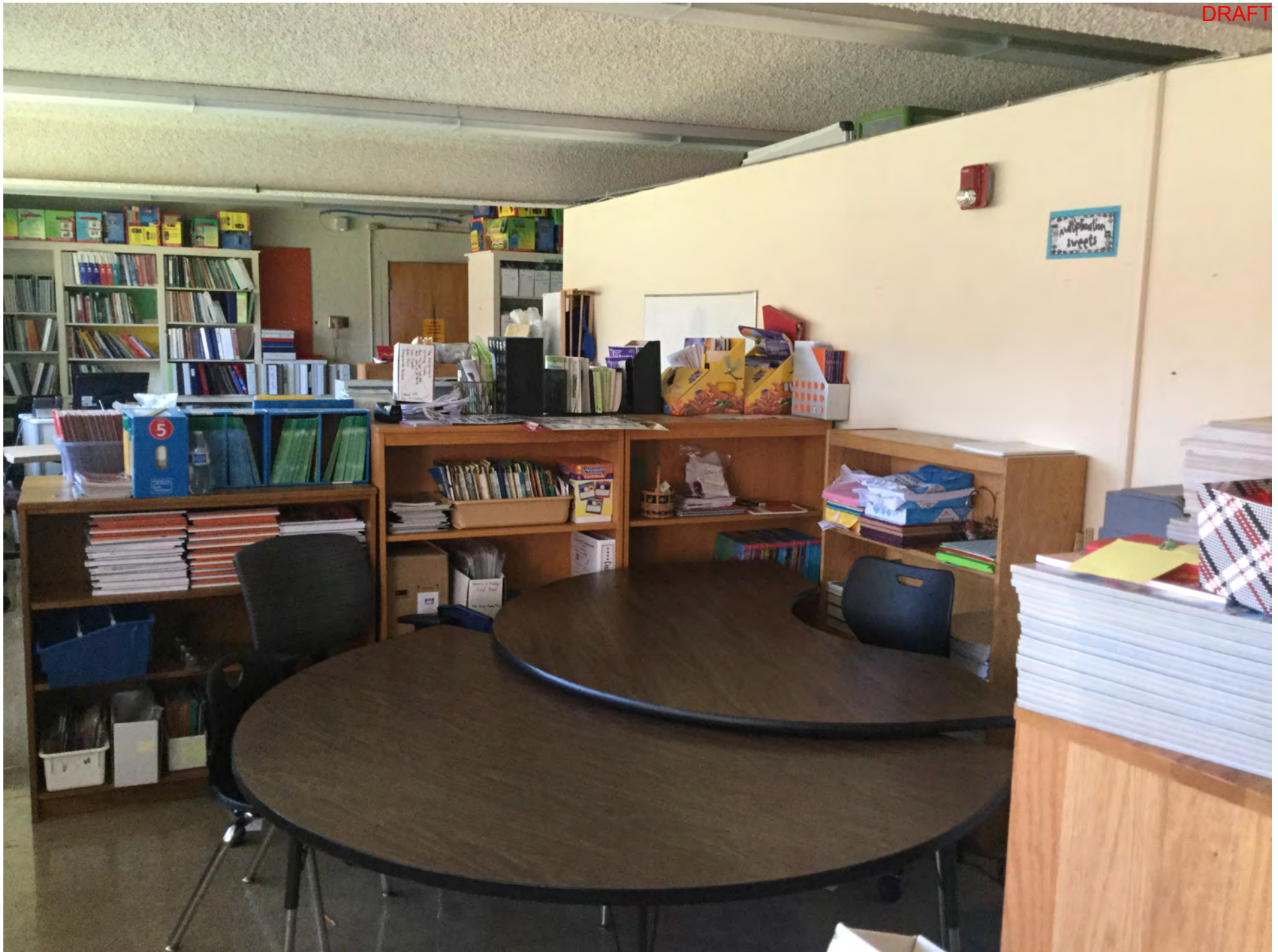
Photo 5. 4.1 Specialized Learning Space