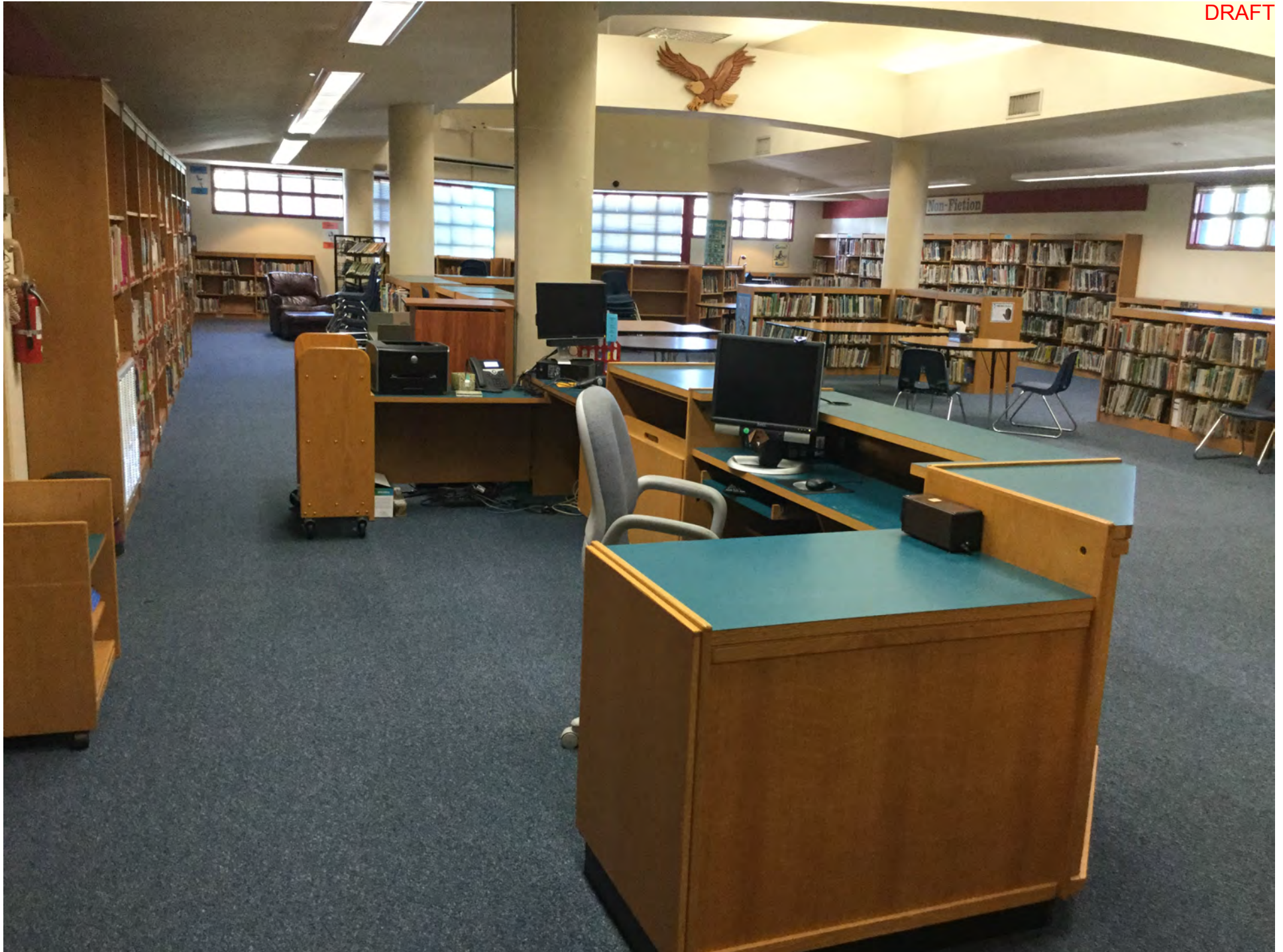
Photo 7. 5.4 Library