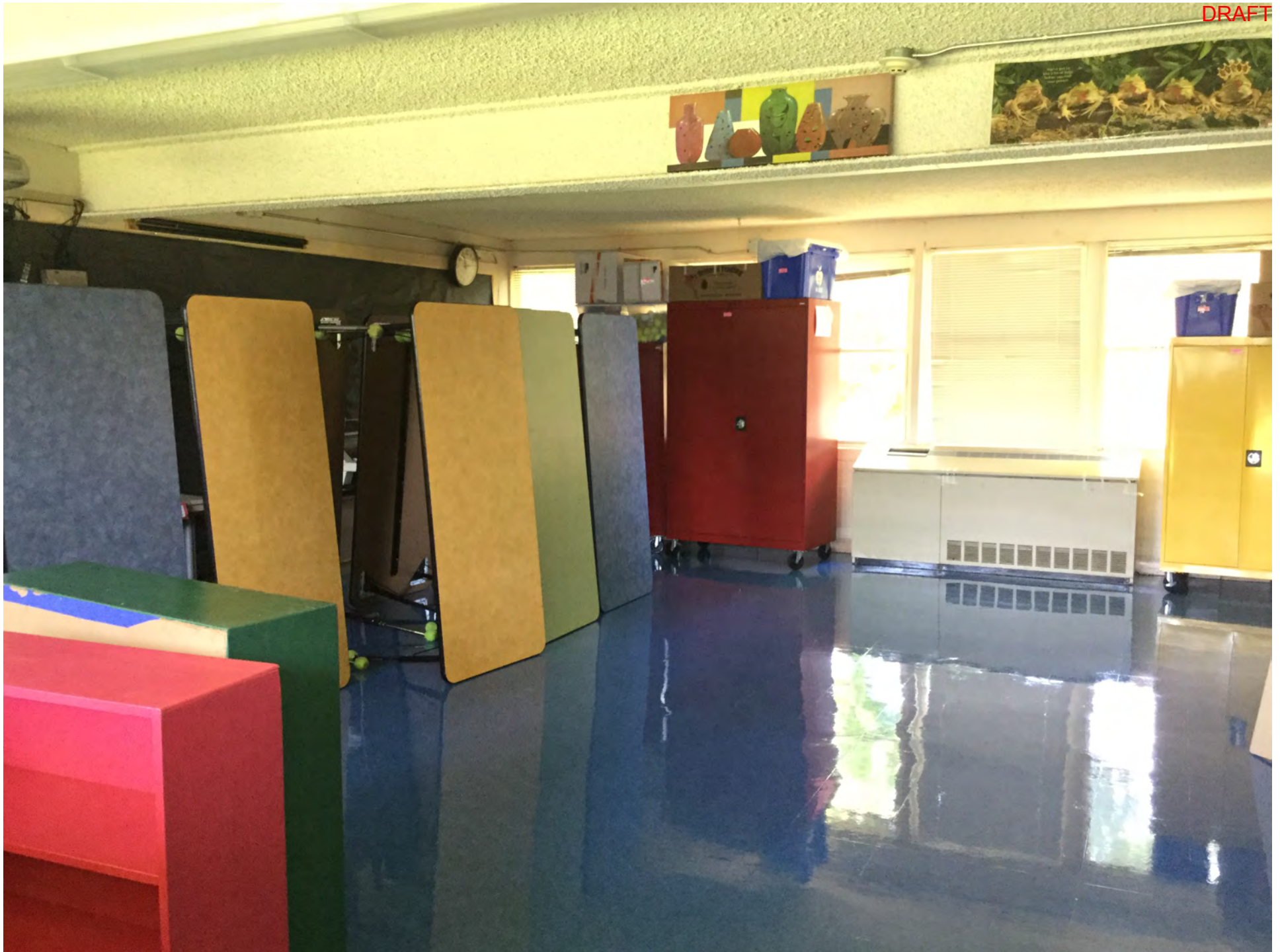
Photo 3. 3.10 Art Room