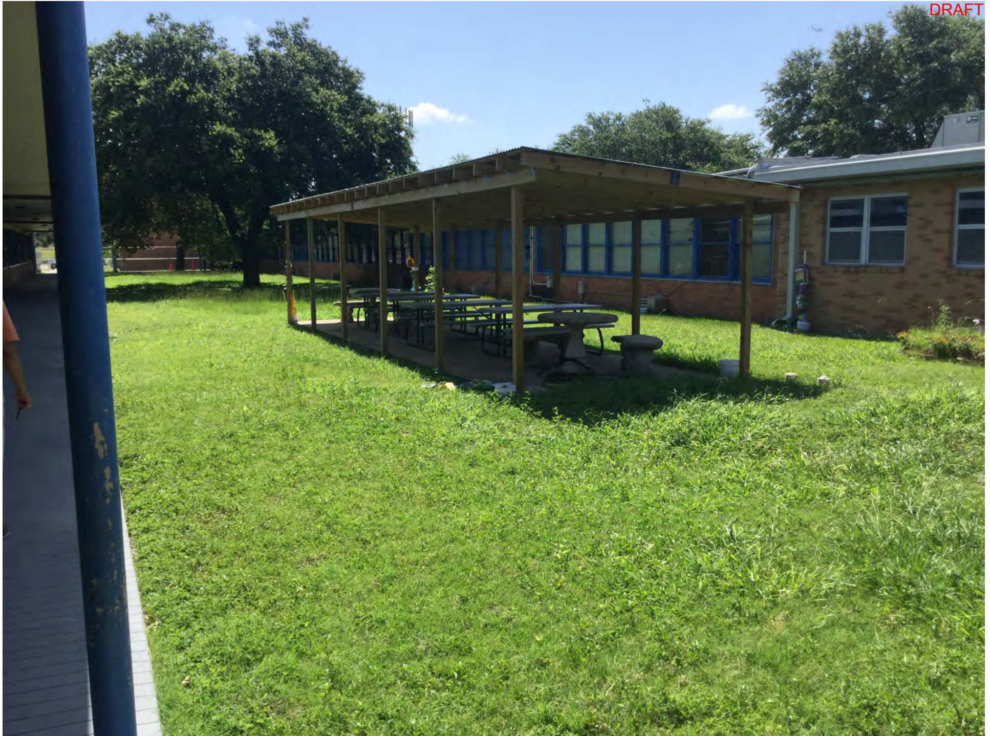
Photo 1. 1.2 Outdoor Spaces