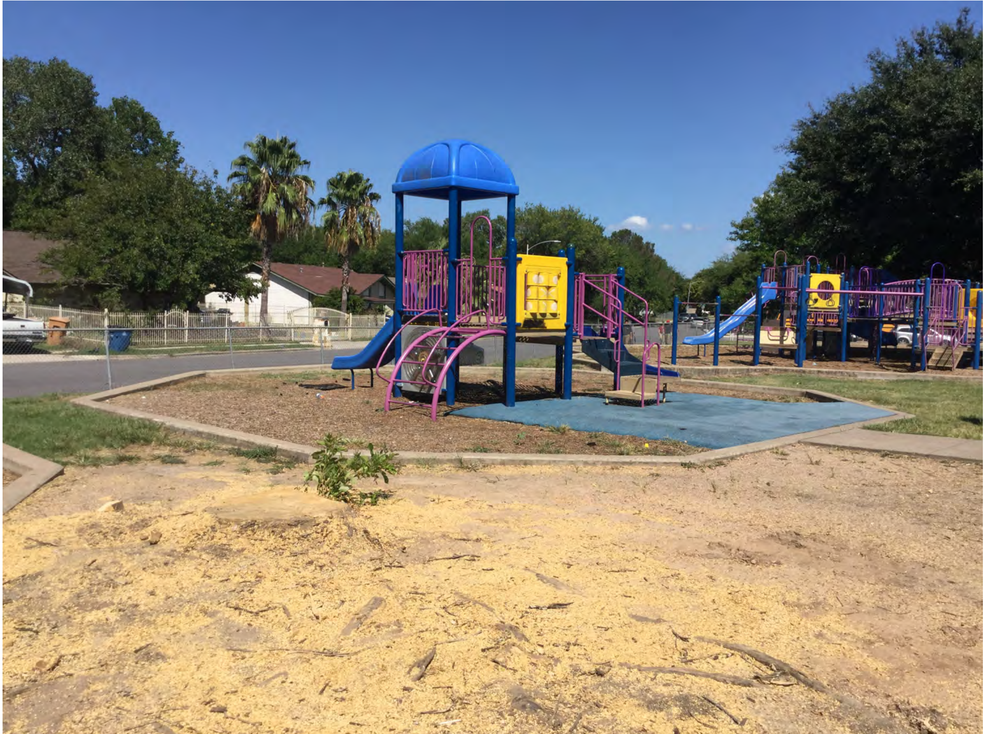
Photo 1.3 Playground