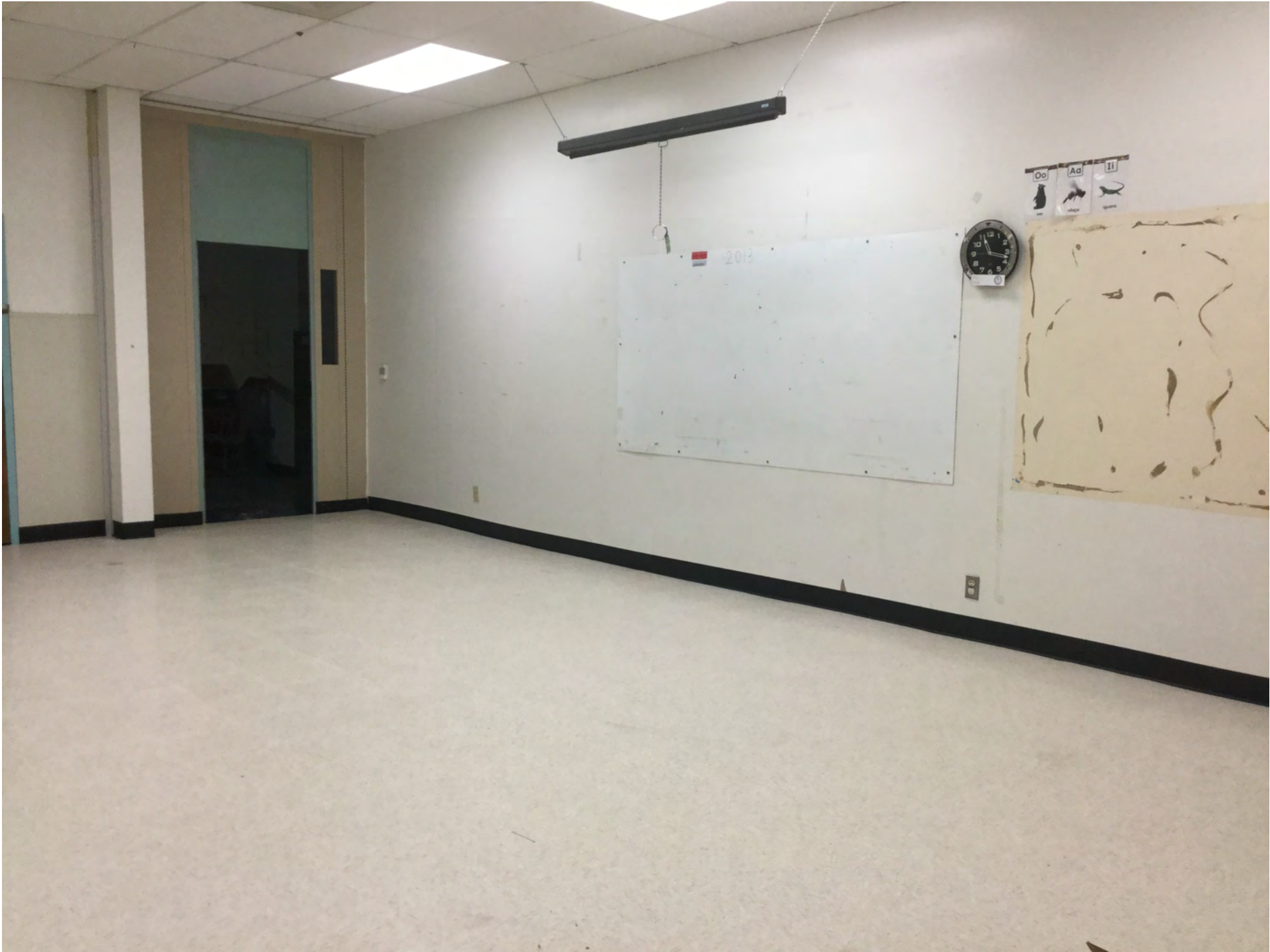
4.10 Visual Communication Tools