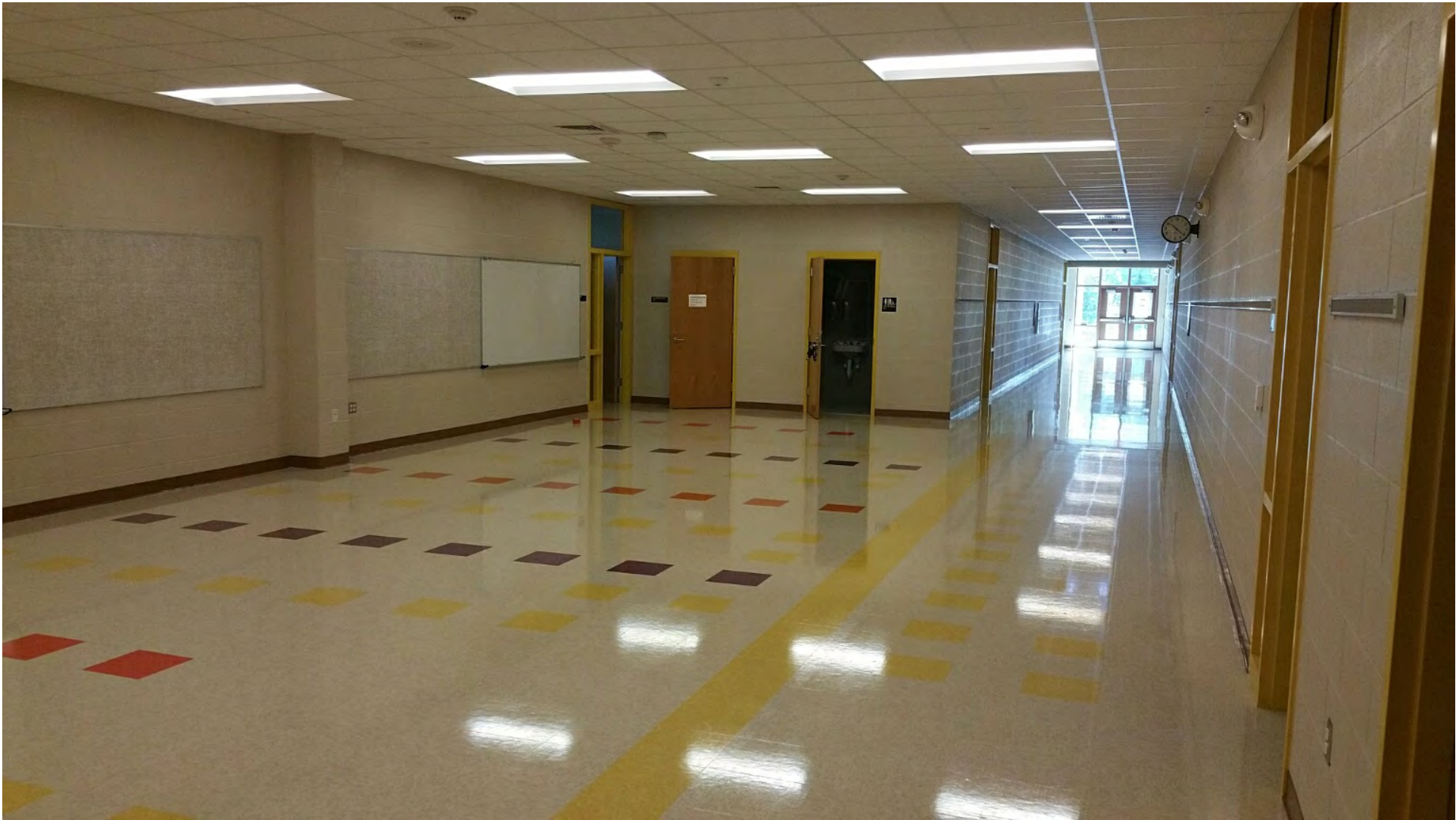
Photo 7. Classroom Wing Pods