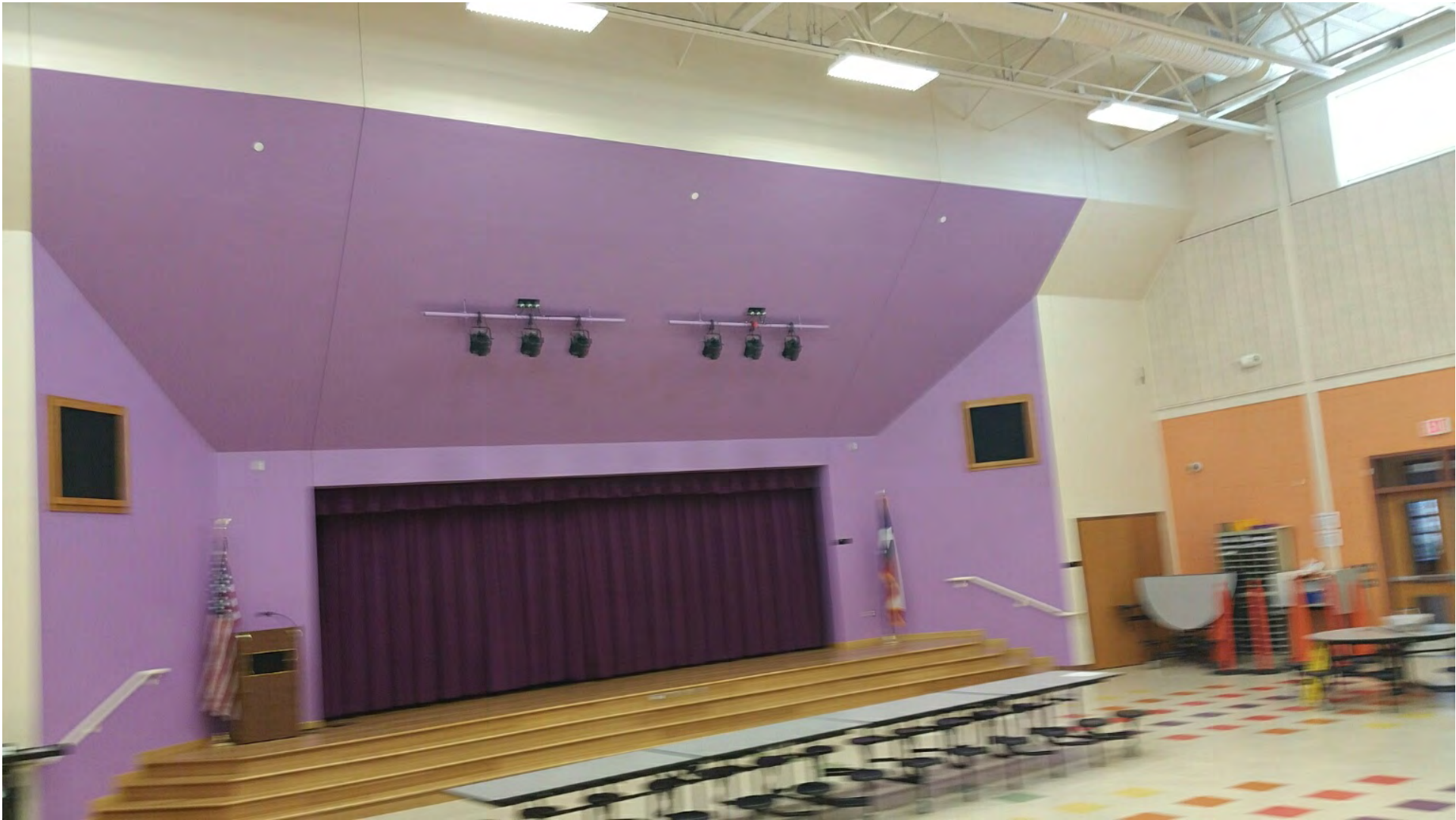
Photo 4. Cafetorium