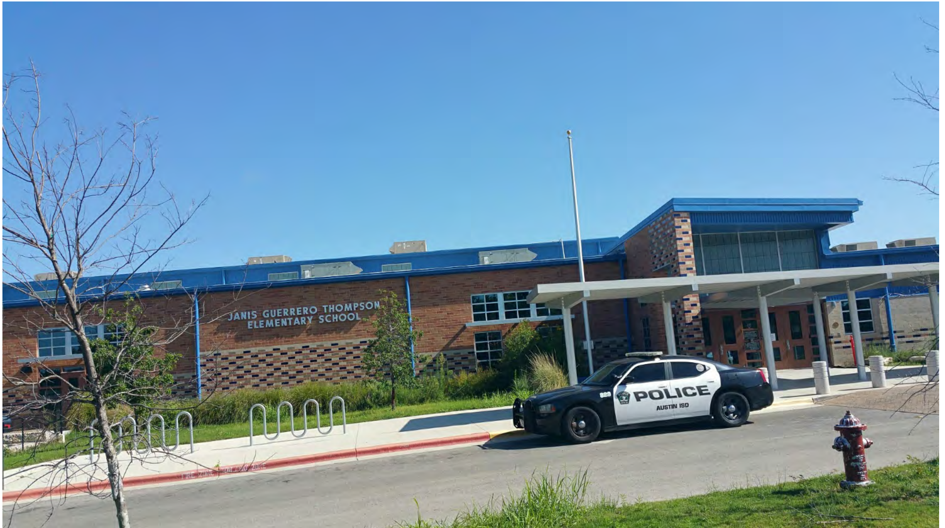
Photo 1. Entry