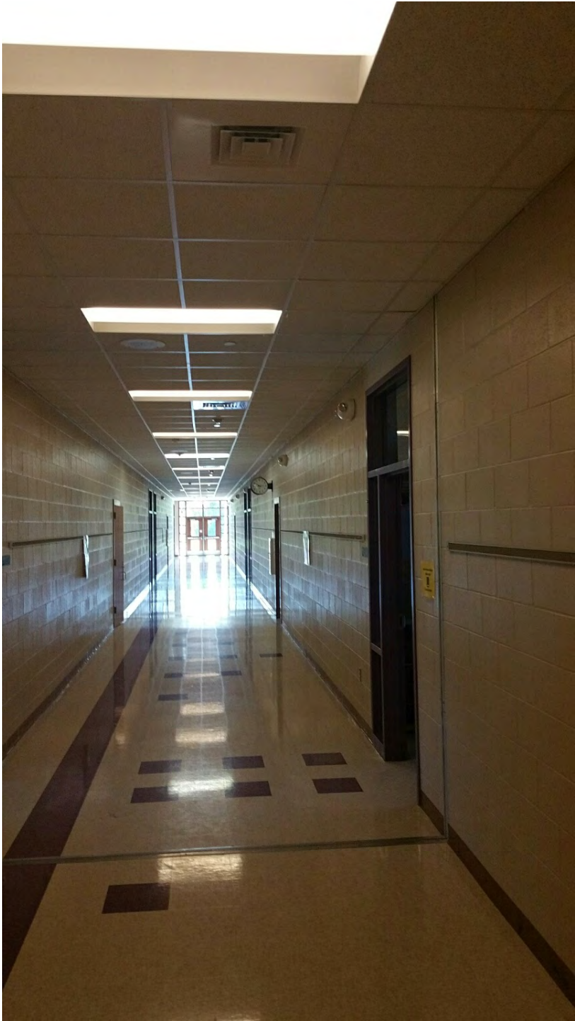
Photo 2. Standard Corridor