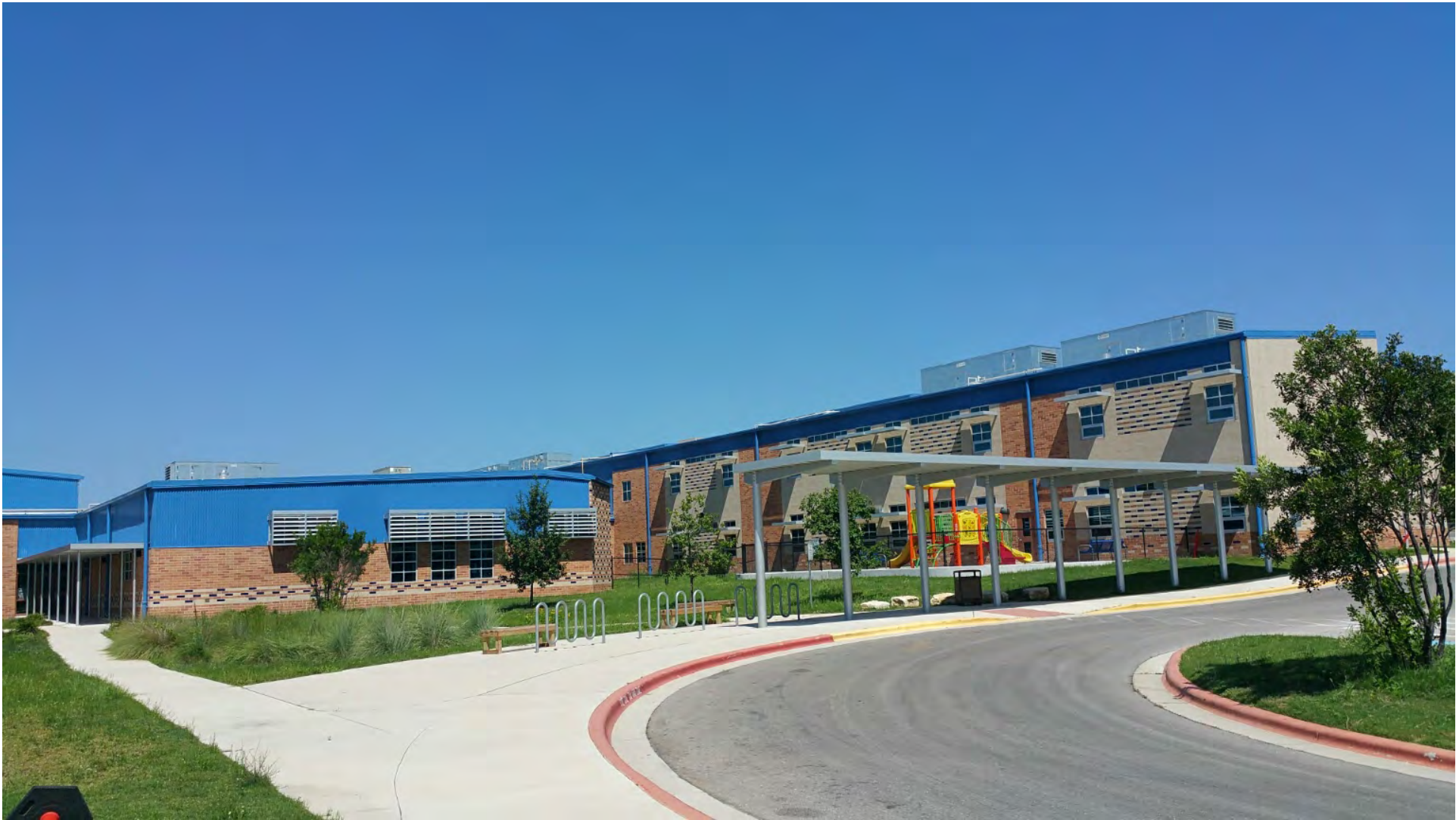
Photo 10. Rear Pick Up