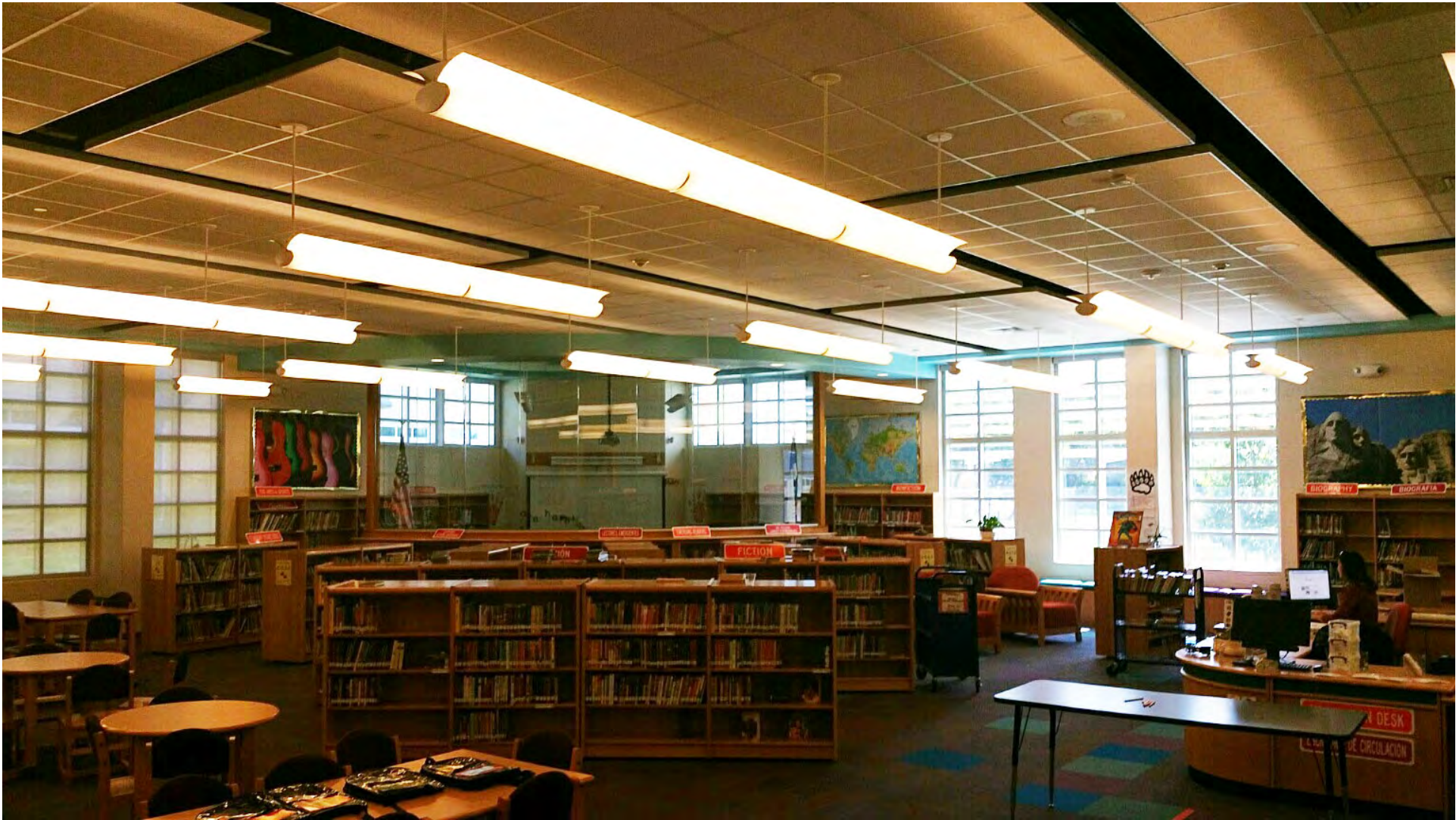
Photo 5. Library