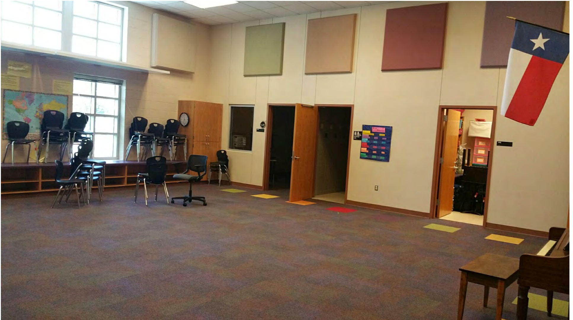
Photo 8. Music