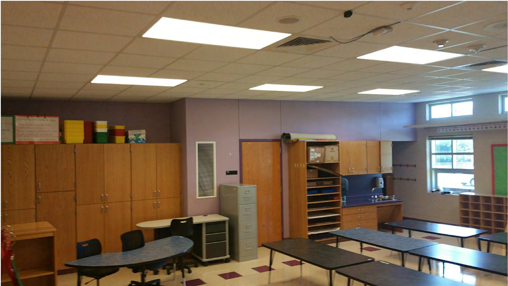
Photo 3. Classroom Storage