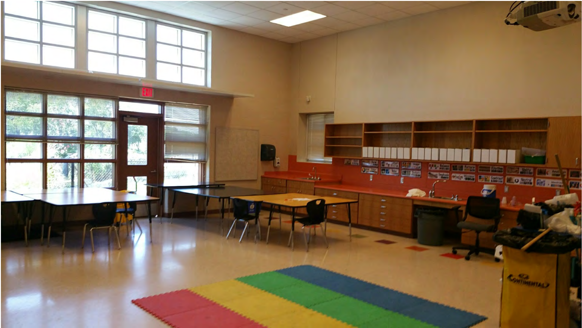
Photo 9. Art