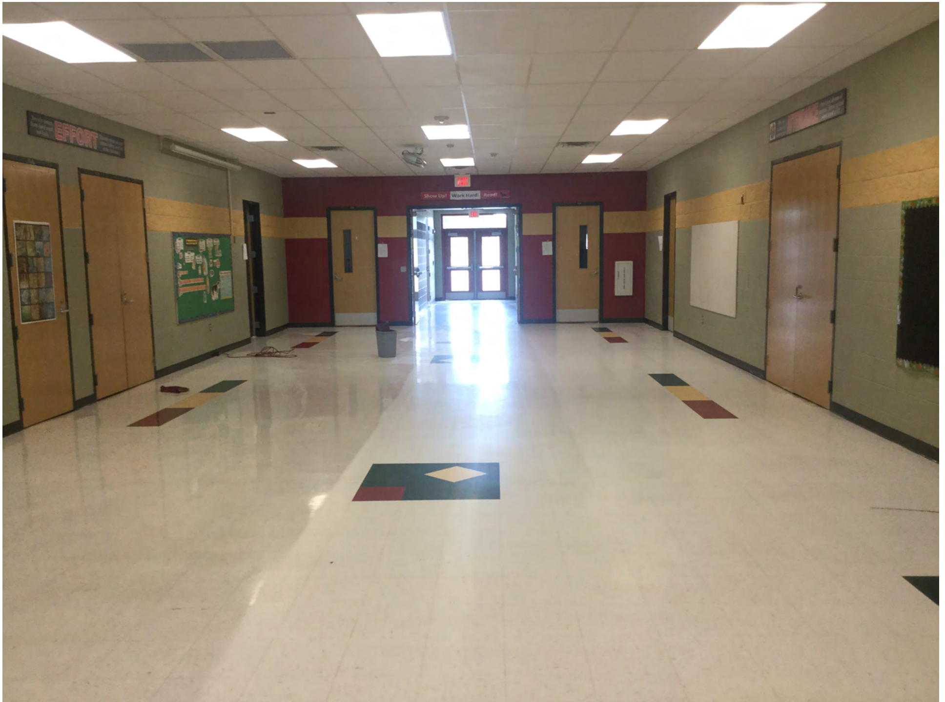
Photo 9. 4.5 Collaborative Space