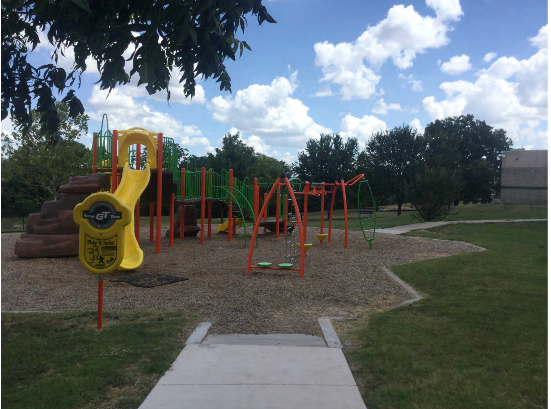
Photo 1. 1.3 Outdoor Playfield