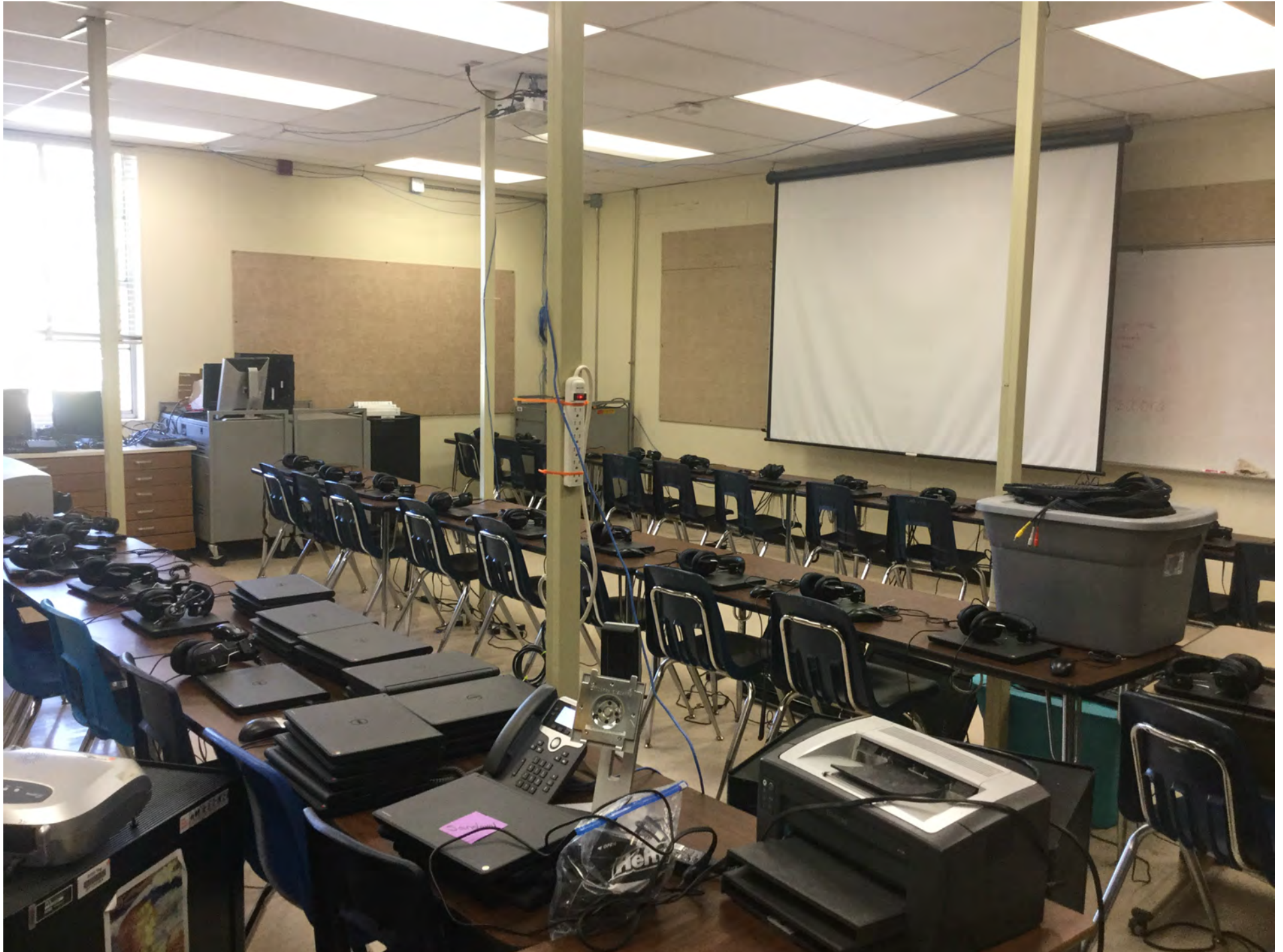
Photo 6. 3.12 Computer Lab