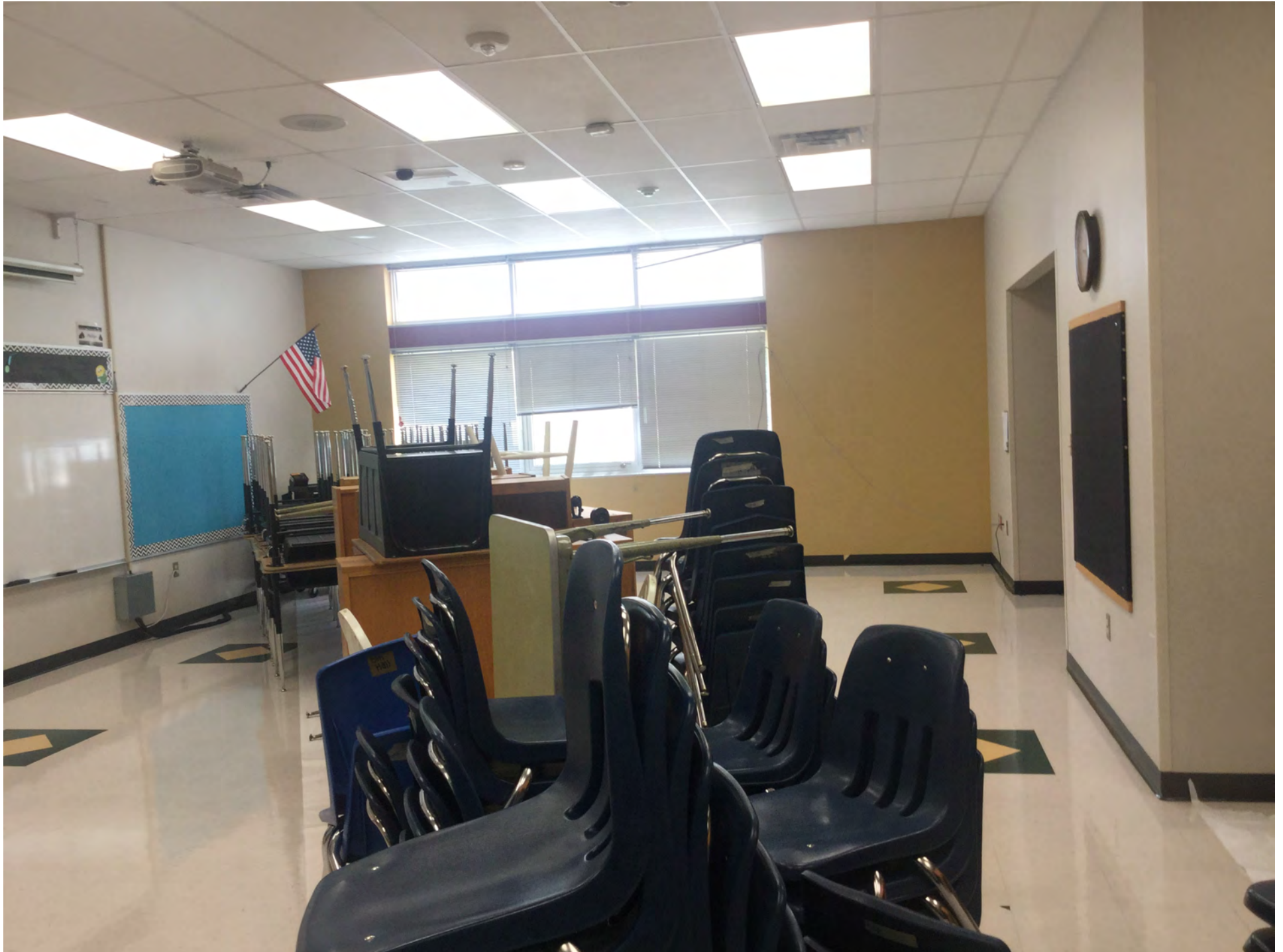
Photo 8. 4.2 Standard Classroom