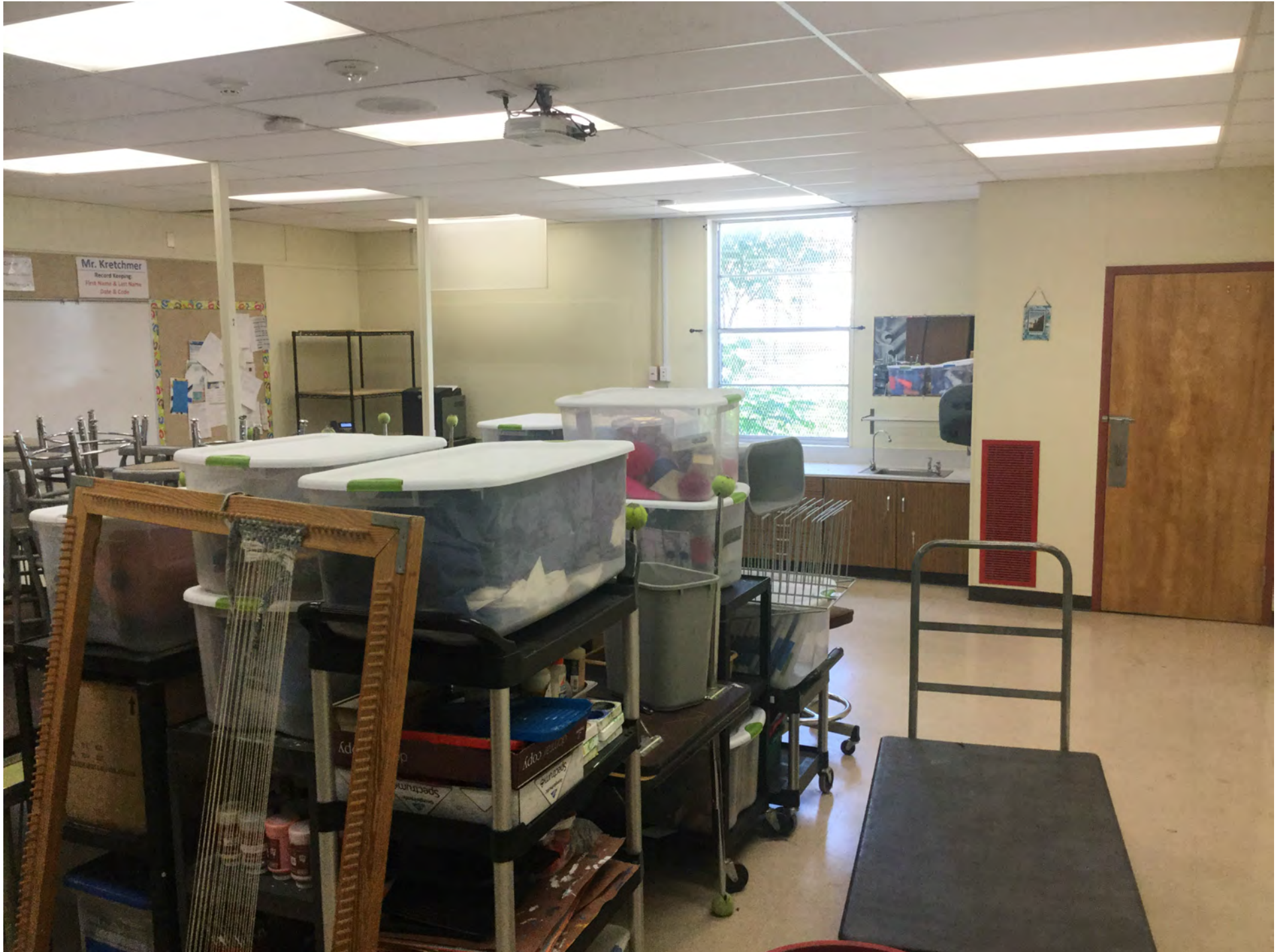
Photo 5. 3.10 Art Room