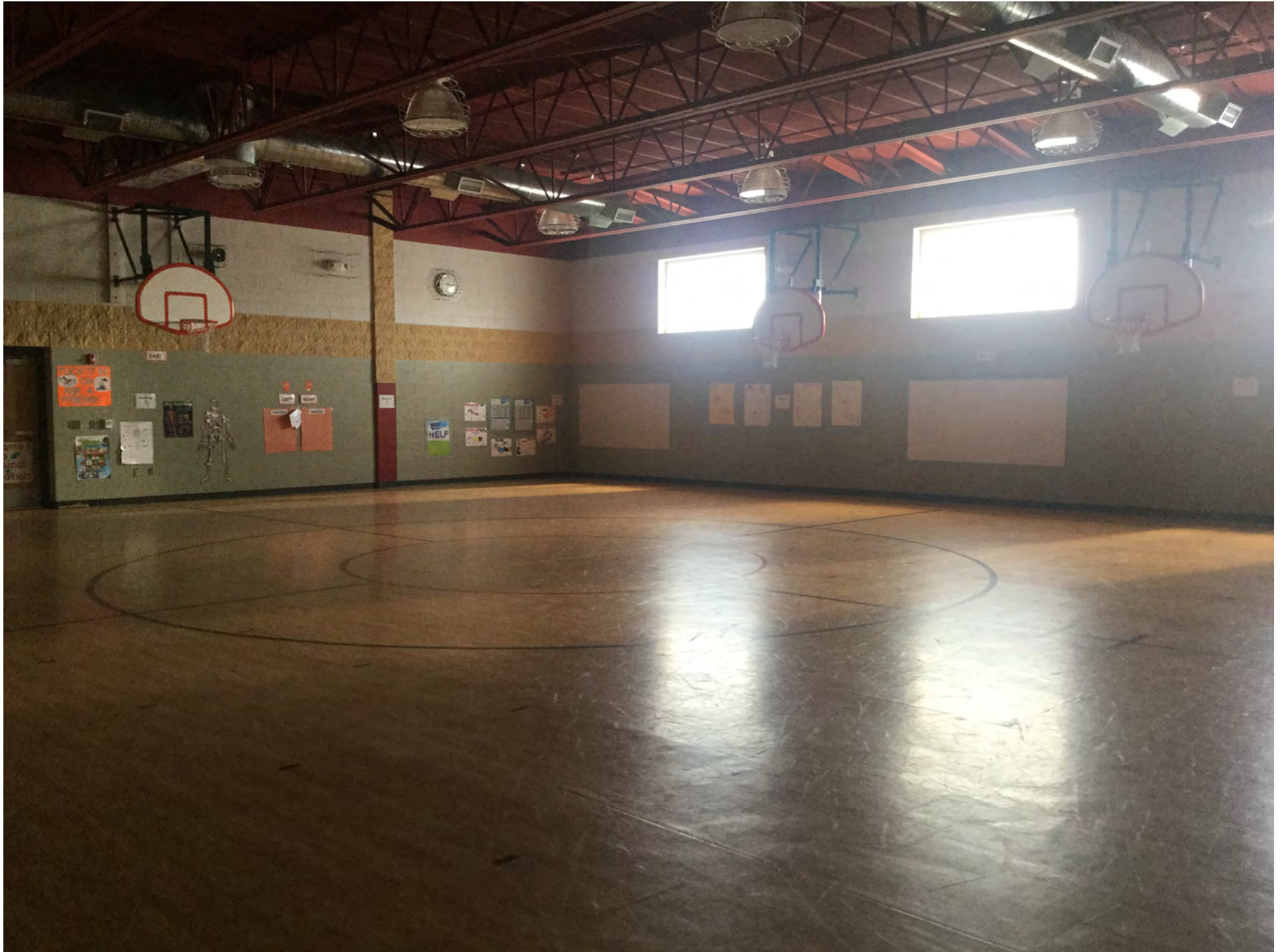
Photo 3. 3.6 Gym