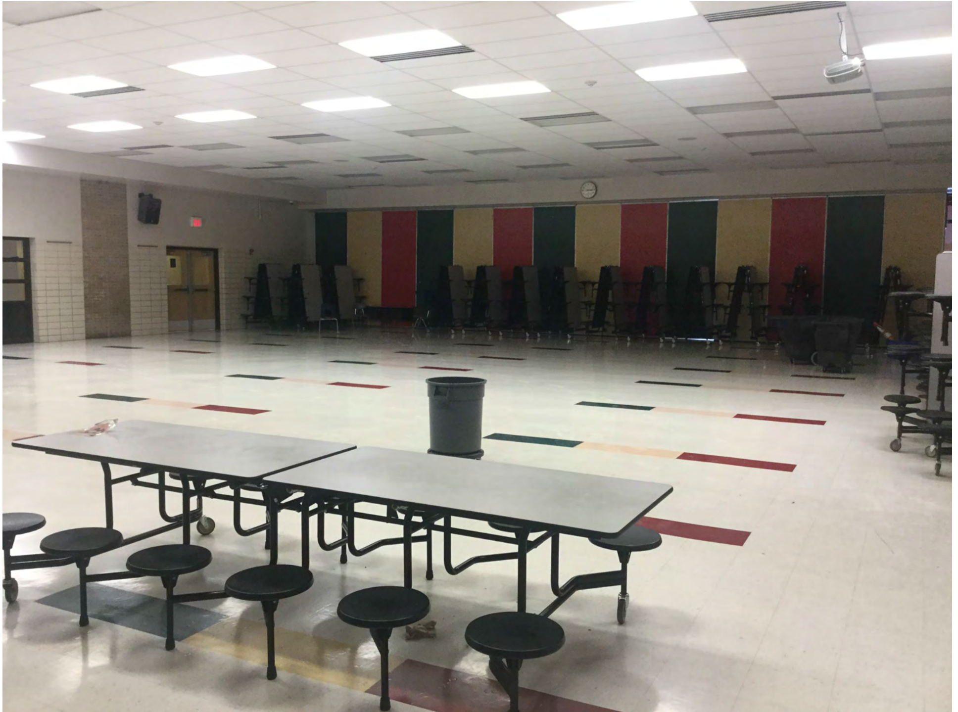
Photo 7. 3.16 Dining Facility