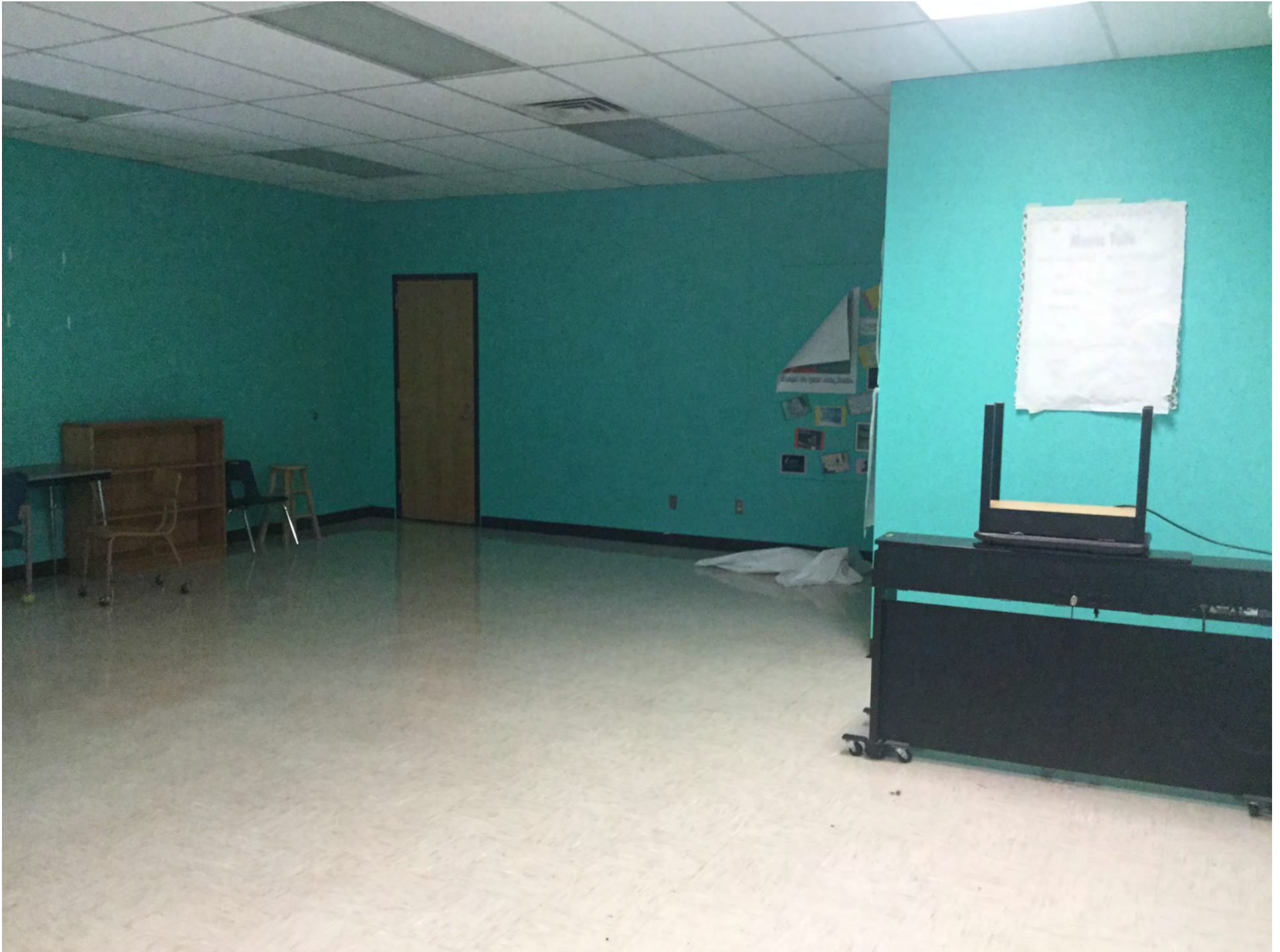
Photo 4. 3.8 Music Room