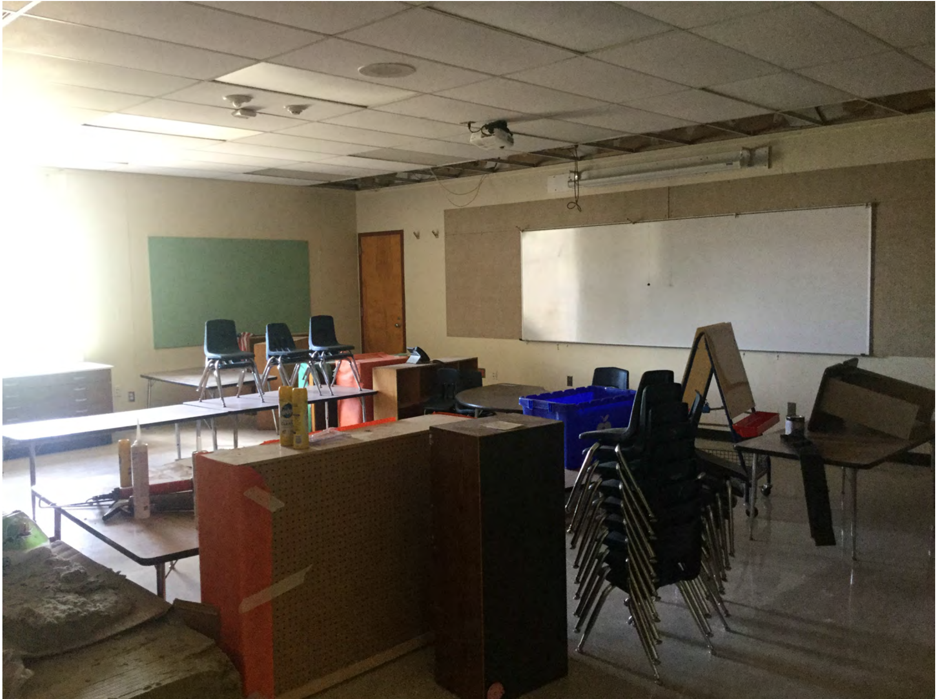
Photo 2. 3.2 Pre-K Space