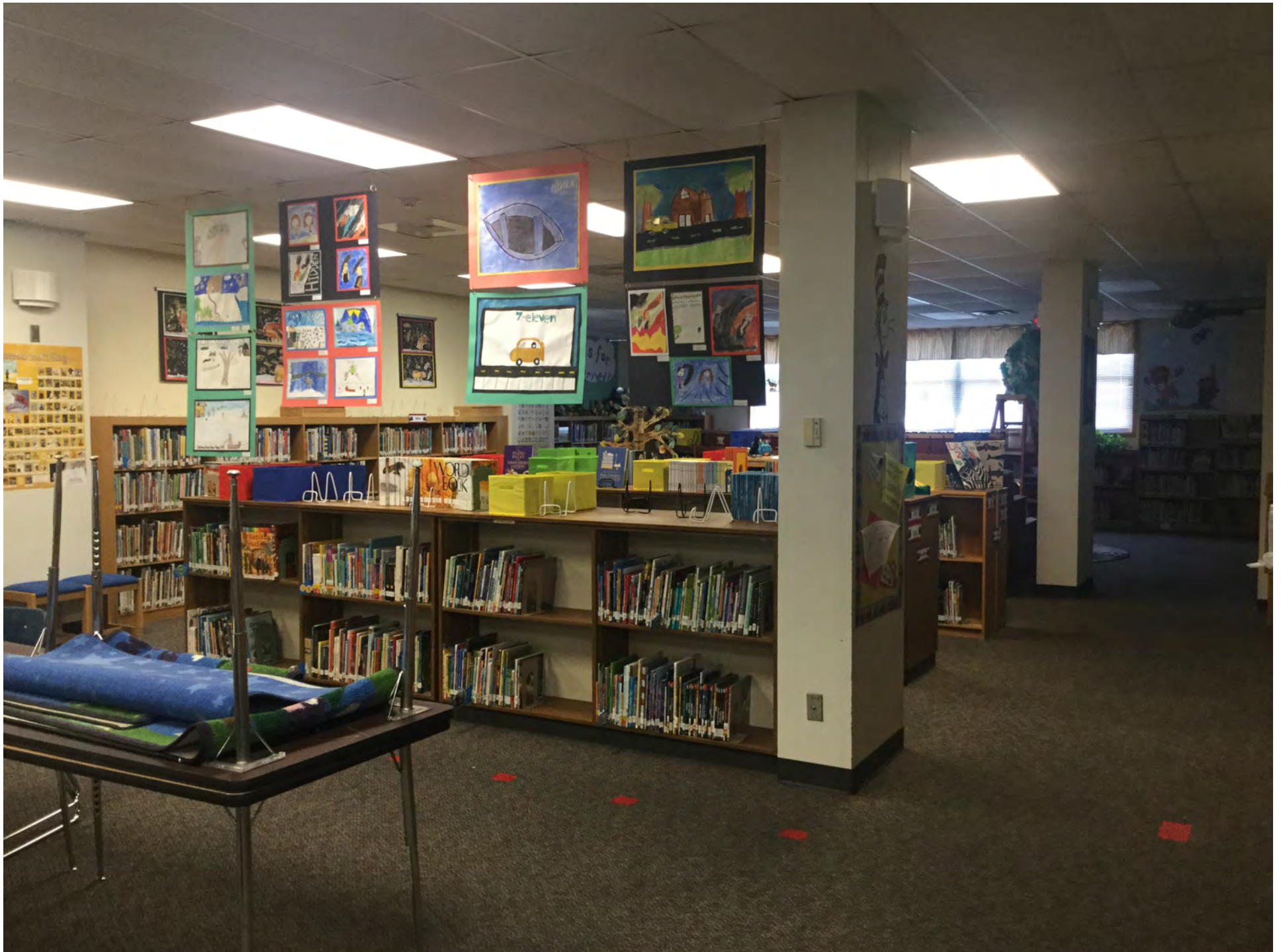
Photo 10. 5.5 Library