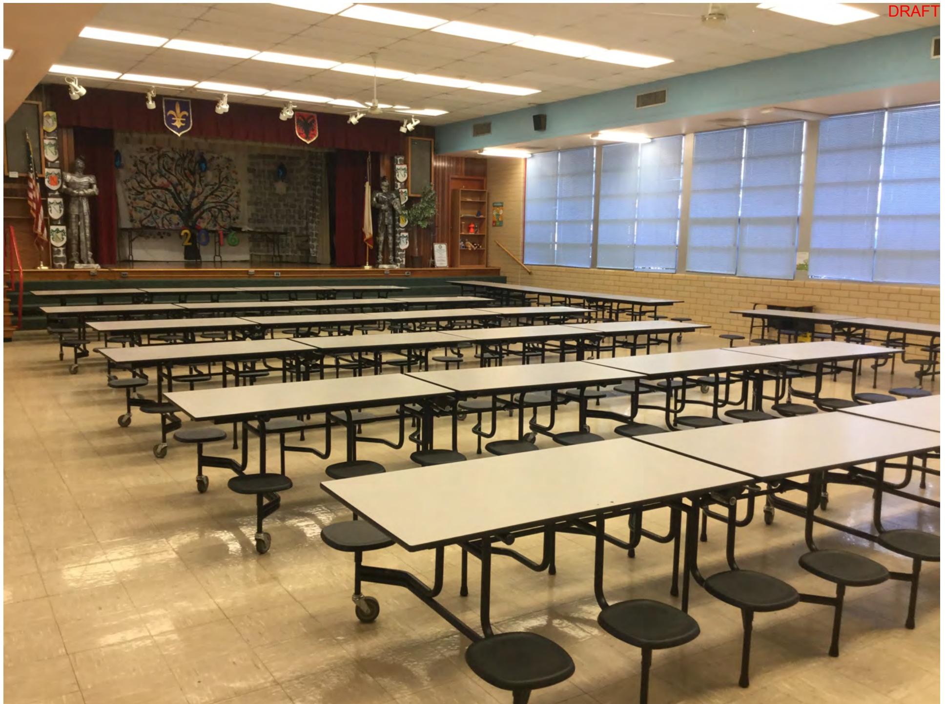
Photo 6. 3.16 Cafetorium