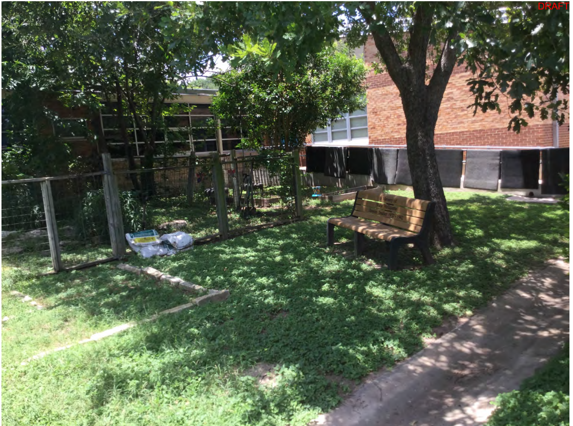
Photo 2. 1.2 Outdoor Space