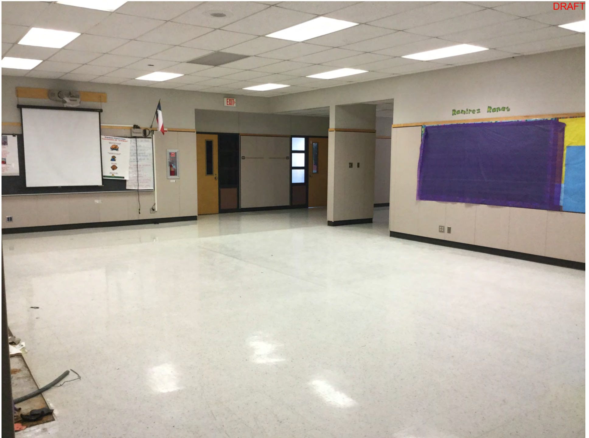
Photo 8. 4.5 Collaborative Space