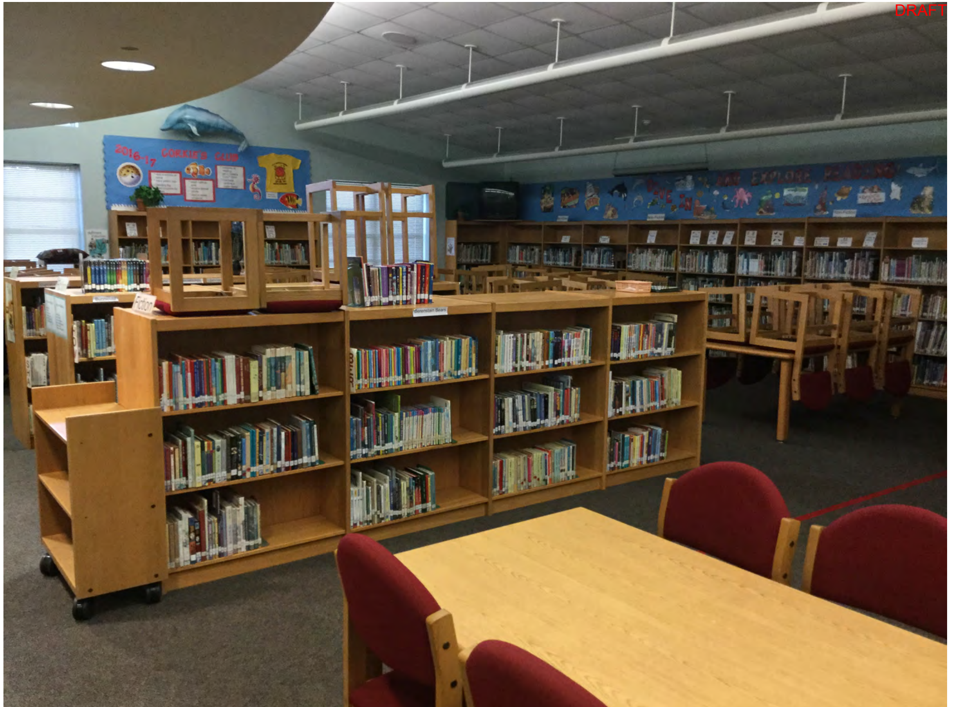
Photo 9. 5.4 Library