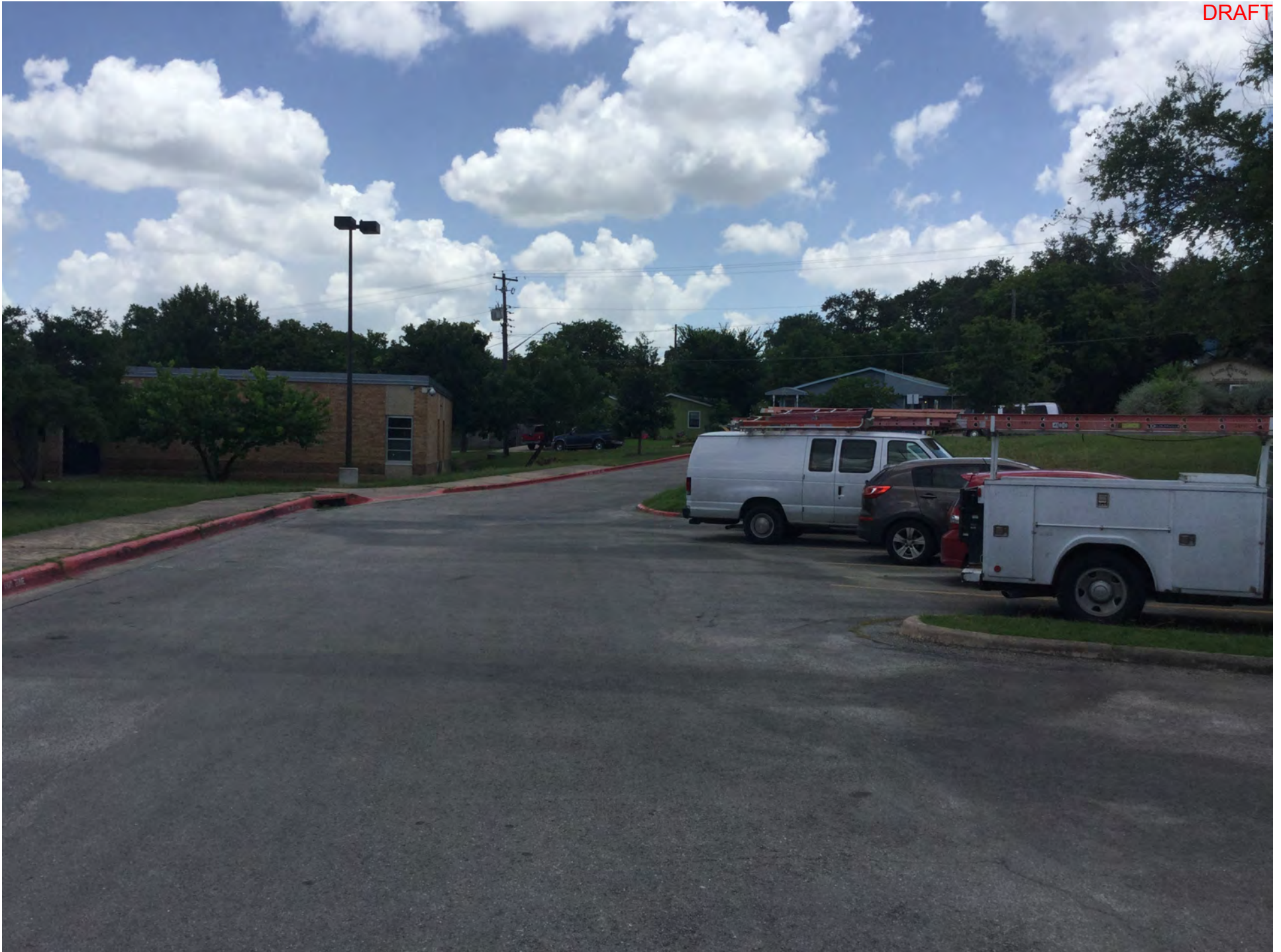
Photo 1. 1.1 Building Entry