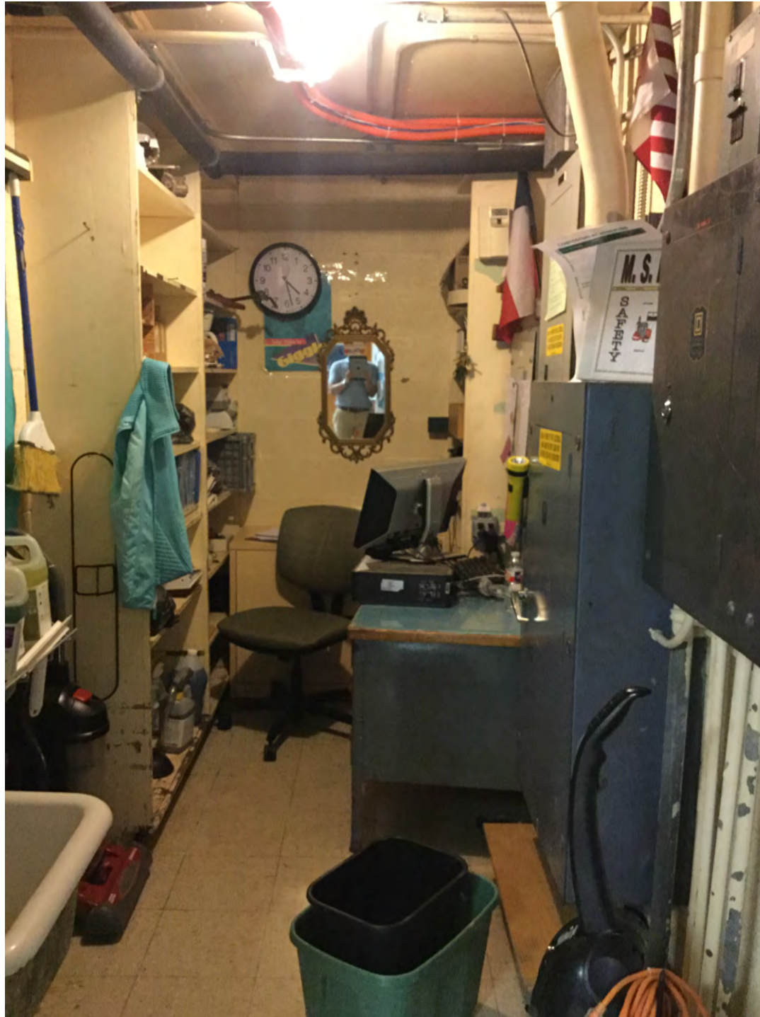
Photo 10. 8.1 Storage