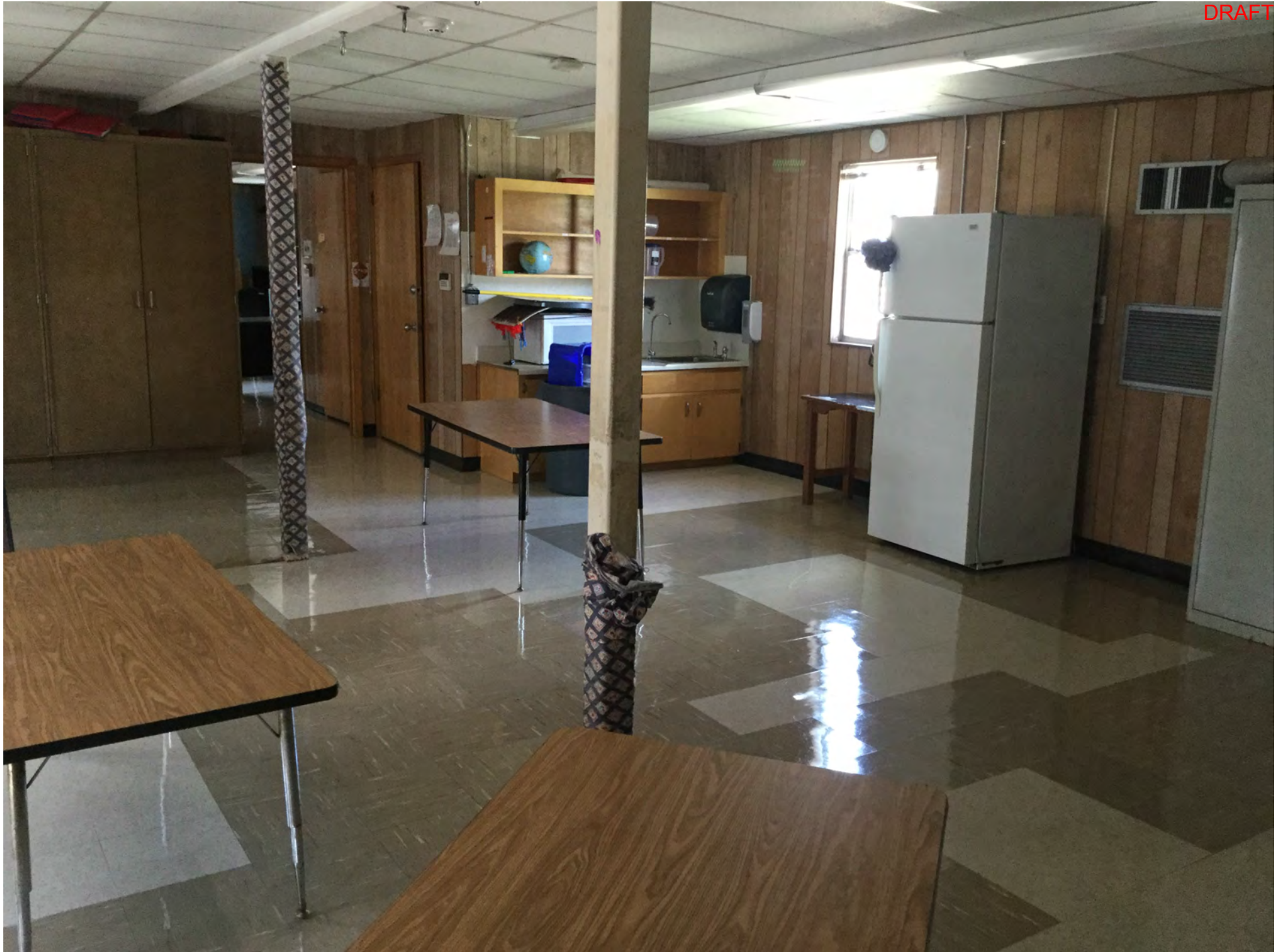
Photo 5. 3.14 Special Education Space