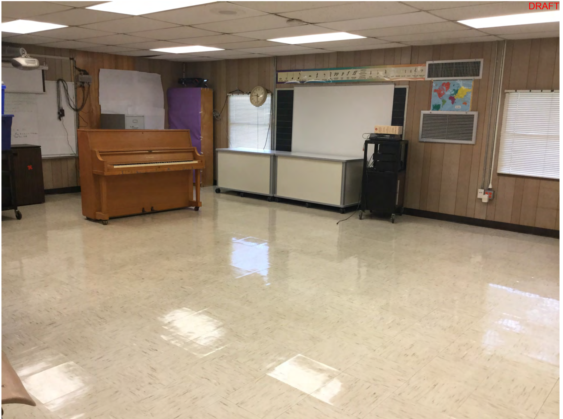
Photo 4. 3.8 Music Room