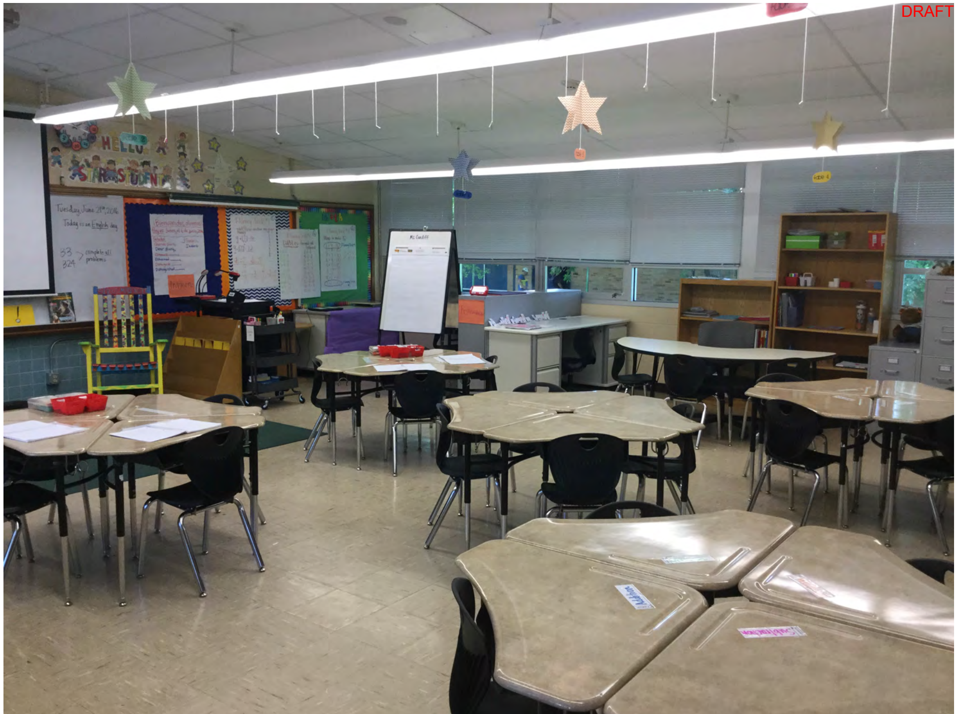
Photo 7. 4.2 Standard Classroom