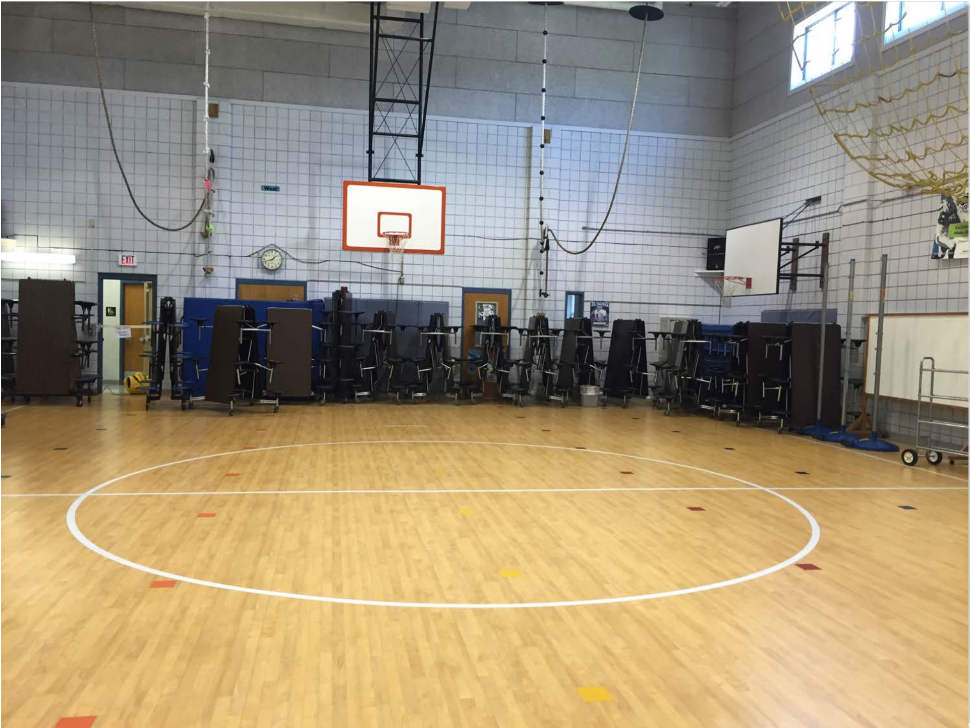
Photo 2. Gym