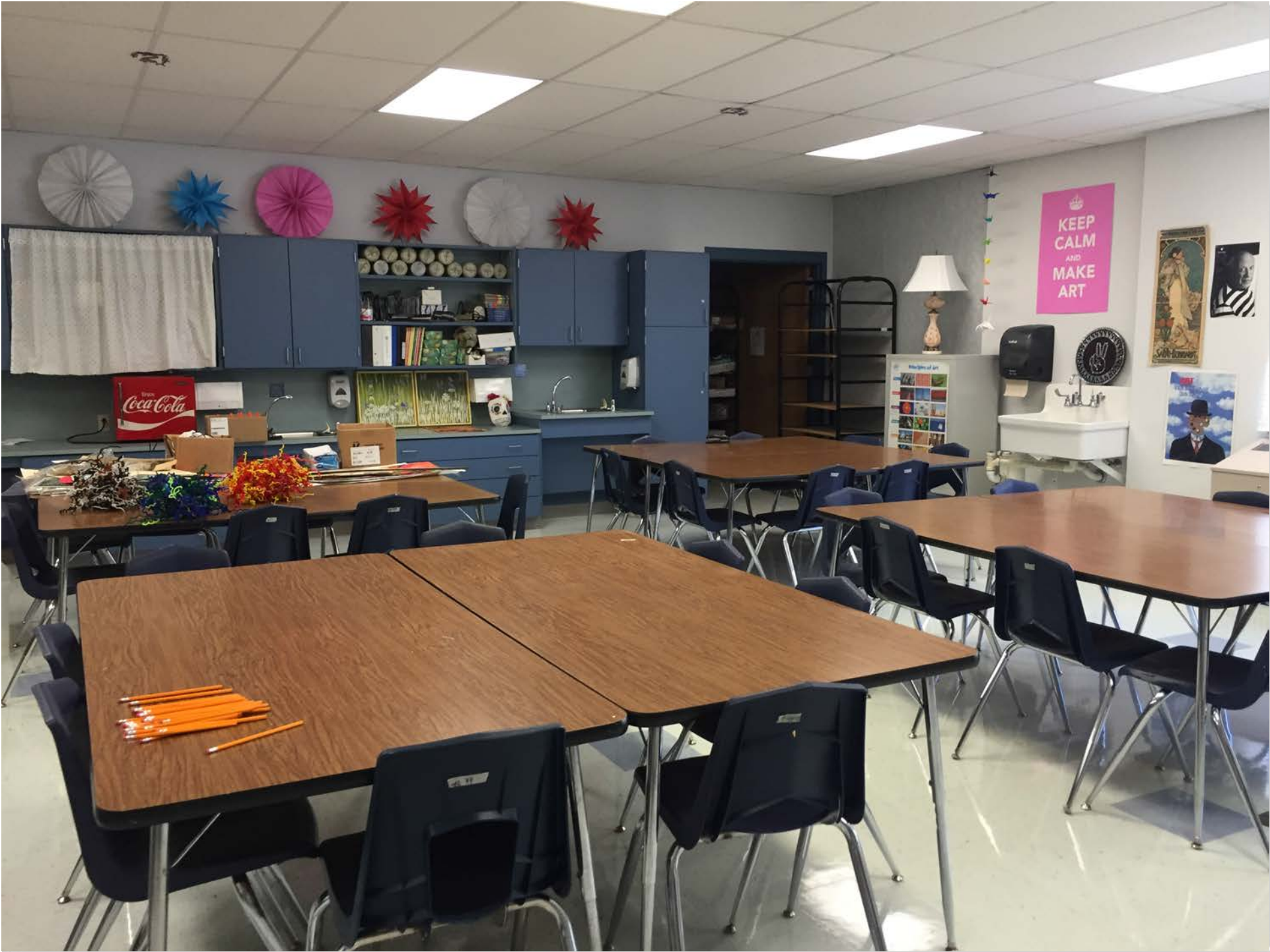
Photo 4. Art