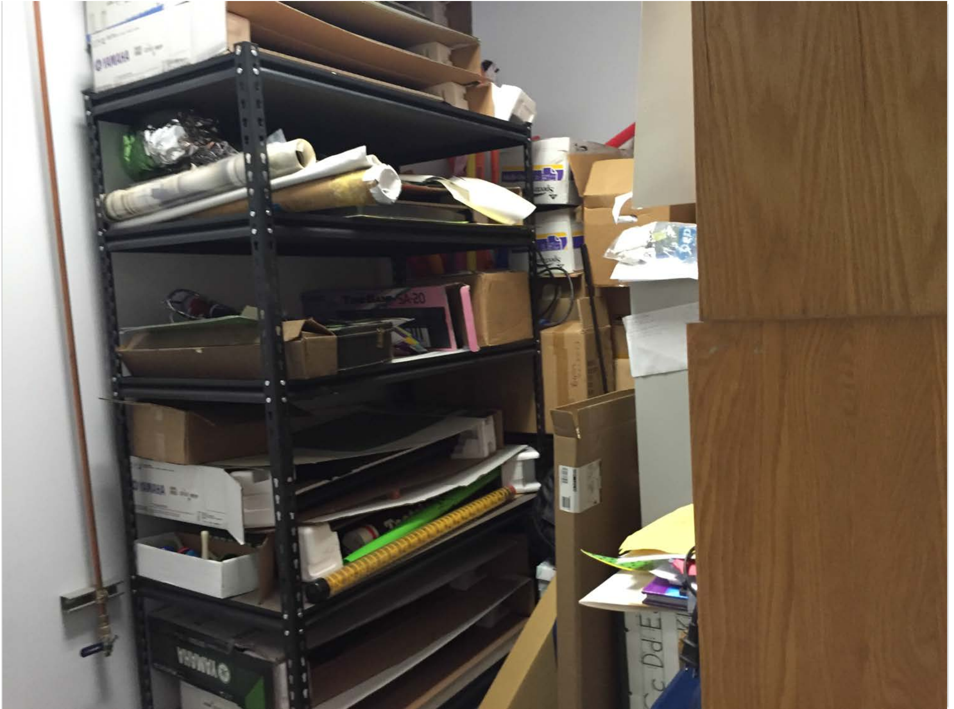
Photo 3. Band Storage