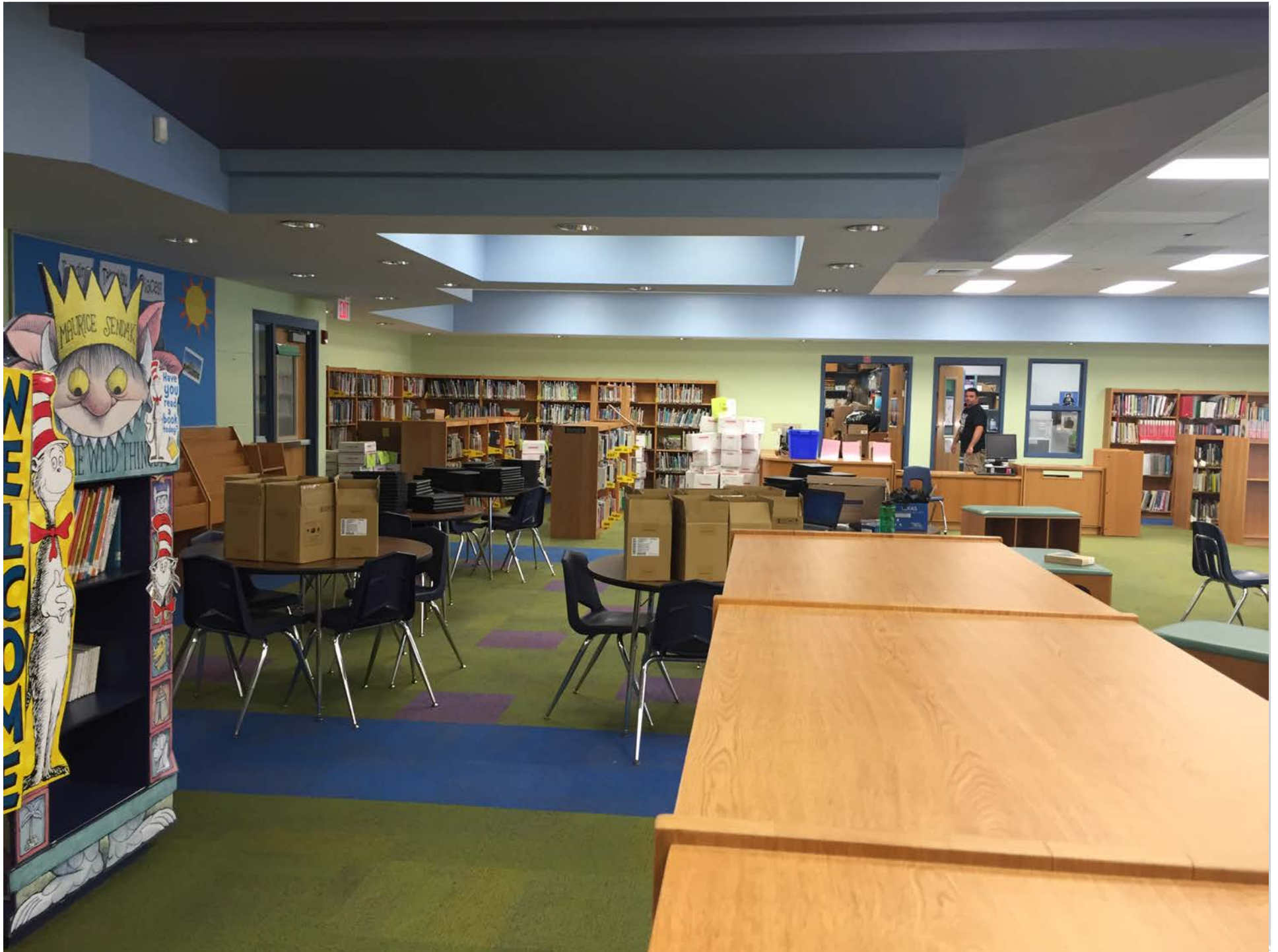
Photo 8. Library