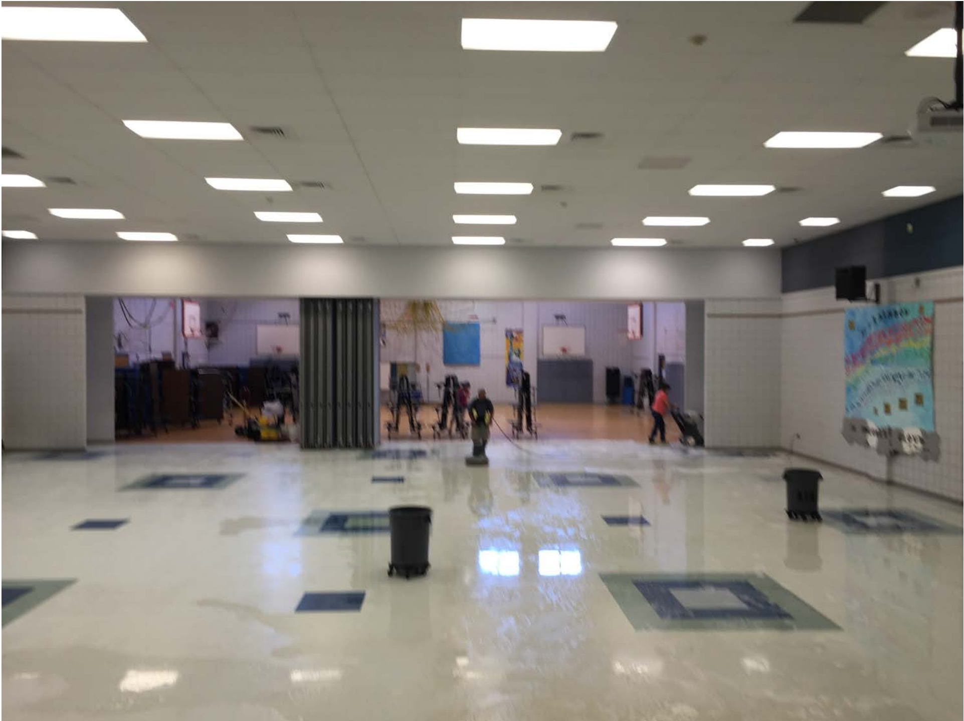
Photo 6. Cafeteria