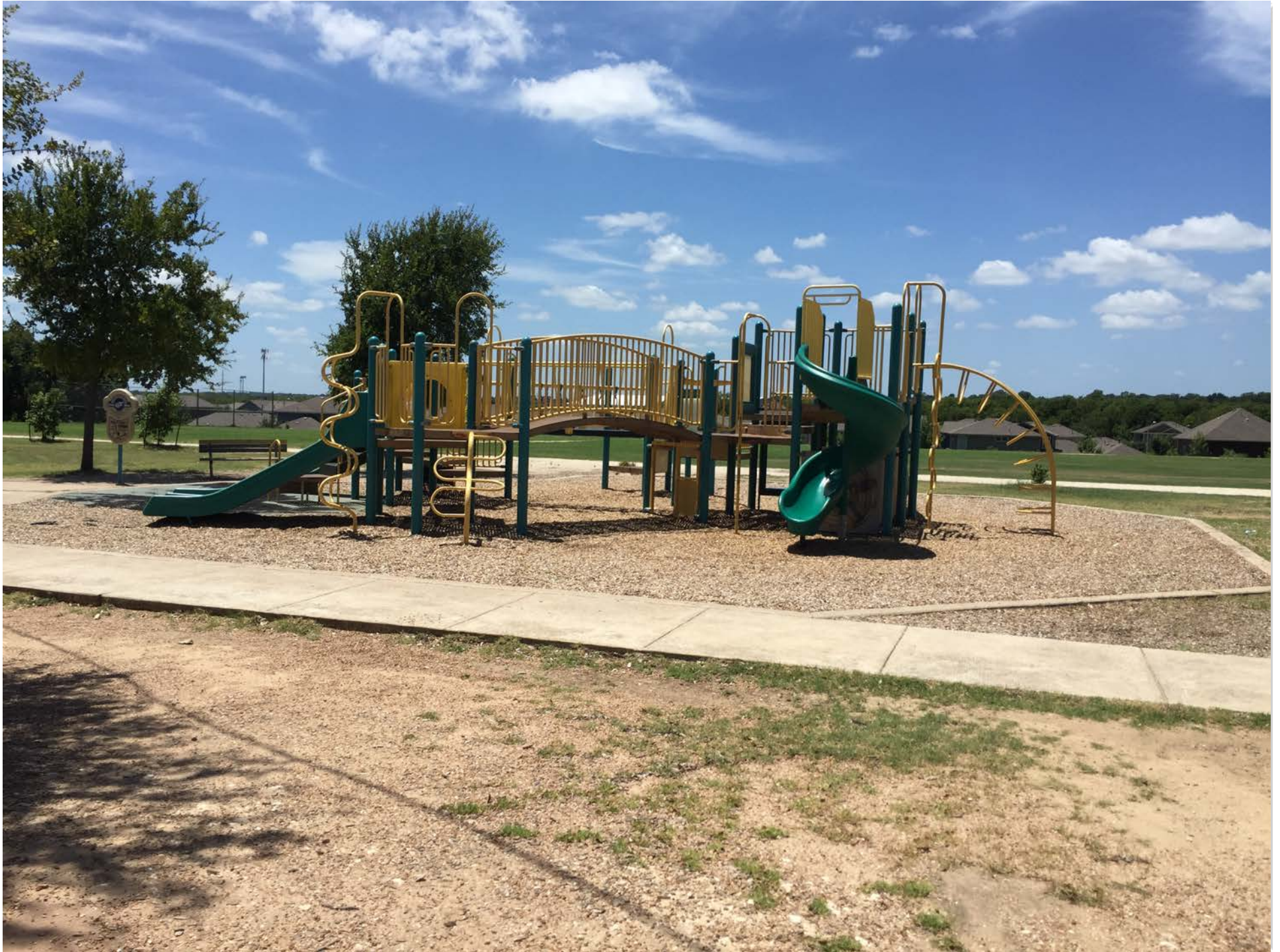
Photo 1. Playground