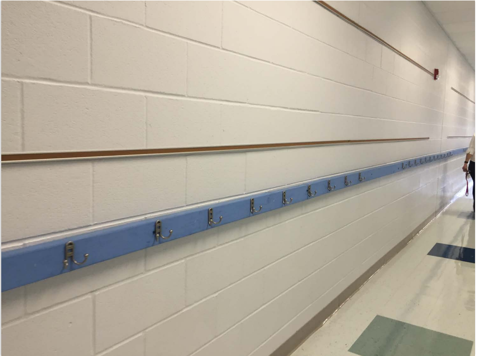
Photo 9. Student Storage