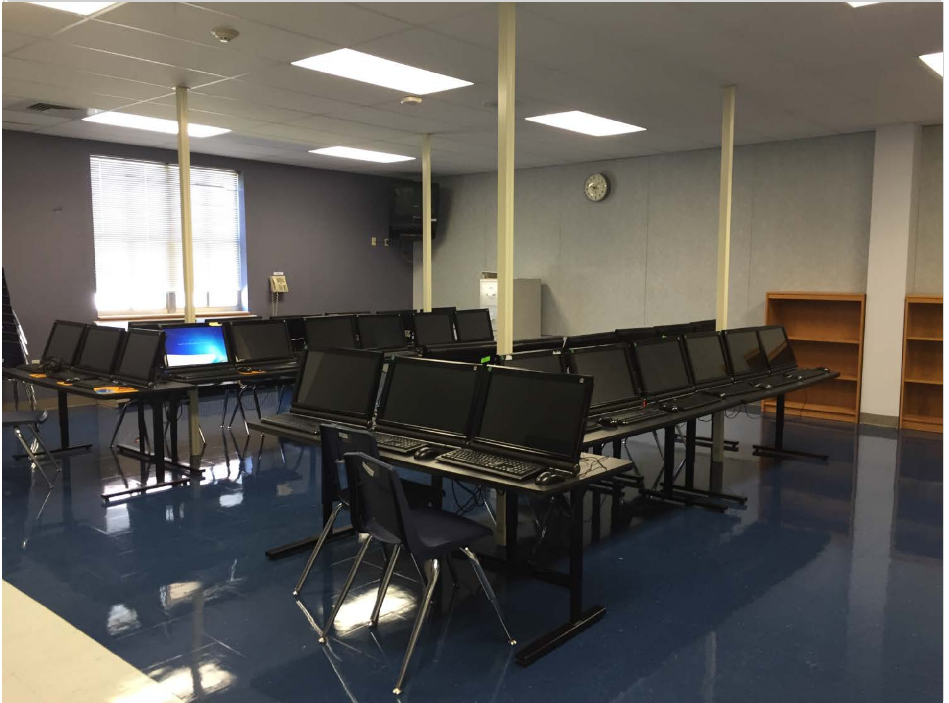
Photo 5. Computer lab