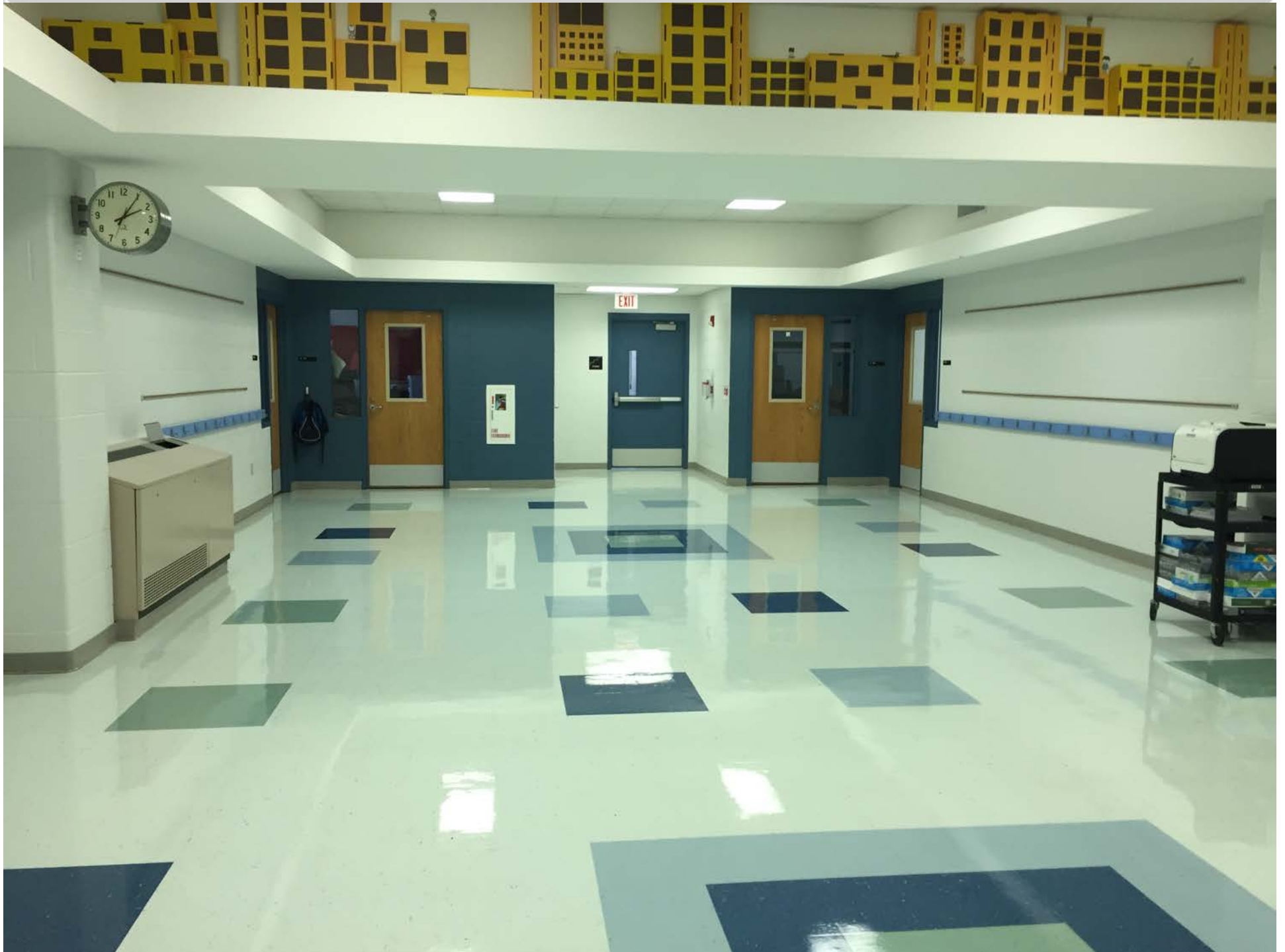
Photo 7. Common Space