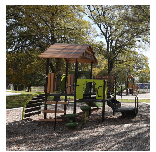
T.A. Brown ES Outdoor Learning