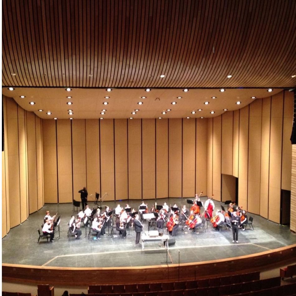
Rehearsal at the Performing Arts Center

Performing Arts Center - The district-wide facility will host band, orchestra, dance and theatre performances and visual art exhibits.