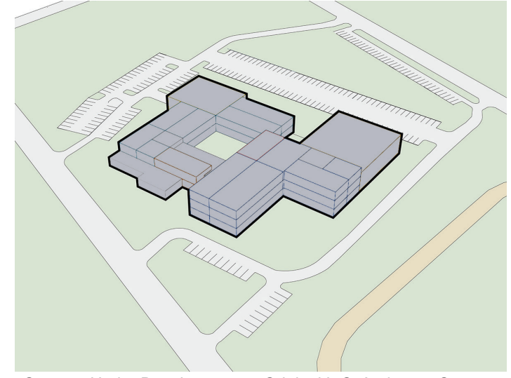
Current Eastside Memorial ECHS Campus