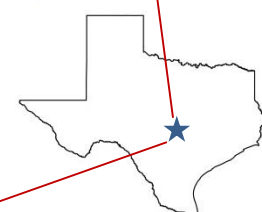
AISD covers an area of 230.3 square miles, and is located in Central Texas along the Colorado River, within Travis County and the capital city of Austin